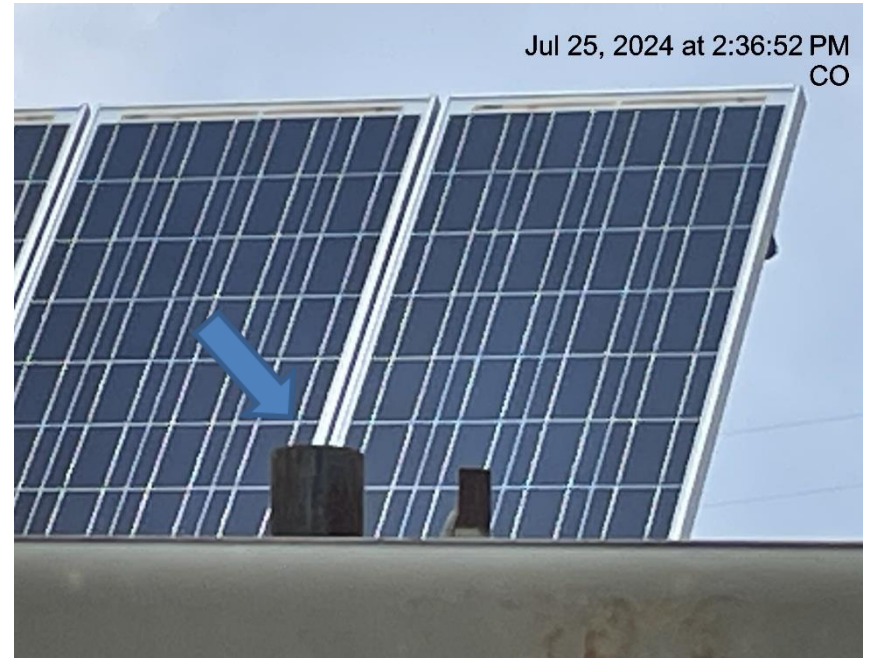
Photo # 3512 PRV vent line on separator unit does not comply with CECMC pressure safety device rules