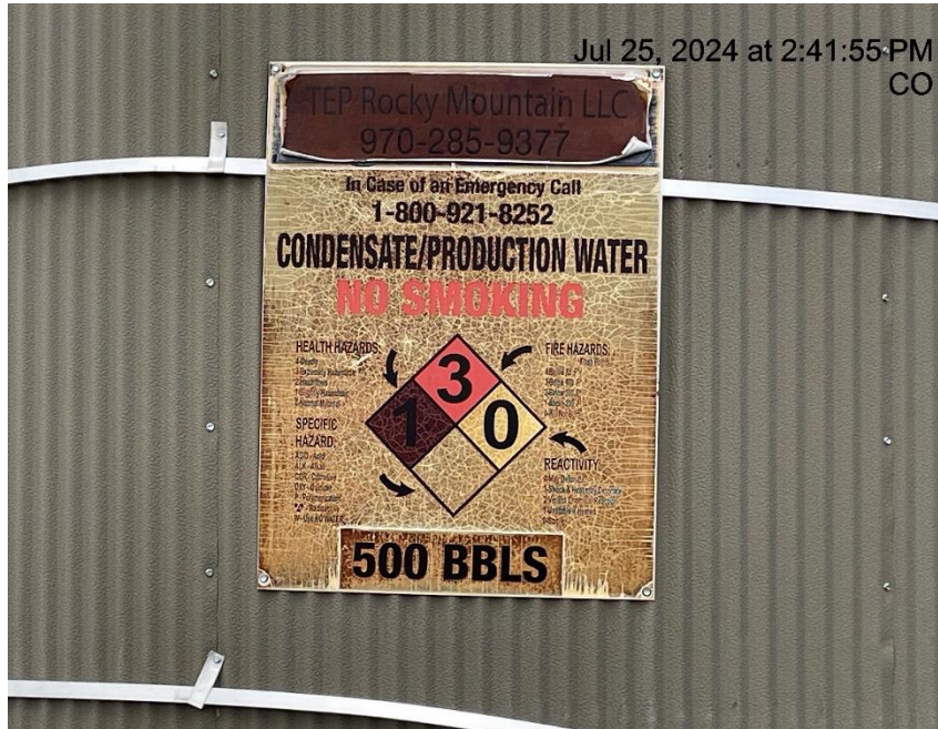
Photo # 3513 Tank label weathered & some required info is starting to become illegible