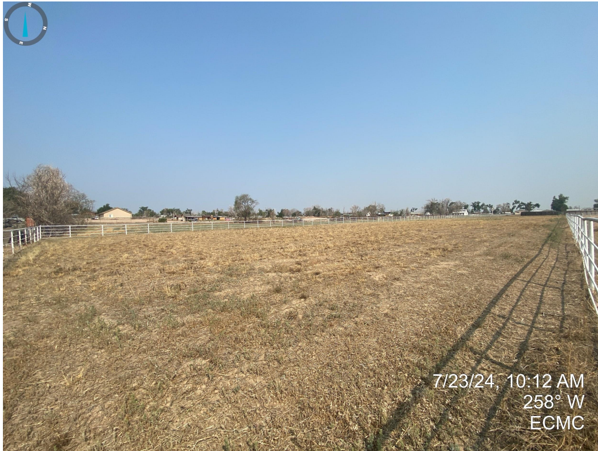
Photo 4. Southwest interim areas, facing west. See comments in Photo 1.