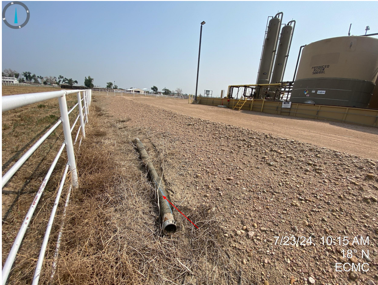
Photo 7. Unused equipment observed west of tank battery.