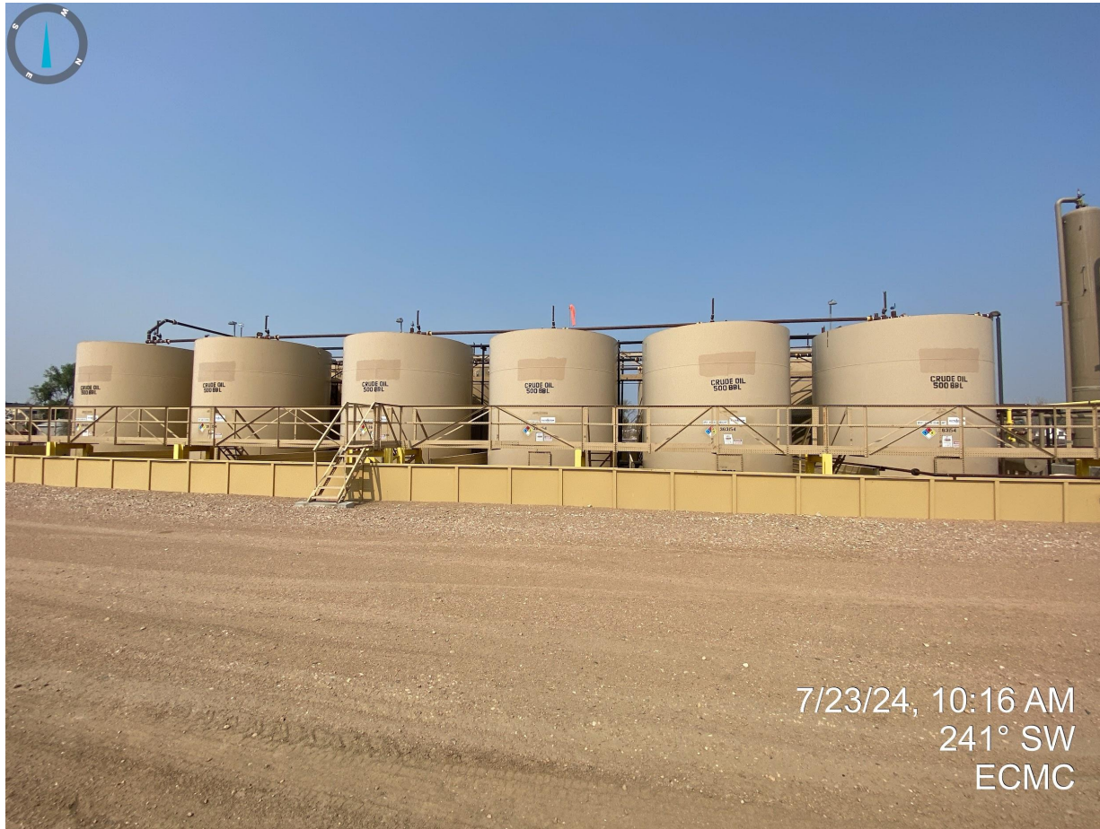
Photo 8. Tank labels have been replaced, east side of tank battery.