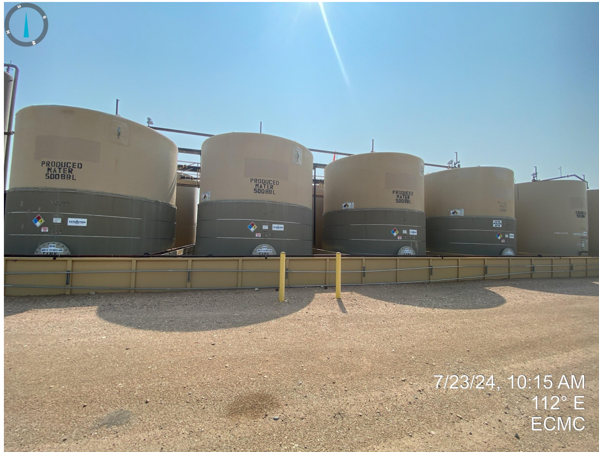
Photo 6. Tank labels have been replaced, west side of tank battery.