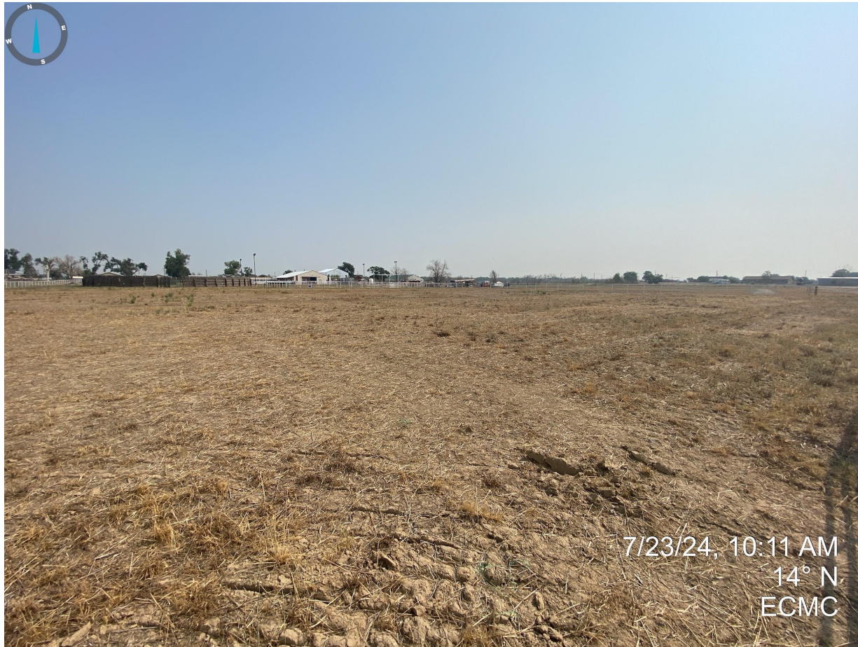
Photo 2. Northwest interim areas, facing north. See comments in Photo 1.