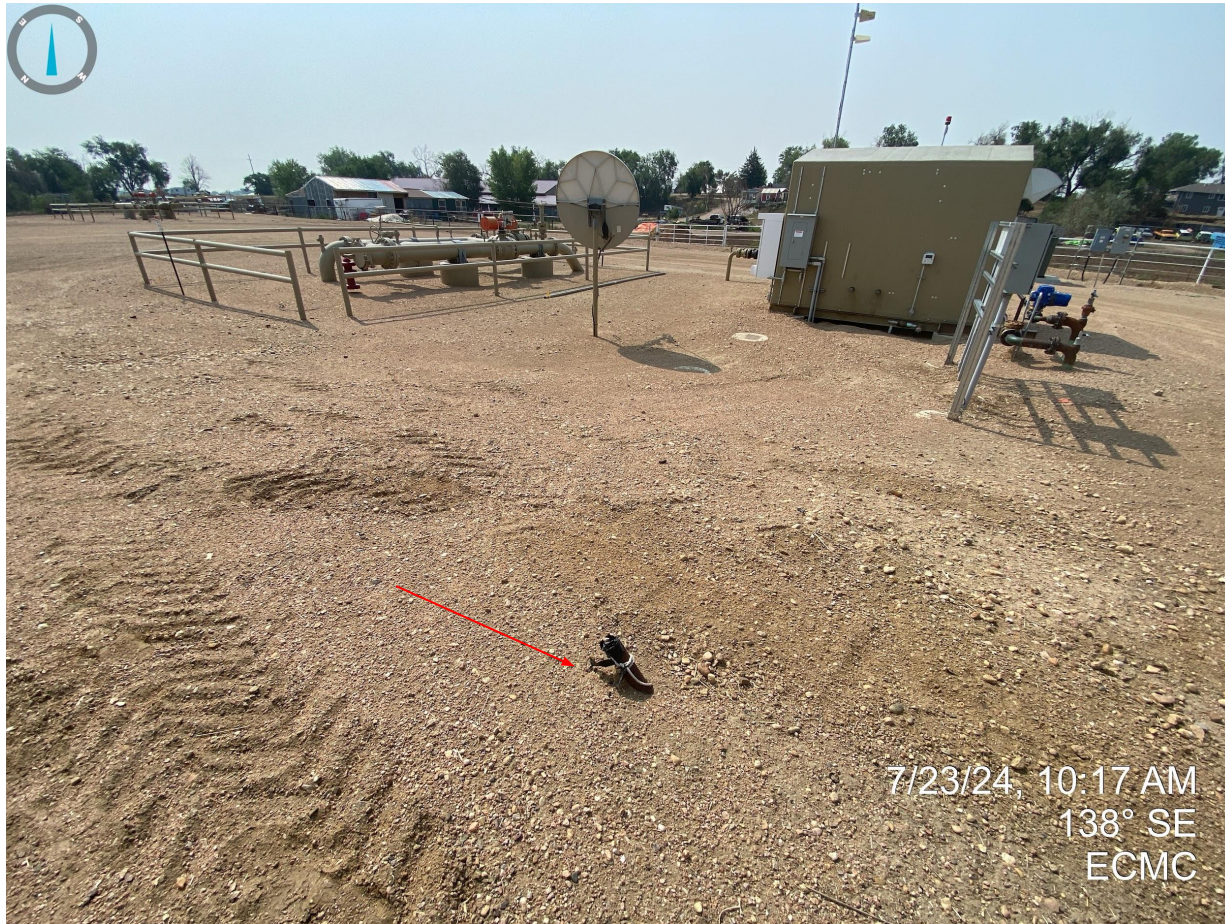
Photo 10. Unmarked riser/unused equipment, south of compressor station, remains on location.