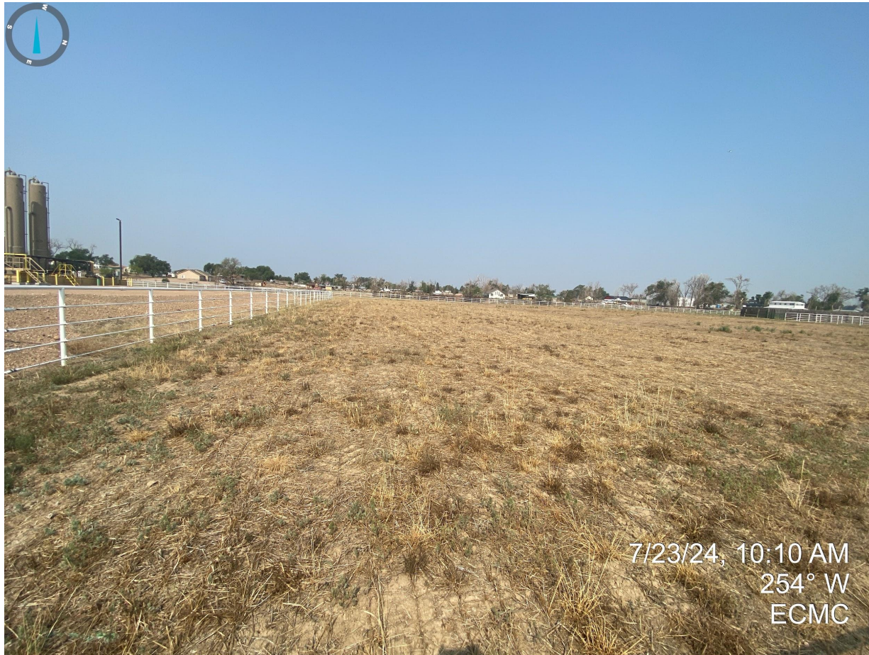
Photo 1. Northern interim areas appear to have been reclaimed with evidence of drill rows and crimped mulch.