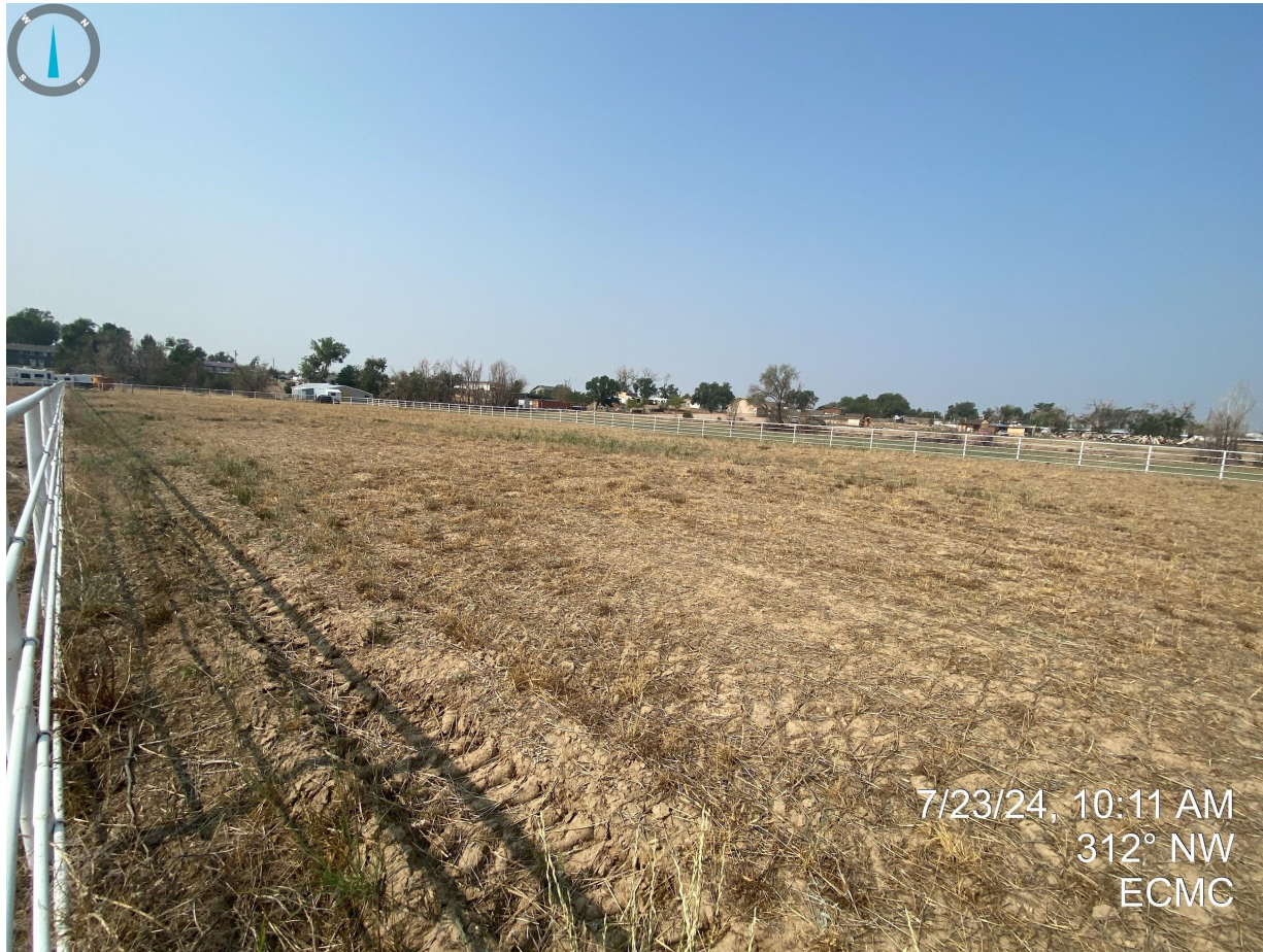
Photo 3. West interim areas, facing northwest. See comments in Photo 1.