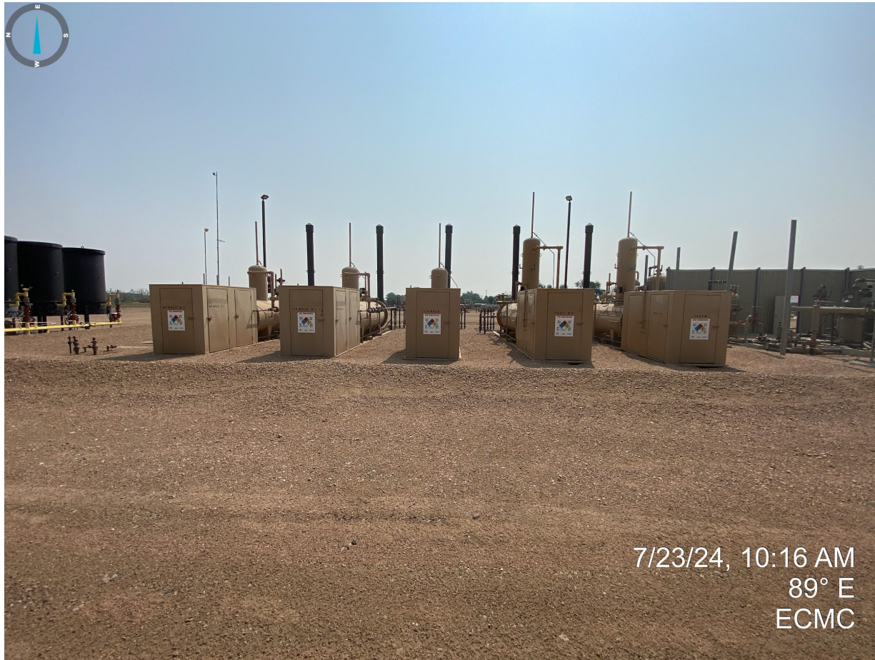
Photo 9. NFPA Placards and labels have been replaced.