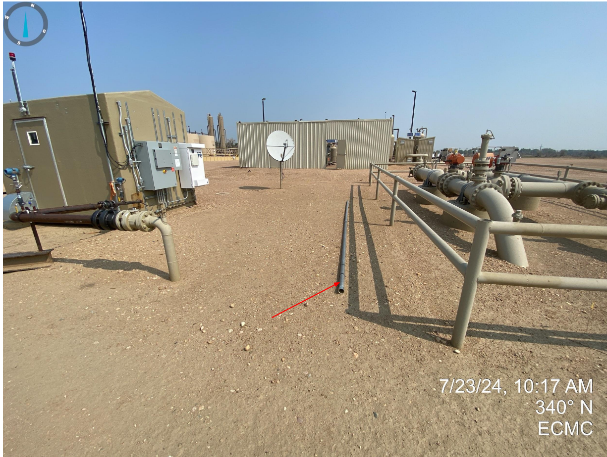
Photo 11. Unused equipment south of compressor station does not appear to have been removed or returned to service.