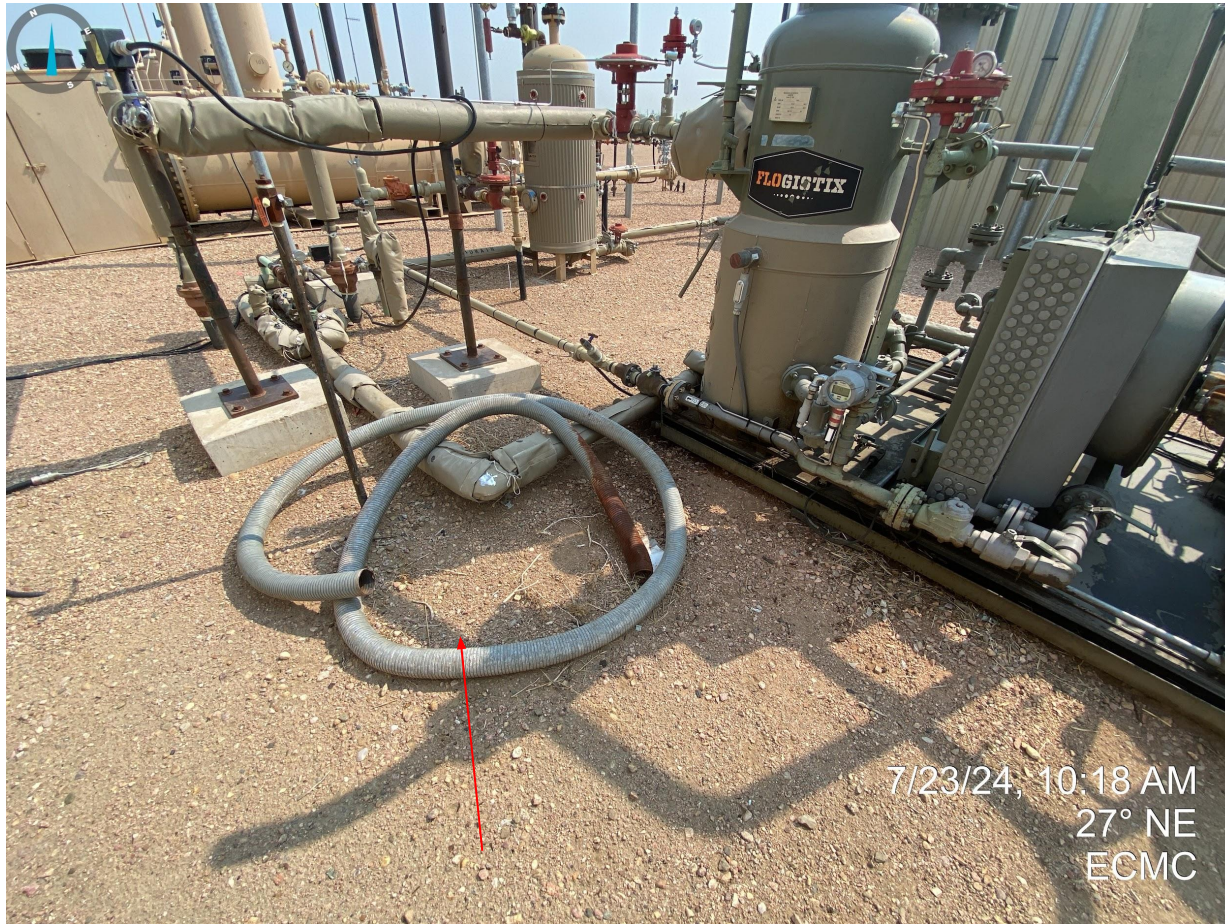
Photo 12. Unused equipment within compressor station does not appear to have been removed or returned to service.