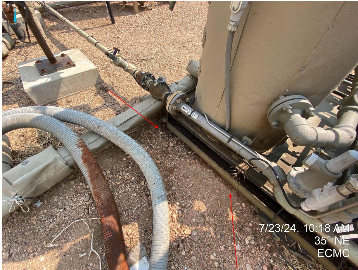
Photo 13. Stained soil does not appear to have been properly disposed of.