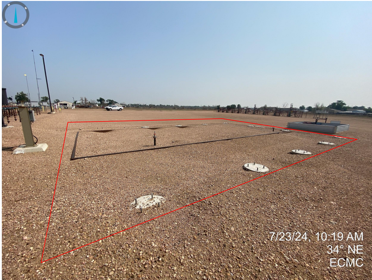
Photo 14. Unused equipment does not appear to have been removed or returned to service.