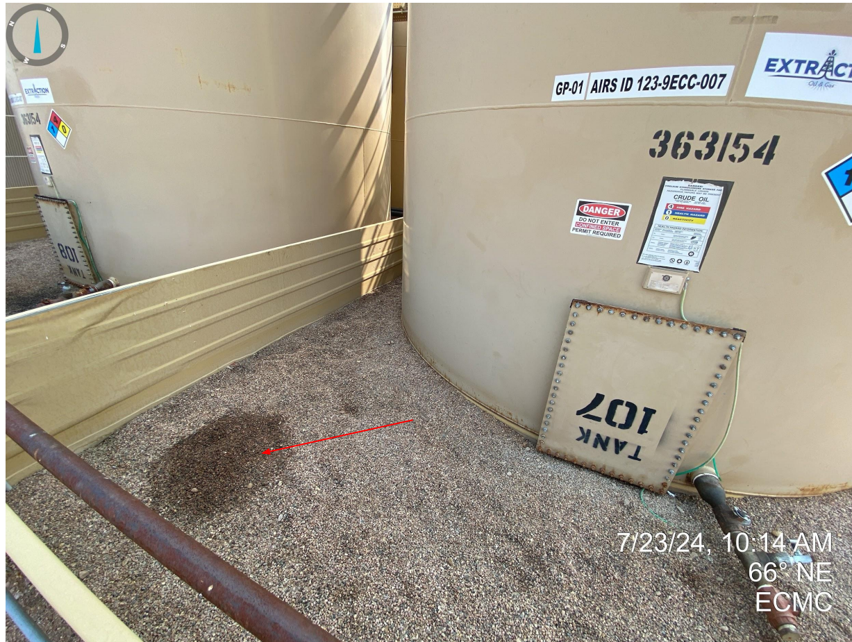
Photo 5. Stained soil within SW portion of tank battery.