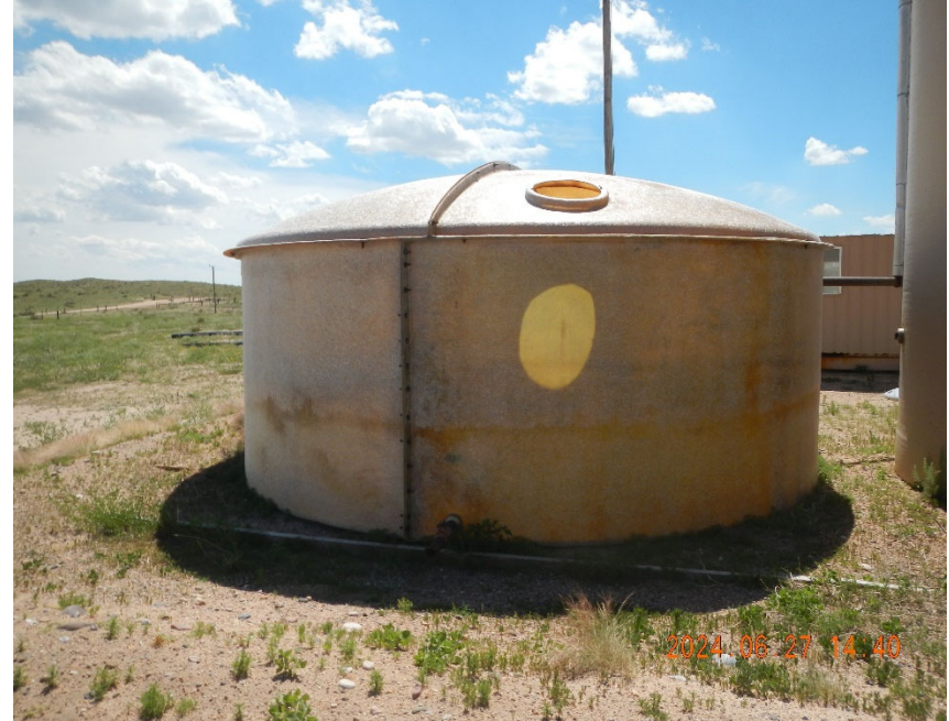
10. View of 200 BBL Fiberglass tank. Note missing labels, missing hatch cover, and vegetation.