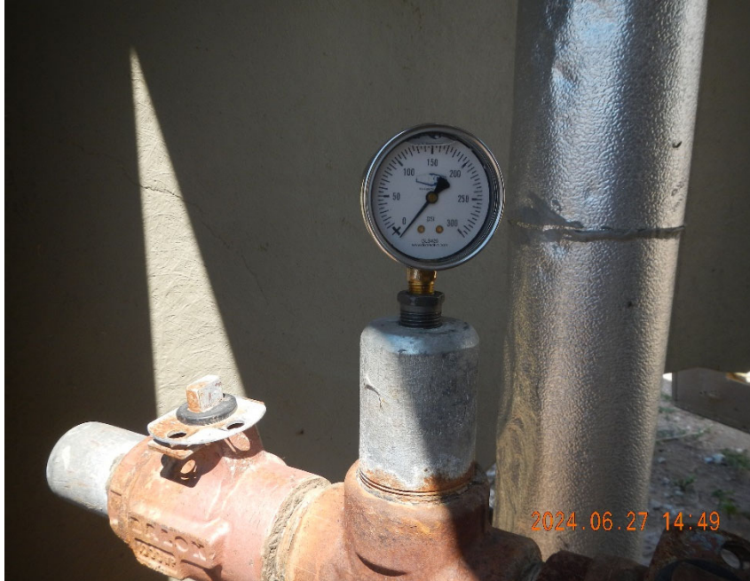
5. Casing pressure at time of inspection.