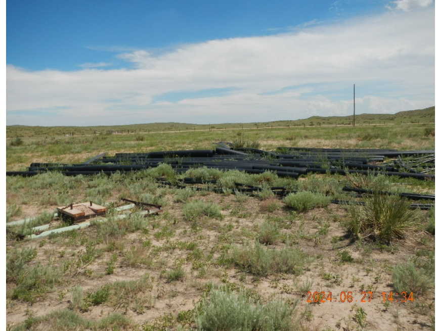
6. Debris and unused equipment on location. Note vegetation.