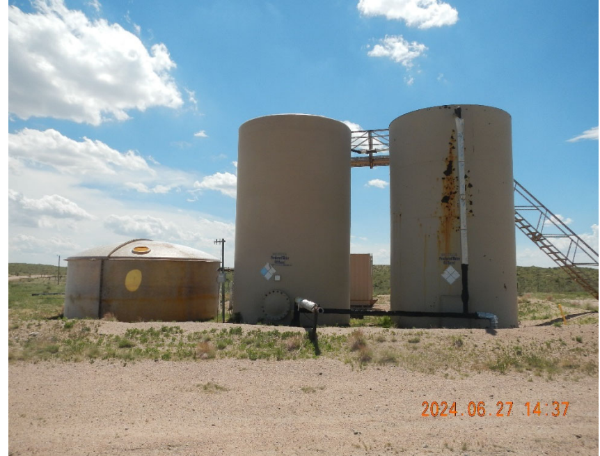
8. View of Tank Battery. Note vegetation.