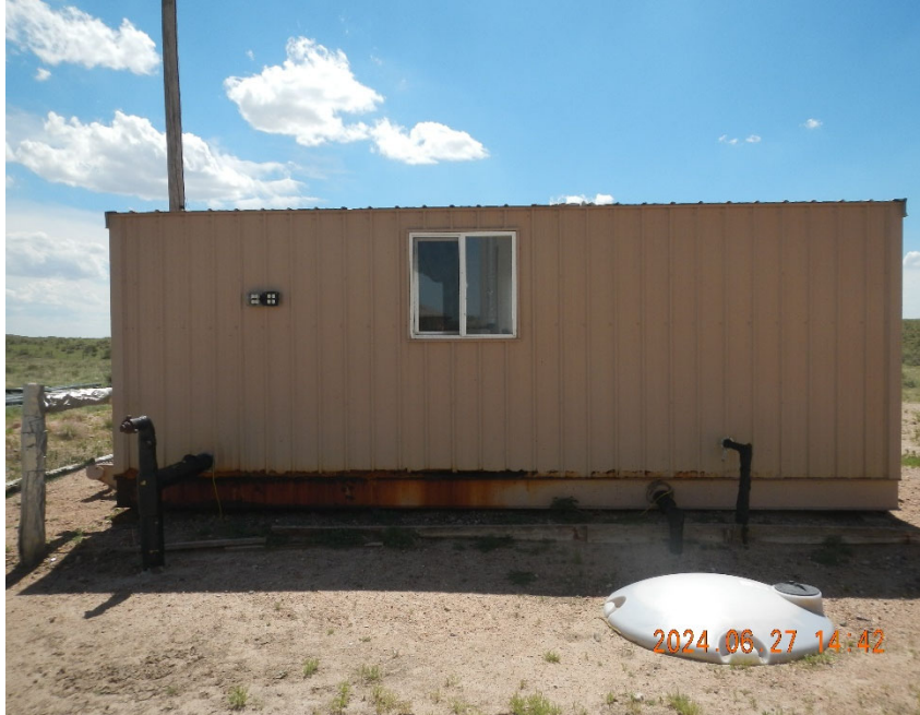
11. View of the backside of Injection Building and buried plastic tank.