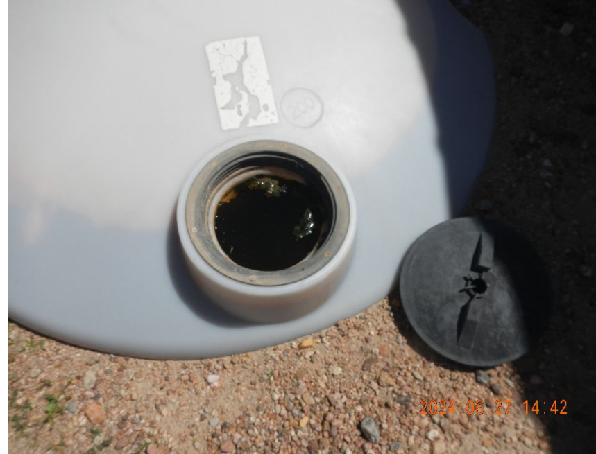
12. Tank has no labels or sign and is completely full at time of inspection.