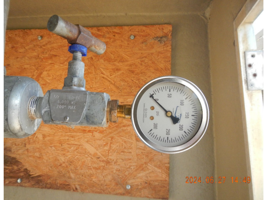
4. Tubing pressure at time of inspection.