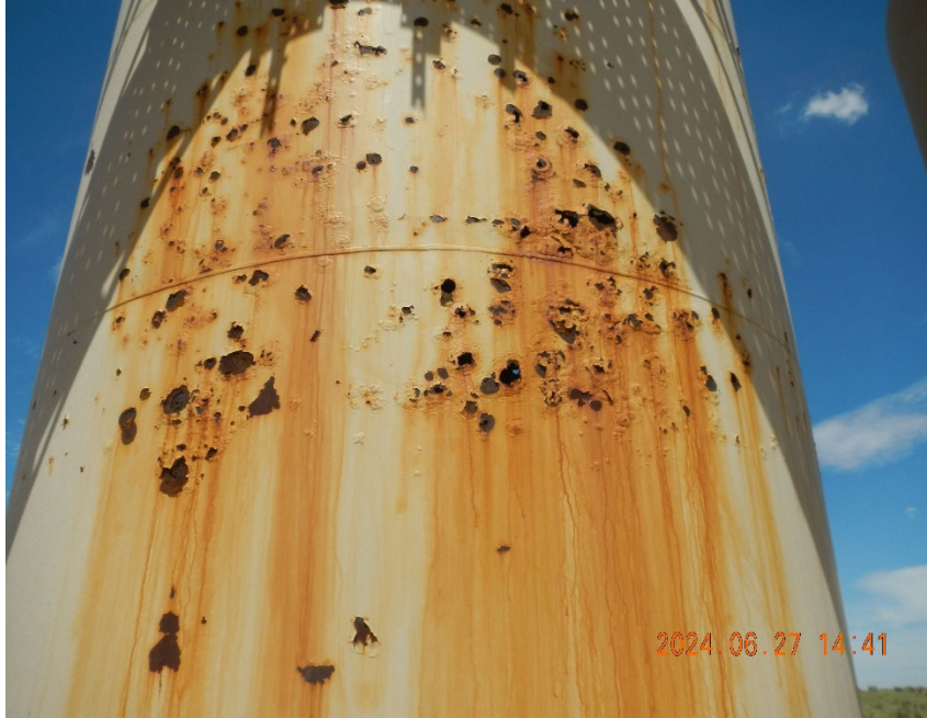
9. View of steel 400 BBL tank. Note rust streak and holes in tank walls.