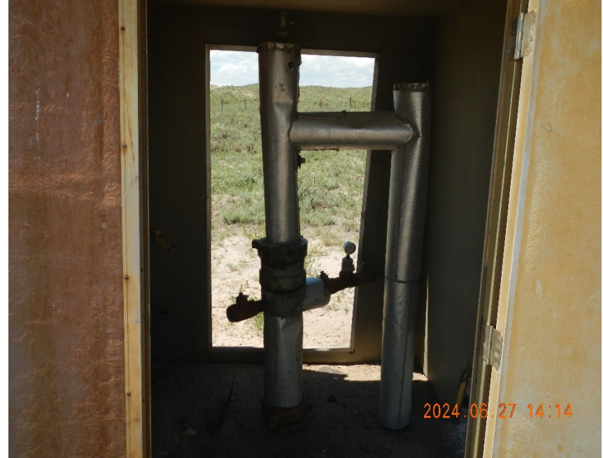
2. View of wellhead.