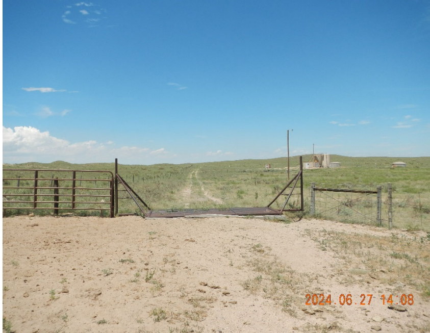
13. Two track access turn off from maintained CR.