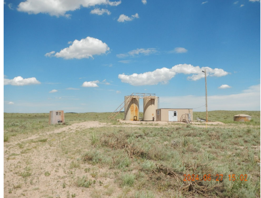
16 Location overview. Note vegetation.