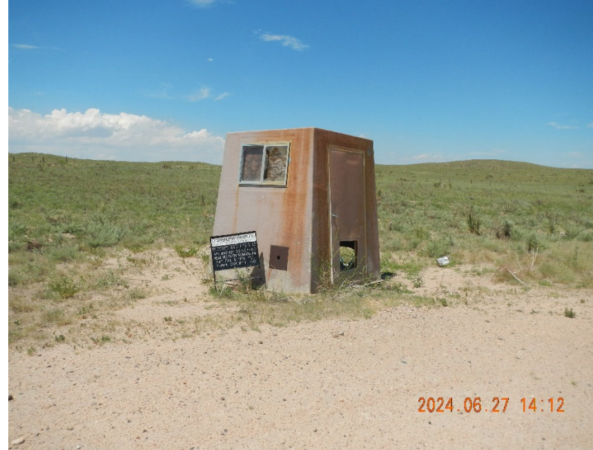
14. Well site overview.