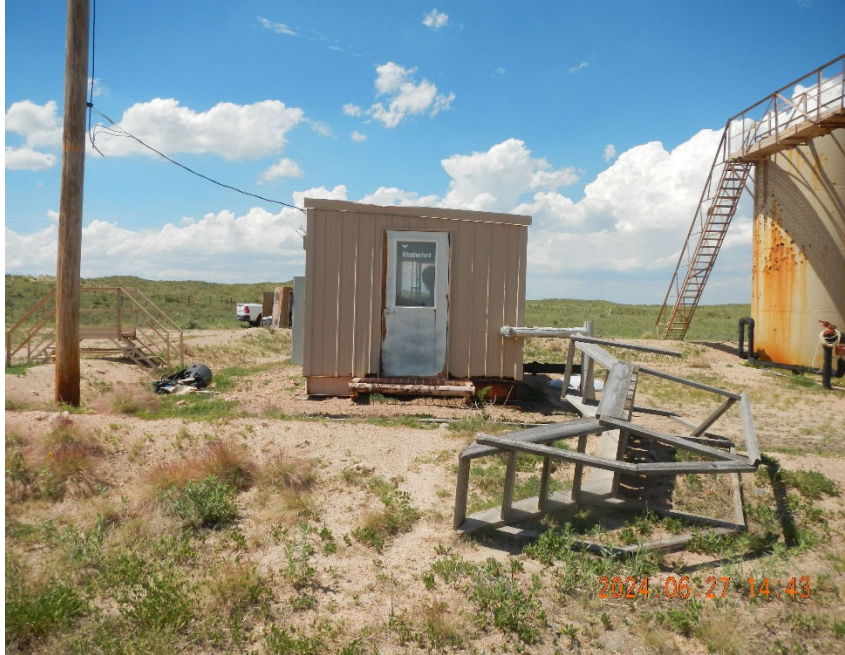
15. Overview of area around Injection Building. Note trash, vegetation, and unused equipment.