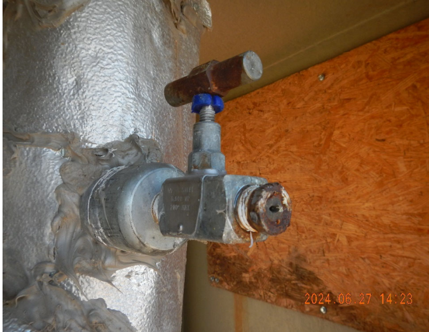
3. Open valve with broken off pressure gauge stem still in valve.