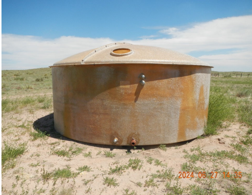
7. Unused tank on location. Note missing hatch cover.