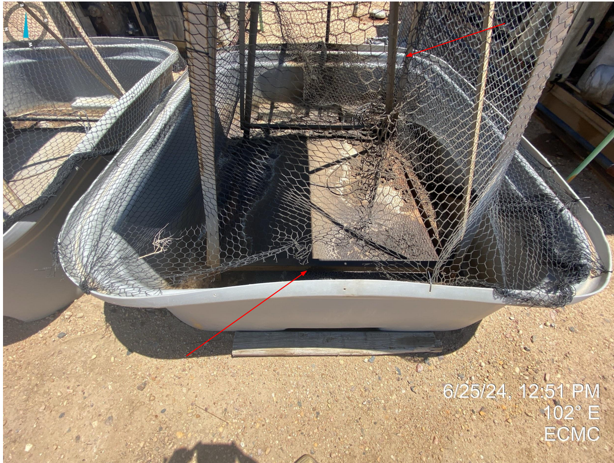
Photo 8. Wildlife netting requires repair/replacement.