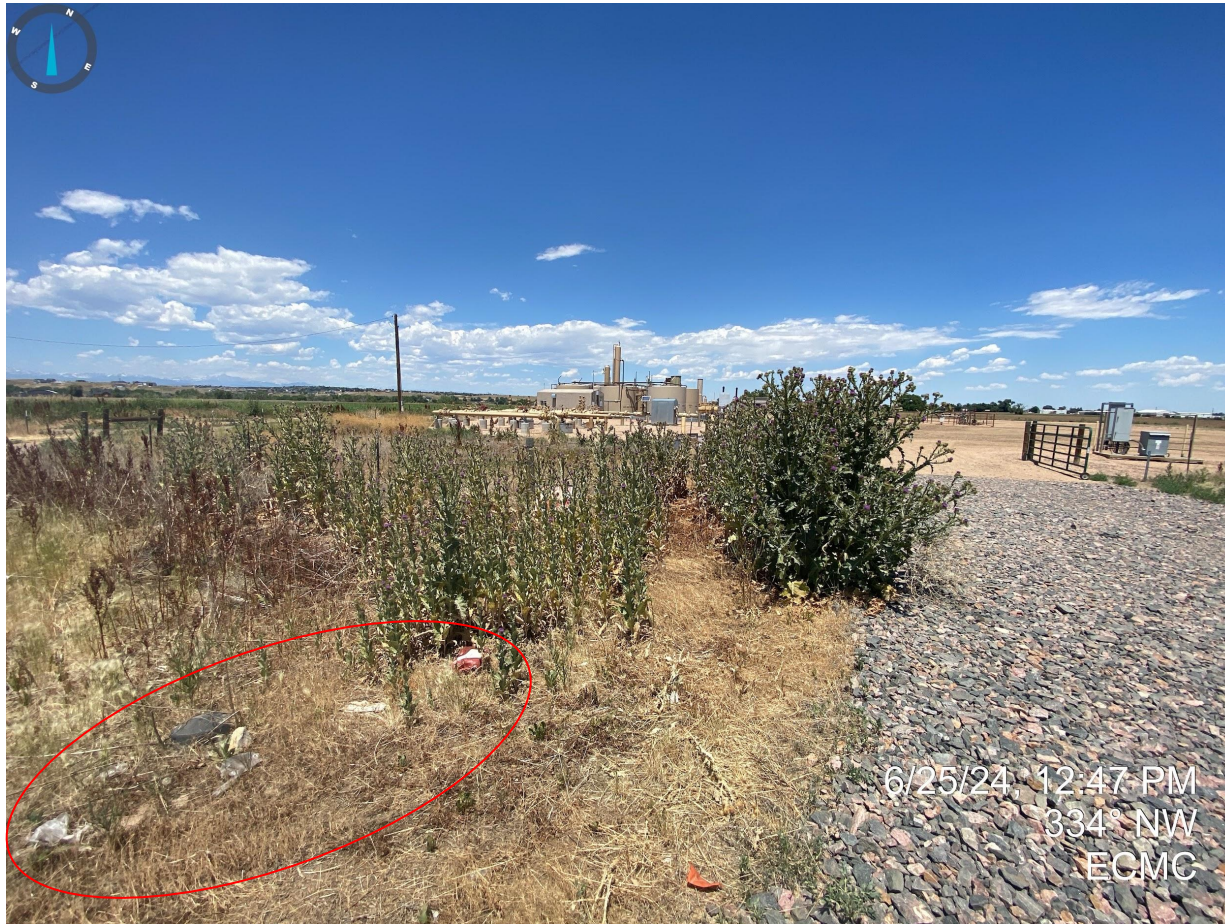
Photo 2. Continued from Photo 1. Also pictured, trash and debris.