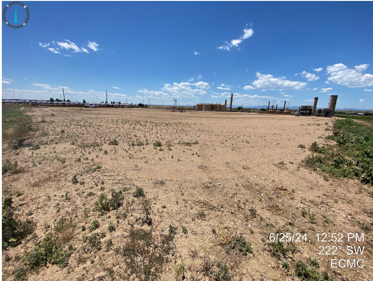
Photo 10. Northeast corner of the location. Weeds along the northern and eastern portions appear to have been sprayed with herbicide. The southern portion of the location near the entrance does not appear to have been sprayed; refer to Photos 1-5 for additional.