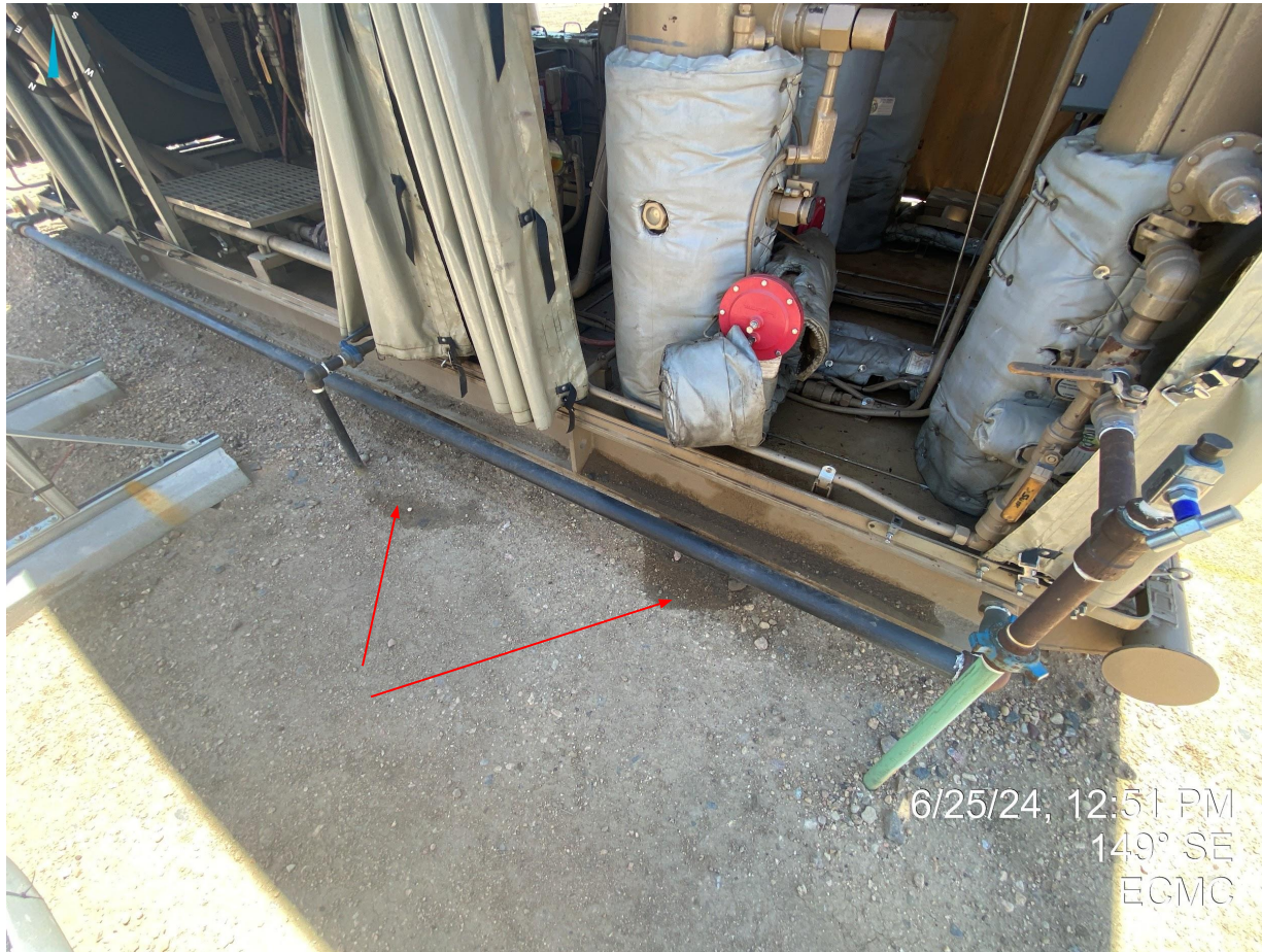
Photo 6. Stained soil at compressor skid.