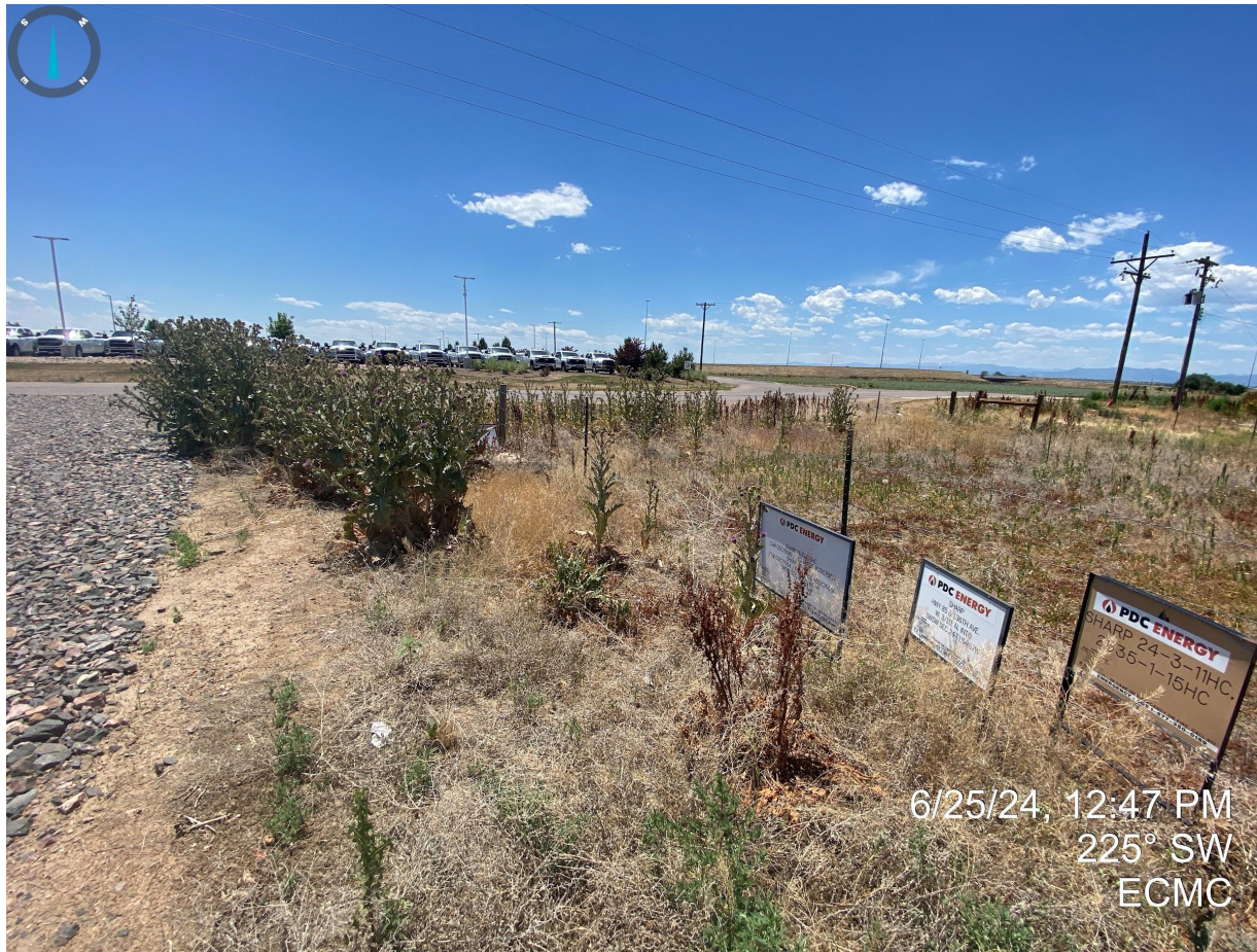
Photo 1. Undesirable vegetation (kochia, curly dock) and CO Noxious Weeds (List B - canada thistle, scotch thistle; List C - cheatgrass) observed at the location entrance. This portion of the location does not appear to have been managed for weeds.