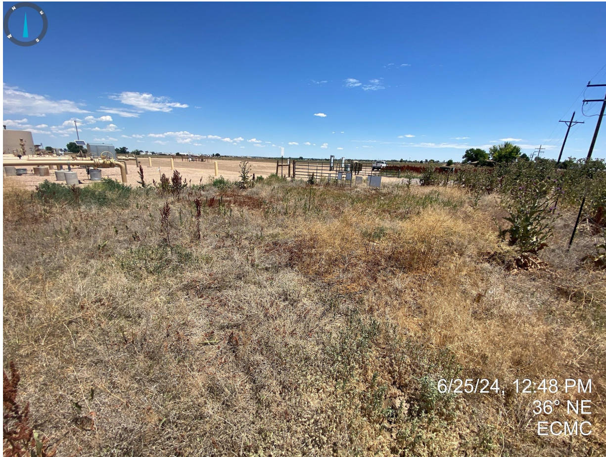
Photo 5. Southwest portion of the location; See comments in Photo 1.