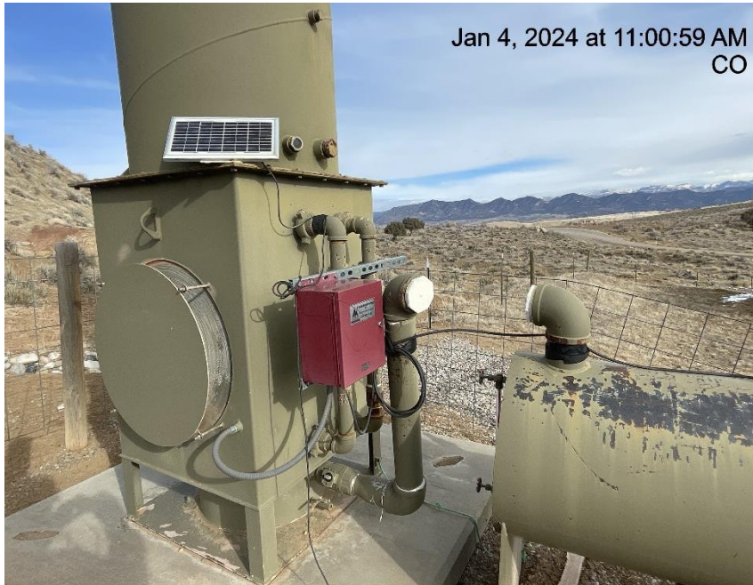
Photo # 1727 From inspection 708902717 conducted on 01/04/2024 Unused equipment – ECD disconnected