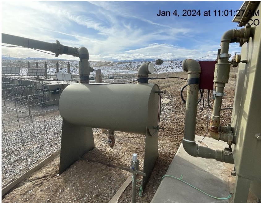
Photo # 1728 From inspection 708902717 conducted on 01/04/2024 Unused equipment – ECD disconnected