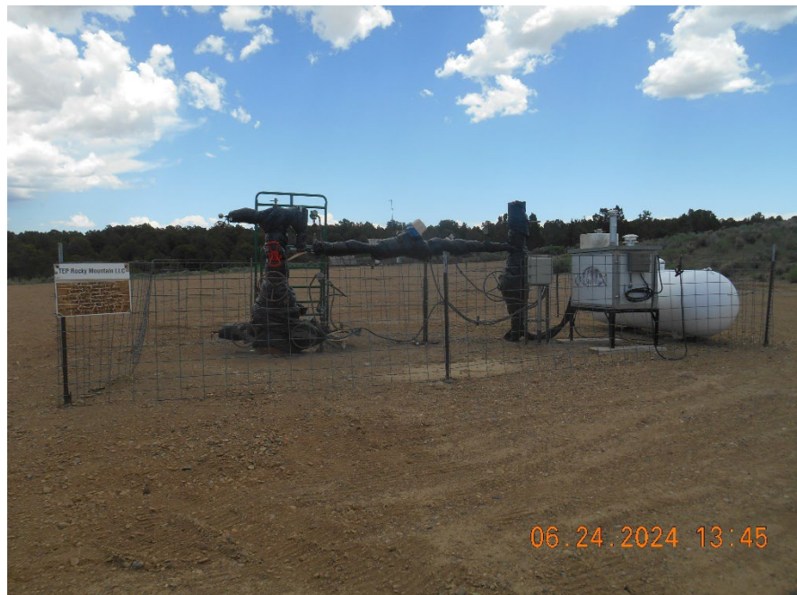
Injection wellhead and line heater

Inspection Date: 6/24/2024 Inspection Doc#: 693807448