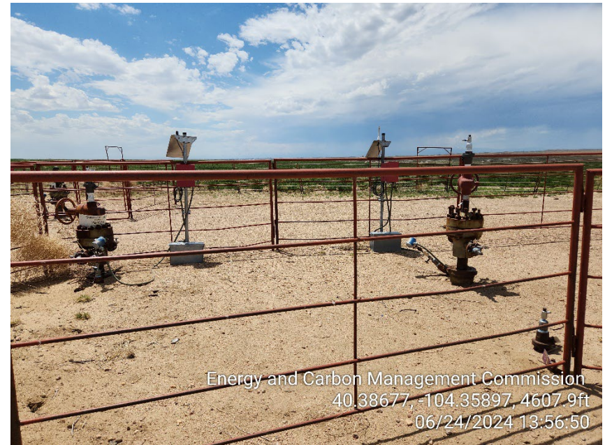
Photo 8 – Wellheads – 42-19 Sign is on wrong well not 19G Sign is missing