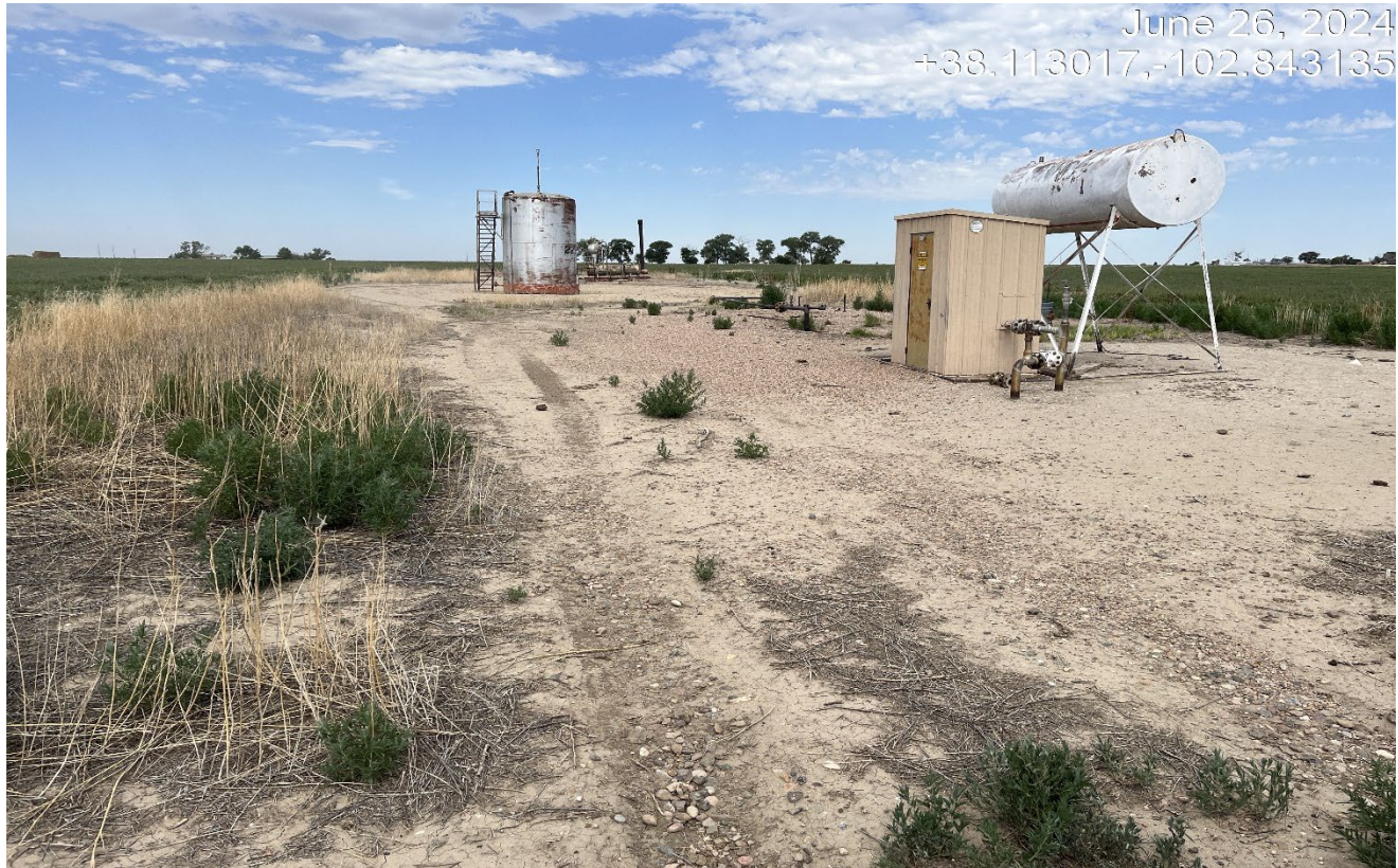
Photo 1. Facing west toward the location. There are tall undesirable weeds at the location that need to be controlled and removed. Previous CA was not completed.