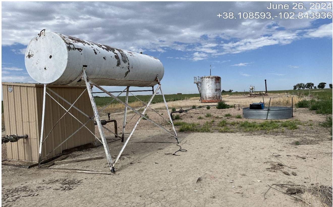
Photo 2. Facing toward the meter shed. There is no secondary containment of the fuel/chemical tank behind the shed.