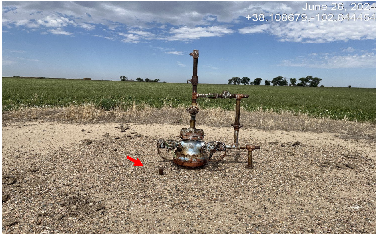
Photo 8. Facing toward the well. There is an uncapped pipe riser shown at red arrow.