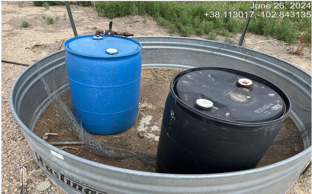
Photo 3. There are plastic drums with no labeling and one appears to be empty and not in use.