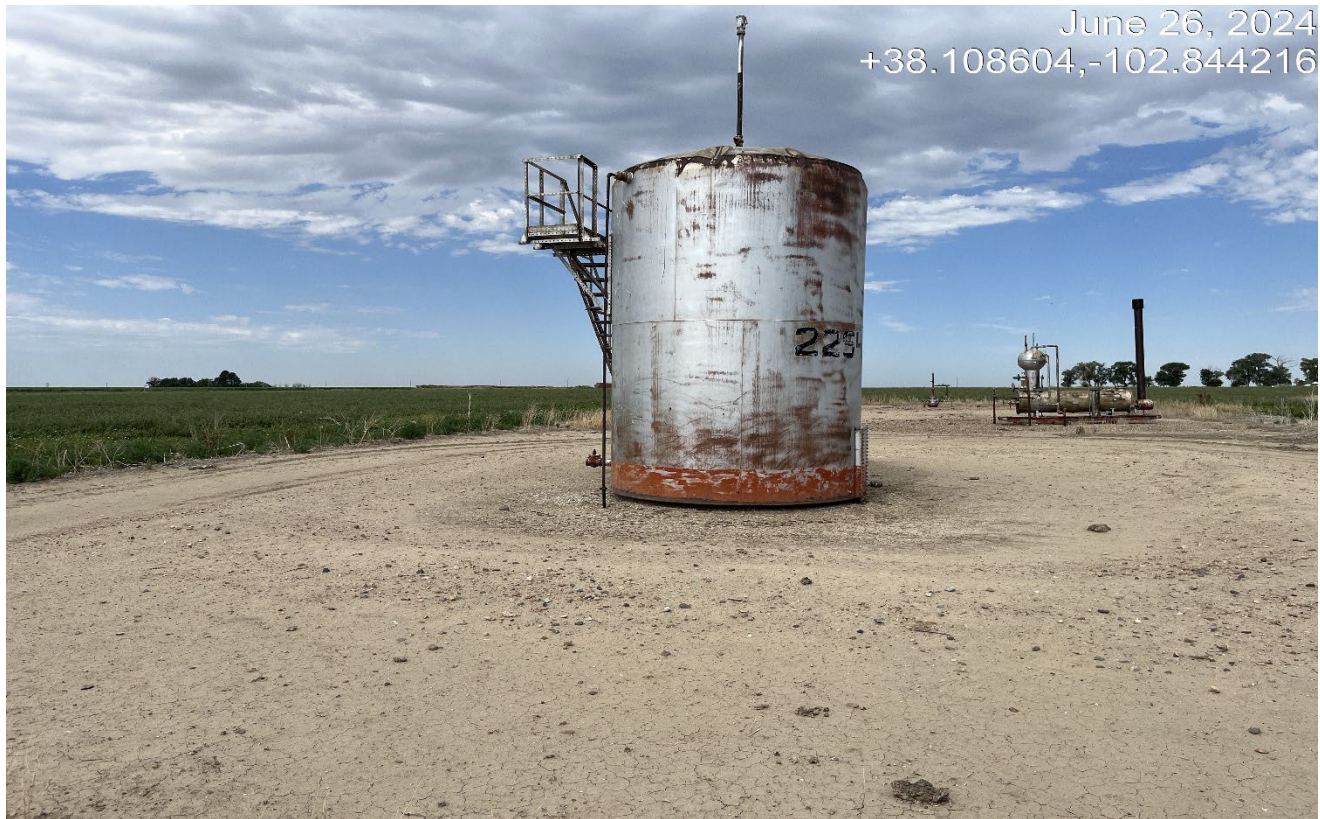
Photo 4. Facing toward the tank battery. There is insufficient secondary containment to contain a spill. Previous corrective action was not completed.