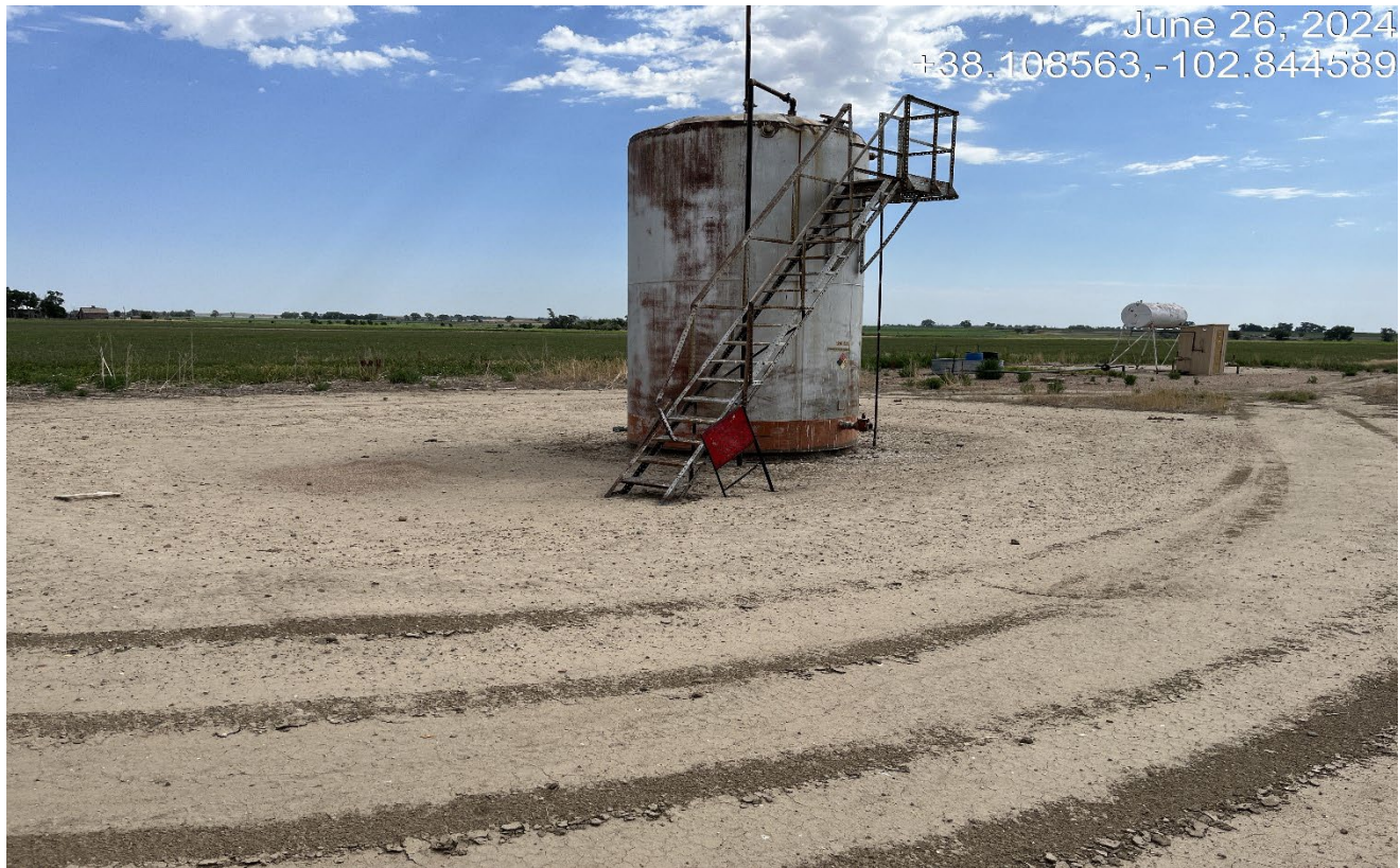
Photo 5. The sign at the tank does not reflect the current Operator sand is faded. Previous CA was not completed.