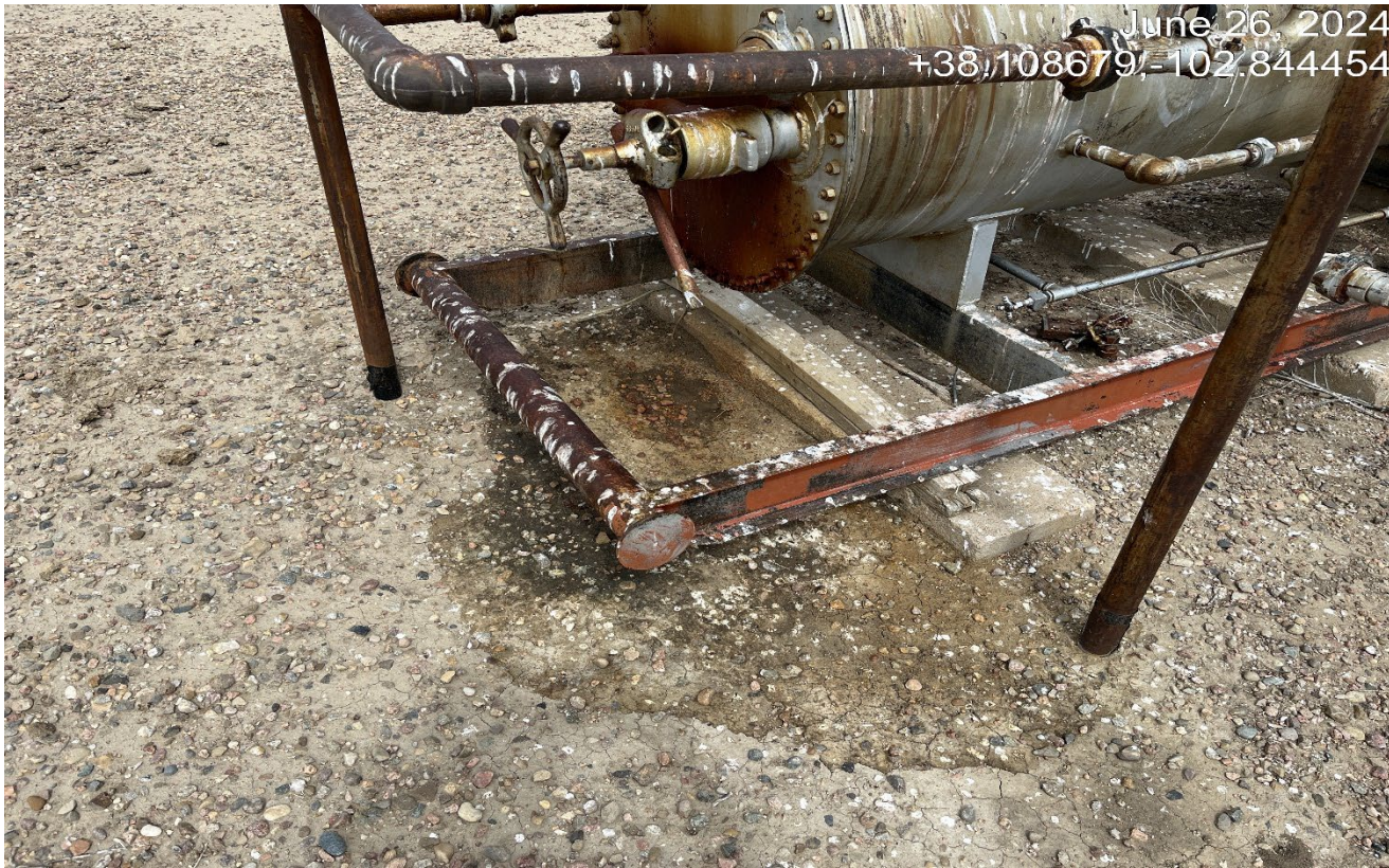
Photo 7. There is a dripping leak at the separator and stained soils. Previous corrective action was not completed.