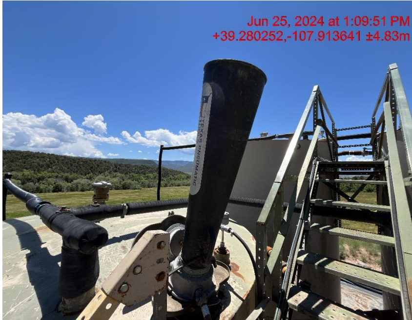
Thief hatch open to wildlife/atmosphere - Photo #03000