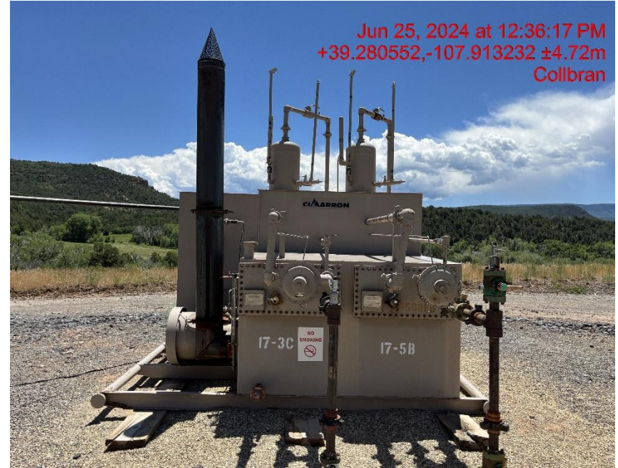
Separators - Photo #02945