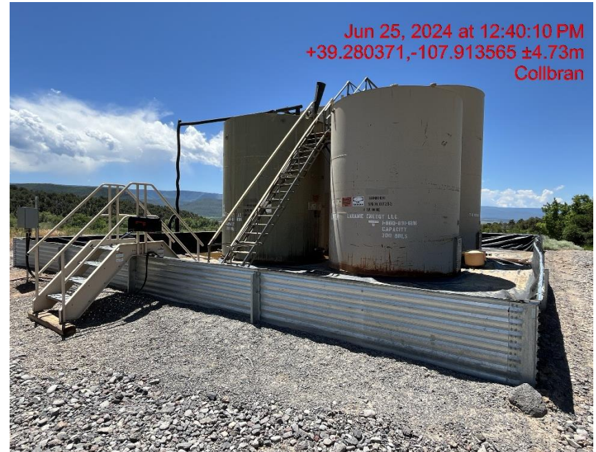
Tank battery - Photo #02954