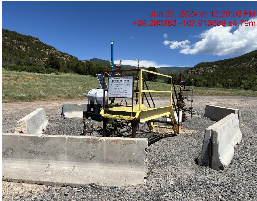
Well head and chemical tank - Photo #02939