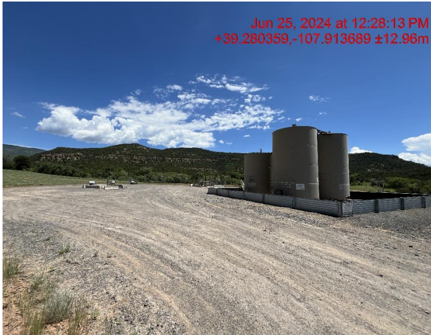
Entrance to location - Photo #02936