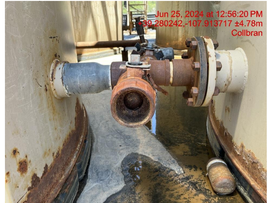
Open ended load line - Photo #02980