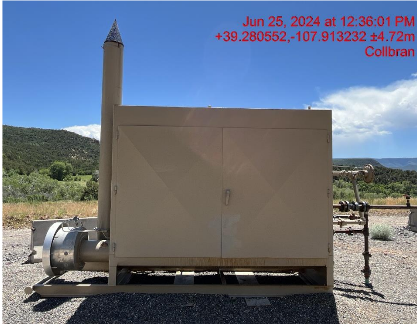
Separator - Photo #02944