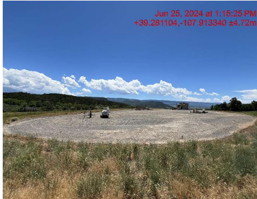
Northwest corner of location - Photo #03011