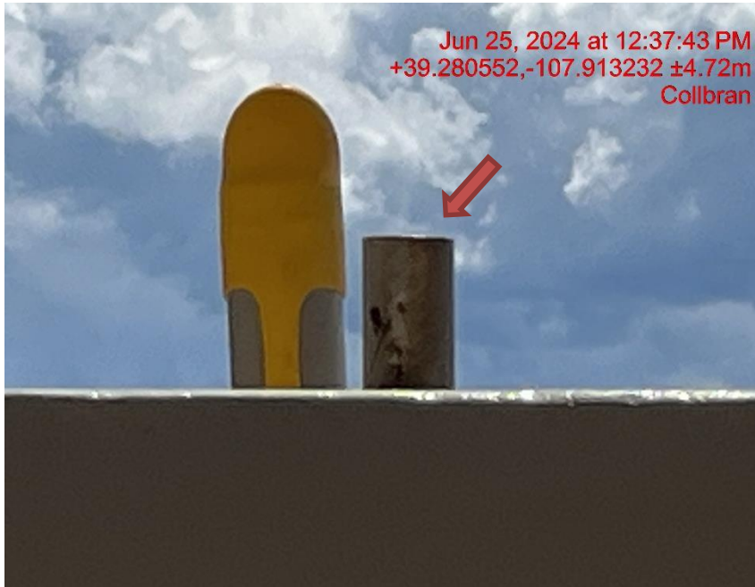
PSD not capped and open to wildlife - Photo #02948