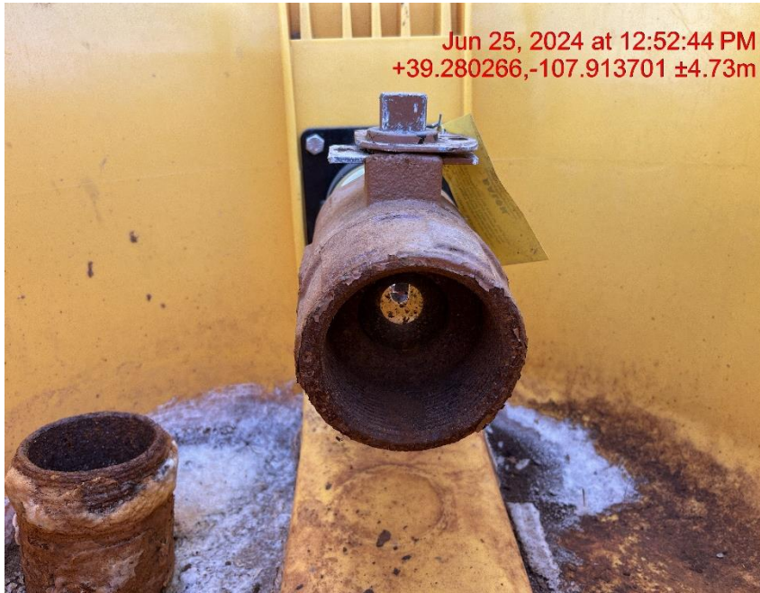
Open ended load line - Photo #02976