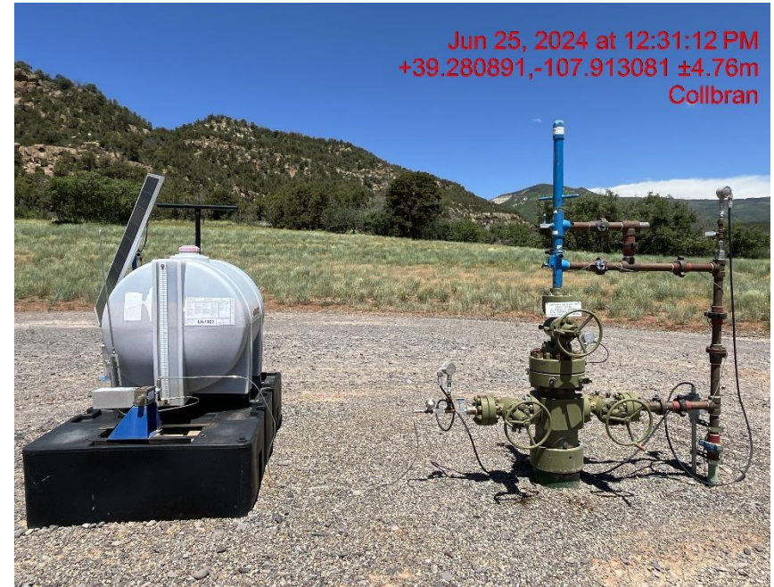
Well head and chemical tank - Photo #02940