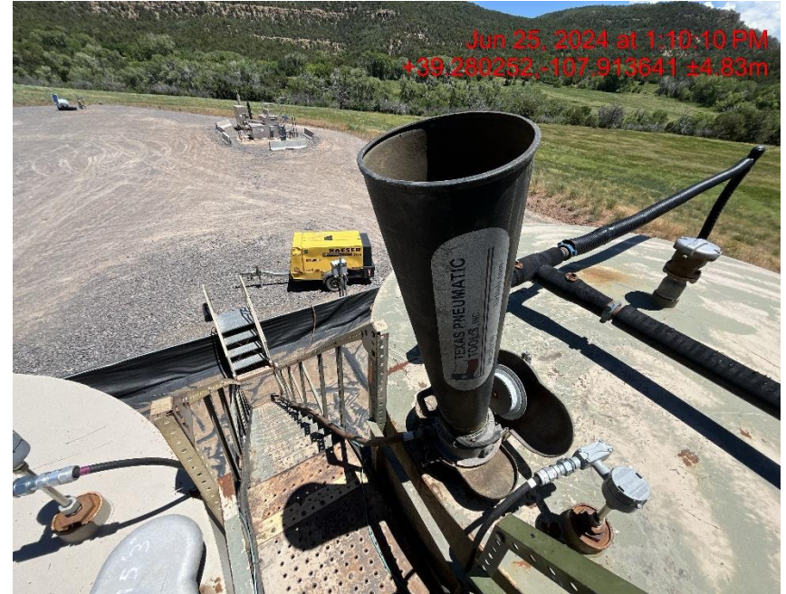
Thief hatch open to wildlife/atmosphere - Photo #03001