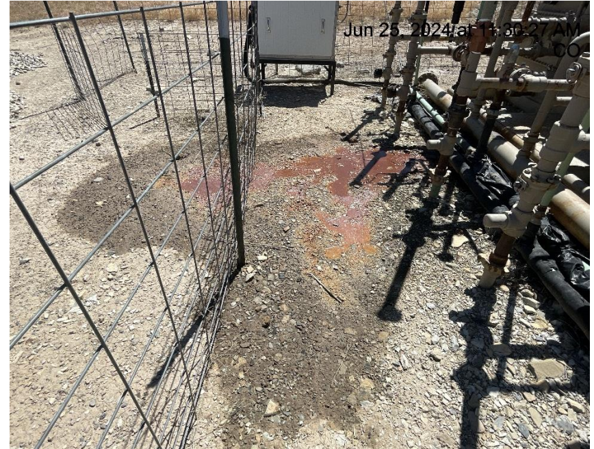
Photo # 1411 Mechanical Condition - Possible dump line leak & stained soils