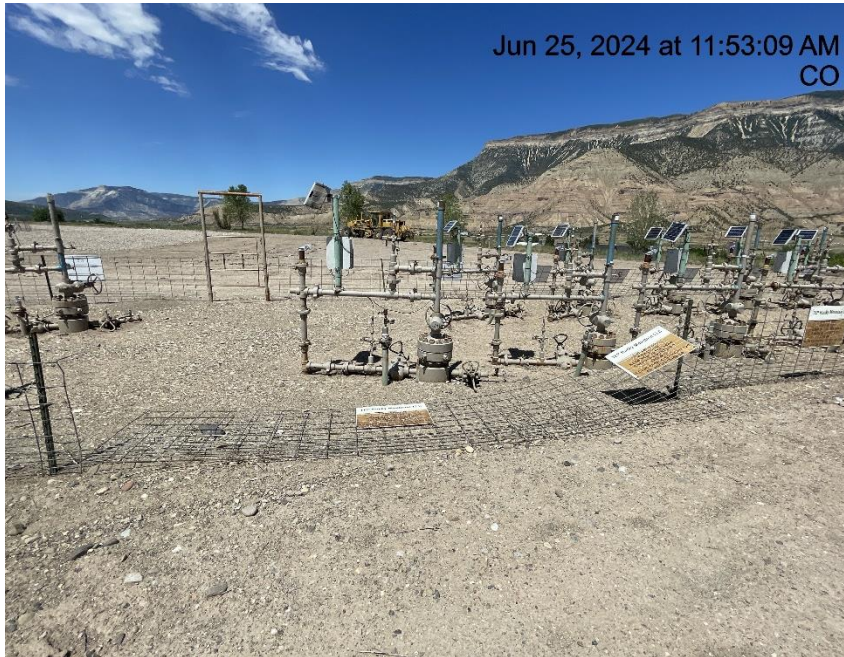
Photo # 1416 Hog panels laying on ground/wellhead sign not properly posted & multiple signs are also weathered & cracking