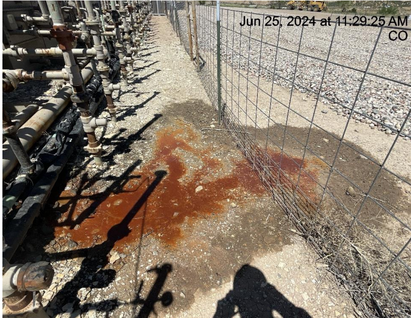
Photo # 1410 Mechanical Condition - Possible dump line leak & stained soils