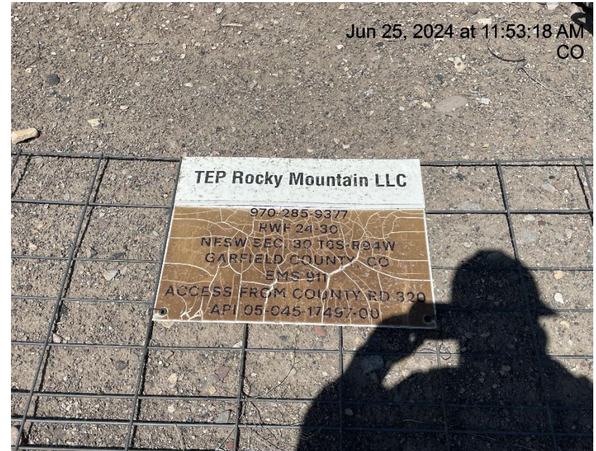
Photo # 1417 Hog panels laying on ground/wellhead sign not properly posted & sign is weathered & cracking