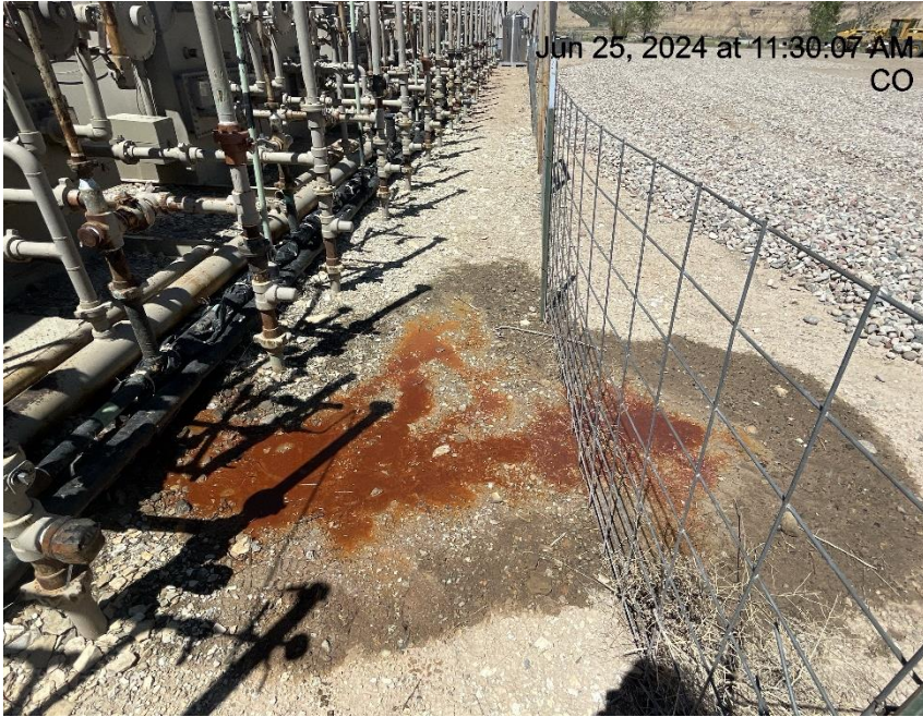
Photo # 1414 Mechanical Condition - Possible dump line leak & stained soils