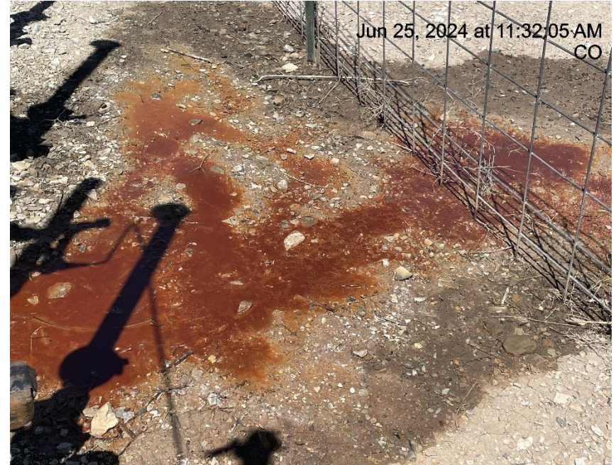
Photo # 1413 Mechanical Condition - Possible dump line leak & stained soils