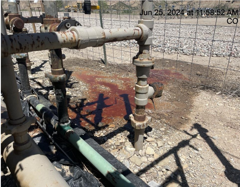
Photo # 1412 Mechanical Condition - Possible dump line leak & stained soils