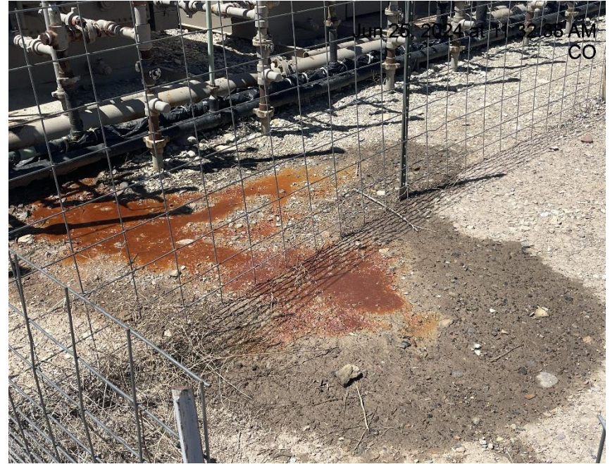
Photo # 1415 Mechanical Condition - Possible dump line leak & stained soils