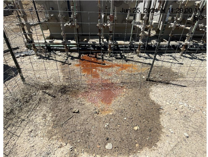
Photo # 1409 Mechanical Condition - Possible dump line leak & stained soils