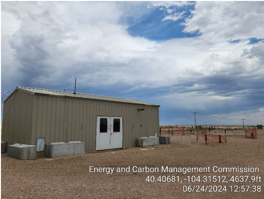
Energy and Carbon Management Commission 40.40681, -104.31512, 4637.9ft 06/24/2024 12:57:38