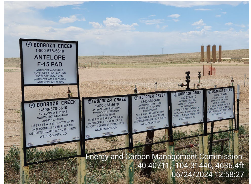
Energy and Carbon Management Commission 40.40711, -104.31446, 4636.4ft 06/24/2024 12:58:27