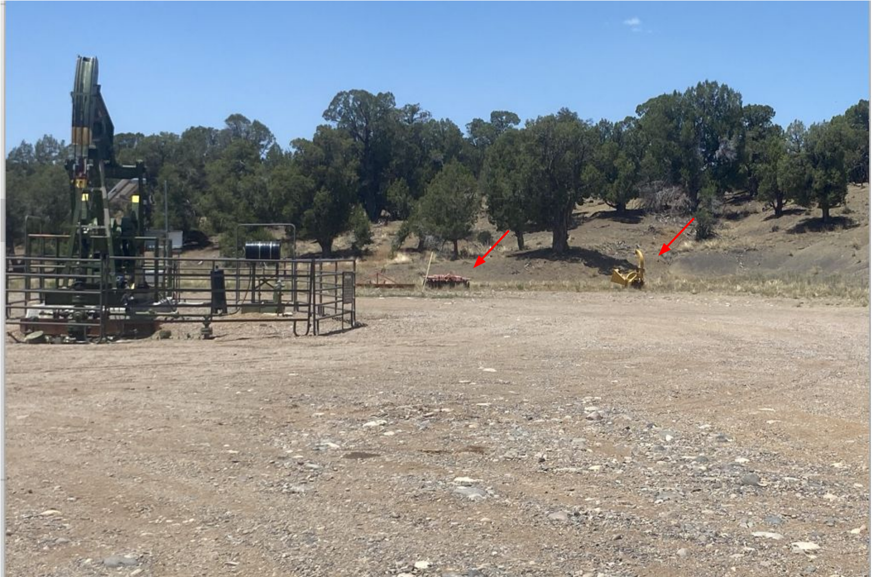
Photo 2. View of surface owner equipment that remains stored in the western portion of the disturbance.