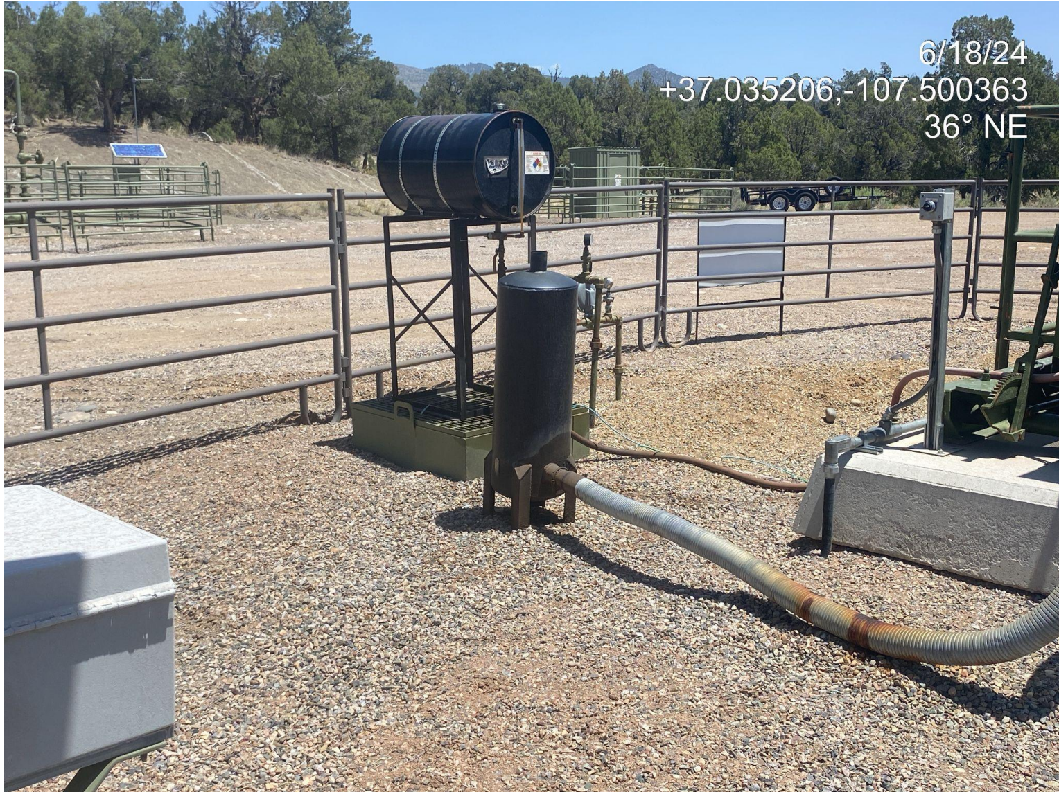
Photo 3. Stained soils at pump jack muffer identified in the previous inspection doc #712700823 has been addressed/resolved.