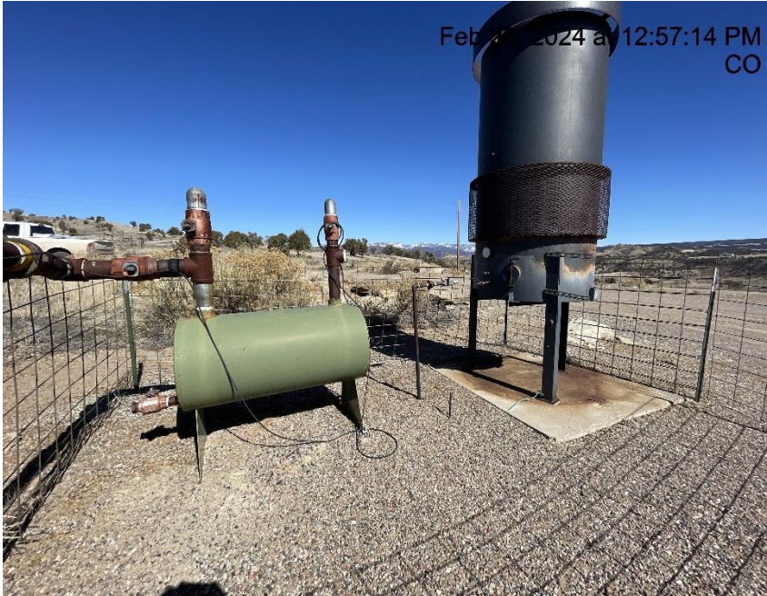
Photo # 7725 From inspection 708903198 conducted on 02/28/2024 Unused Equipment/ECD disconnected