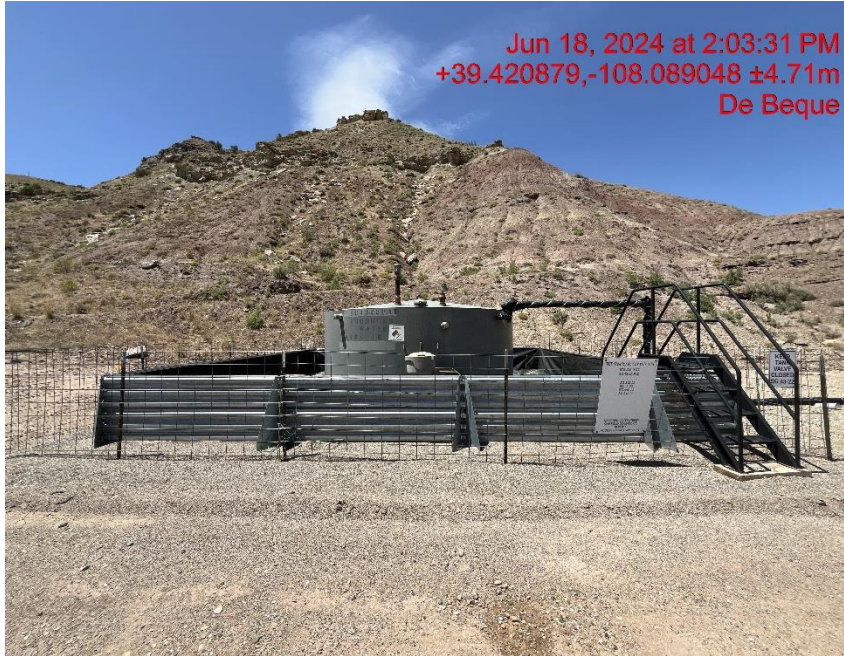
Tank battery - Photo #02666