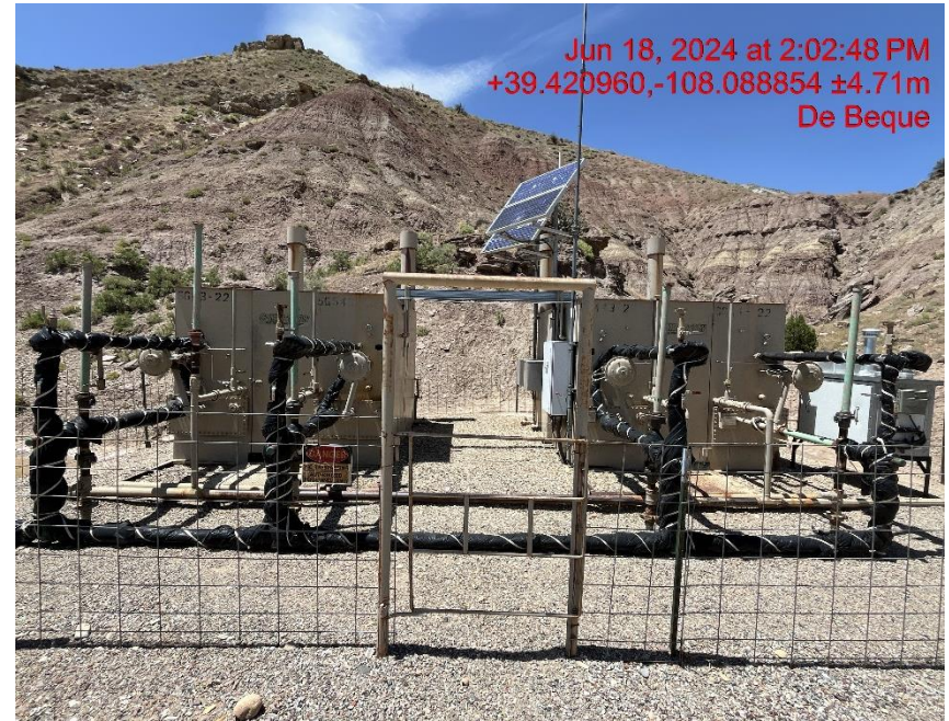
Separators - Photo #02665