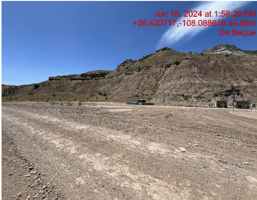
Entrance to location - Photo #02658