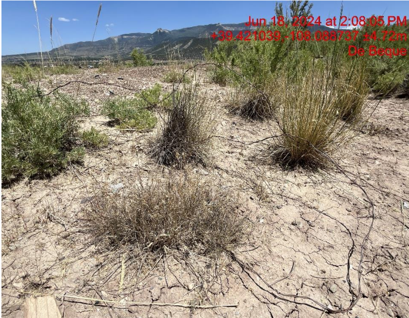
Wildlife hazard - Photo #02674