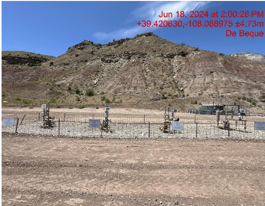
Well heads - Photo #02659