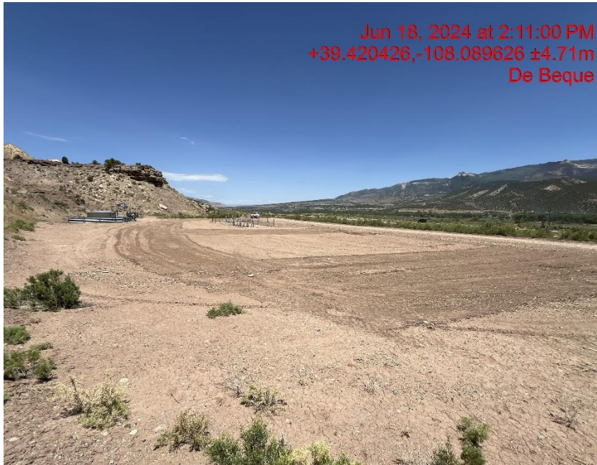
Northwest corner of location - Photo #02677