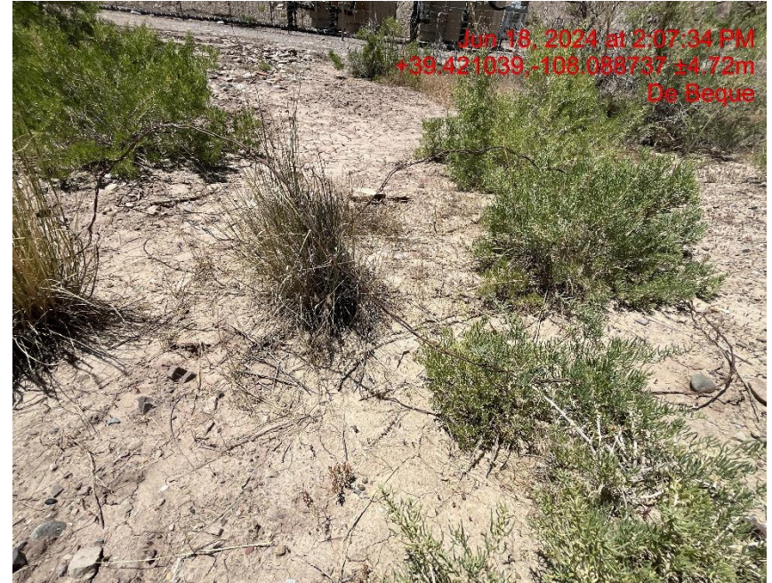
Wildlife hazard - Photo #02672