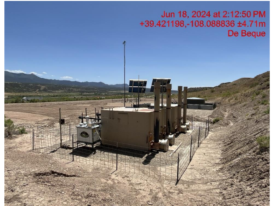
Northeast corner of location - Photo #02680