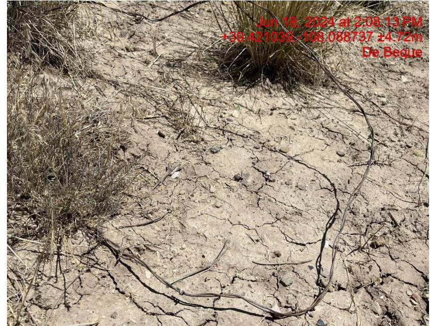
Wildlife hazard - Photo #02675