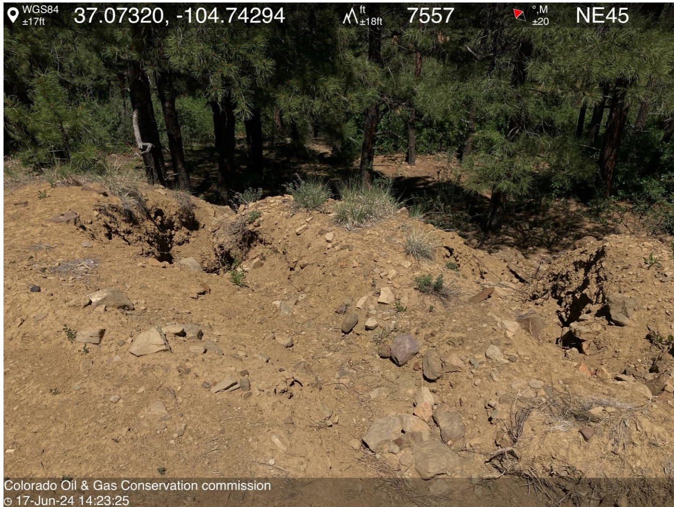
PHOTO 4: BMP'S ON ROW JUST SOUTH OF LOCATION HAVE FAILED AND STORMWATER HAS ERODED THE EDGE OF THE ROAD. INSTALL OR REPAIR REQUIRED BMP'S PER RULE 1002. CA DATE 7/17/2024.