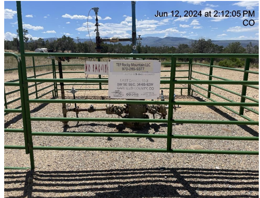
Photo # 783 Wellhead sign faded & becoming illegible/does not comply CECMC rules