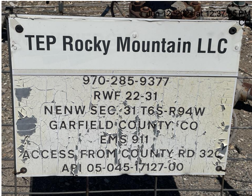
Photo # 642 Wellhead sign is weathered & peeling/some required info is starting to become illegible