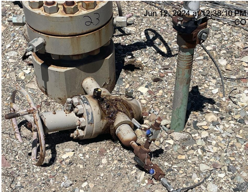
Photo # 644 Possible integrity issue with RWF 23-31 well casing valve