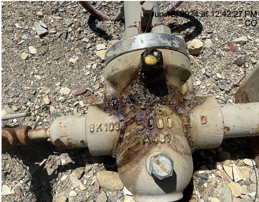
Photo # 646 Possible integrity issue with RWF 23-31 well casing valve