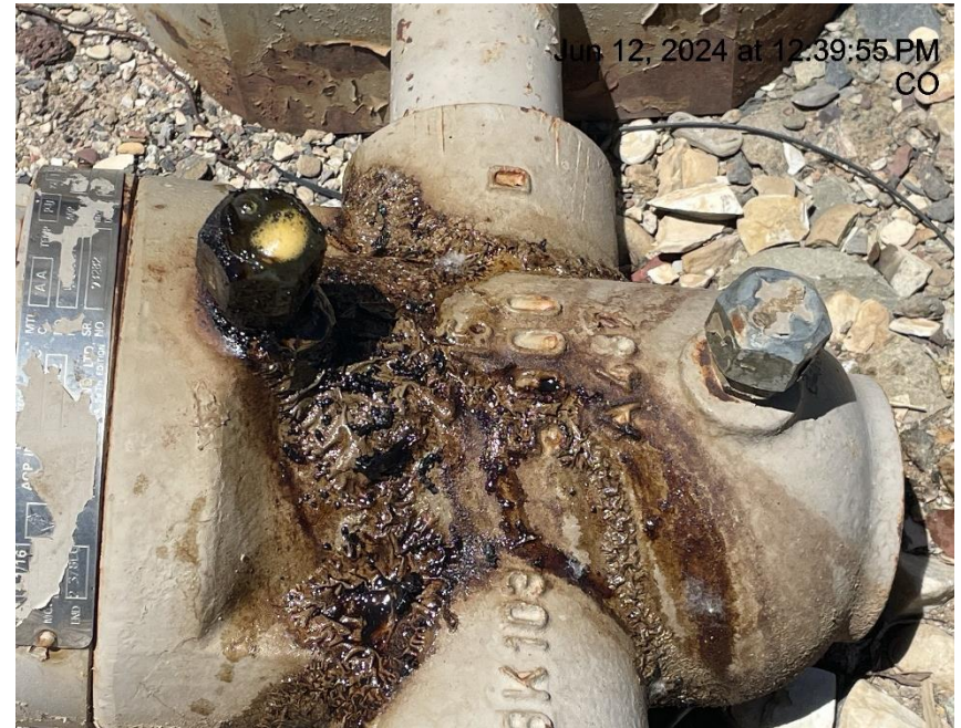
Photo # 647 Possible integrity issue with RWF 23-31 well casing valve