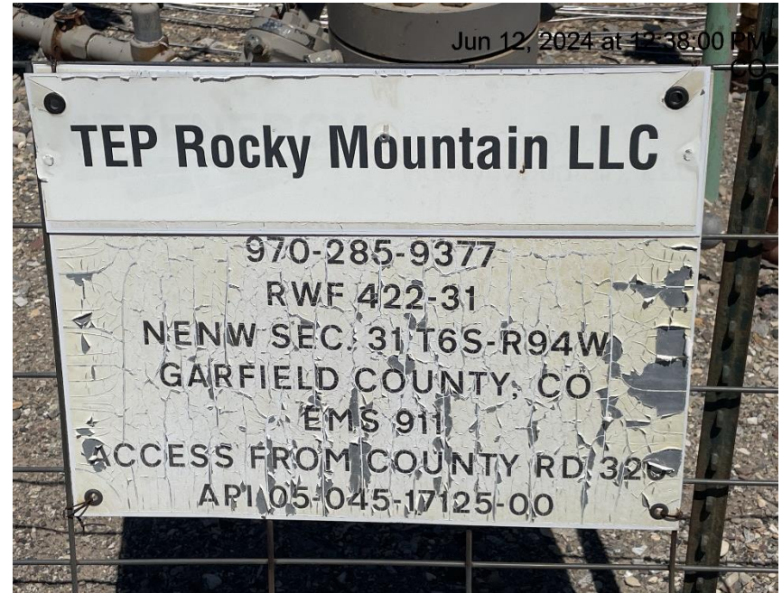
Photo # 643 Wellhead sign is weathered & peeling/some required info is starting to become illegible