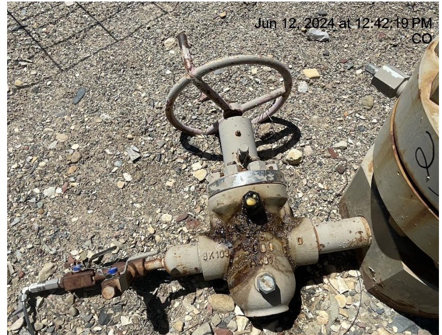
Photo # 645 Possible integrity issue with RWF 23-31 well casing valve