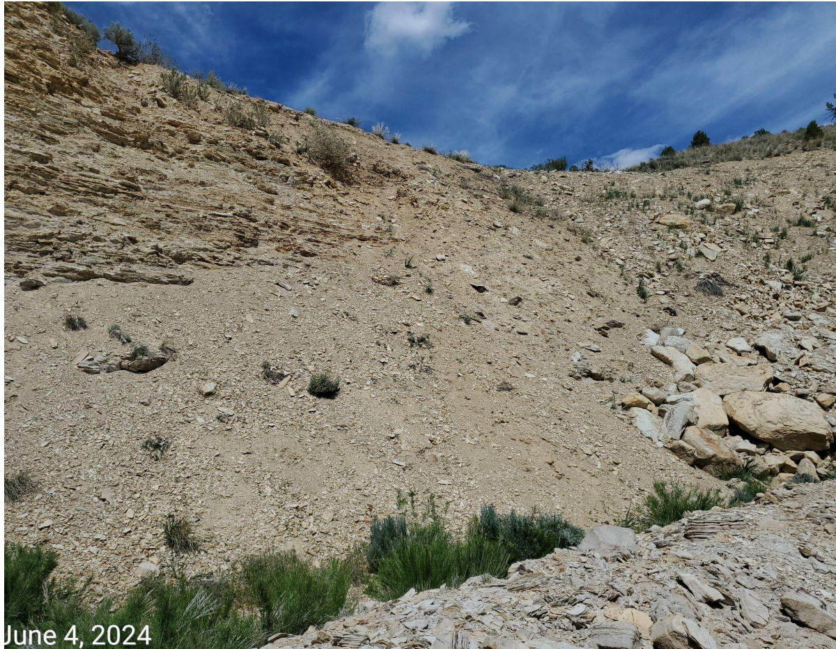
Photo 2: Photo taken from the cut slopes of the Location. BMPs to minimize erosion and degradation remain missing from the cut slopes on the northeast and northwest end of the Location.