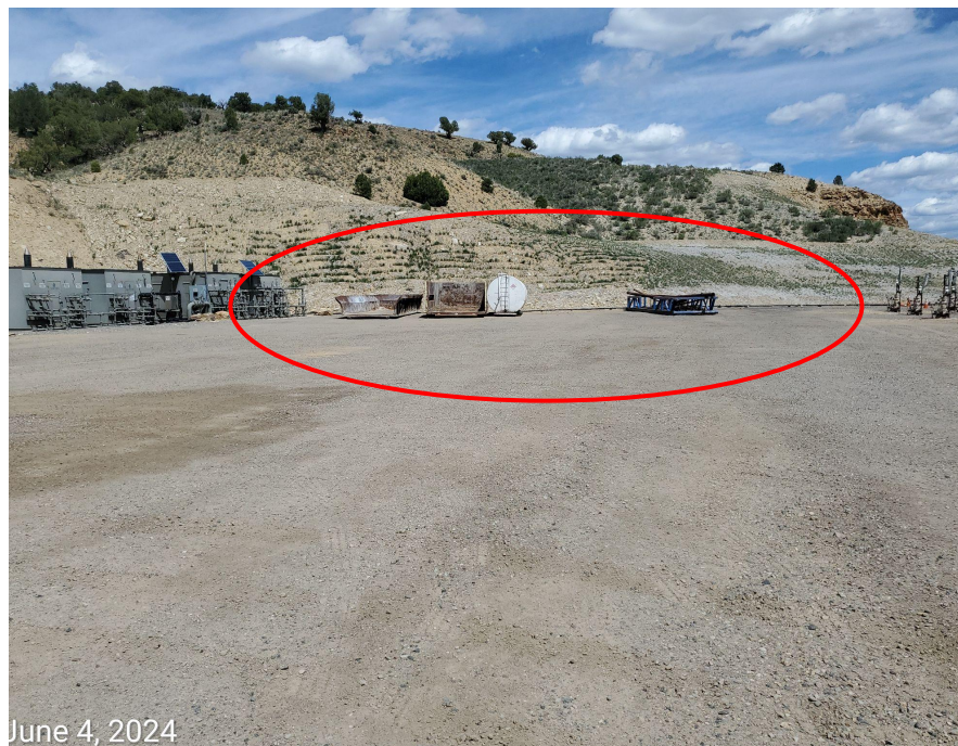
Photo 1: Photo shows unused equipment remains improperly stored on the Location.