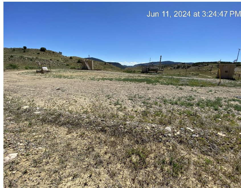
Location from Northeast corner