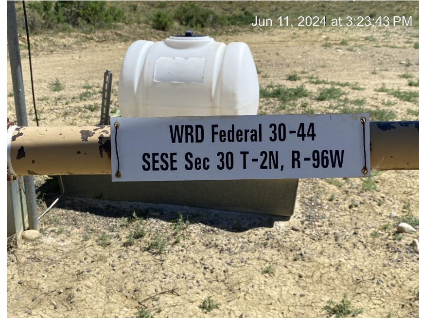
When replaced additional information is required