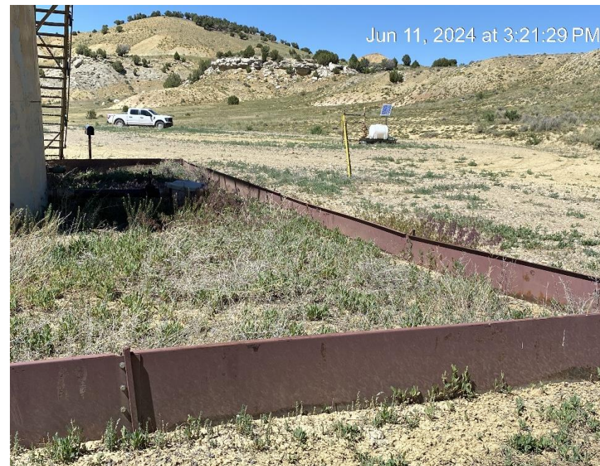
Location from Southwest corner