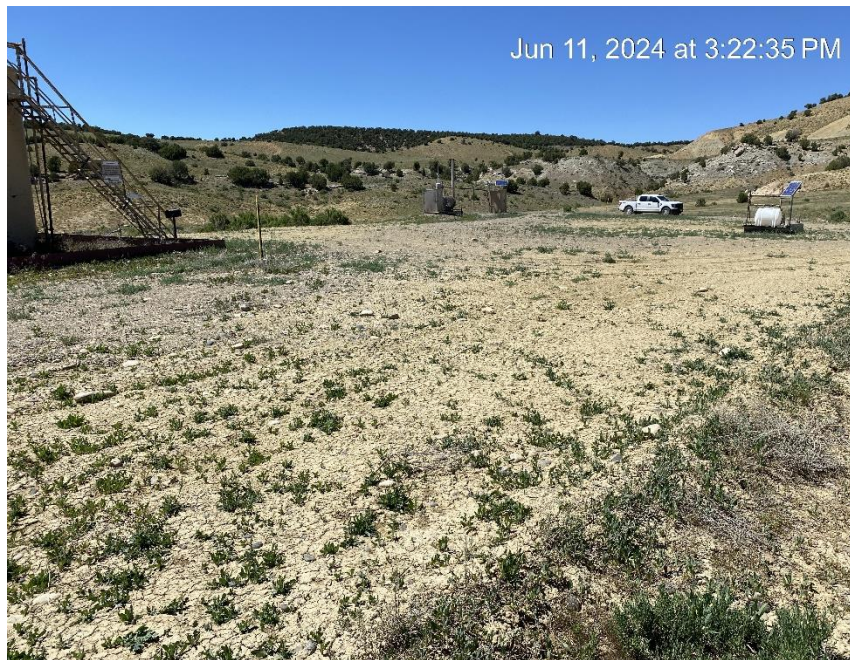
Location from Southeast corner