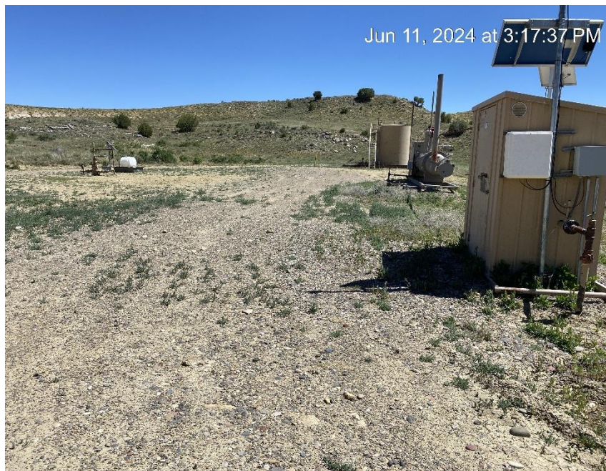
Location from Northwest corner