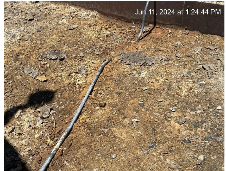
Stained soil and dried oil