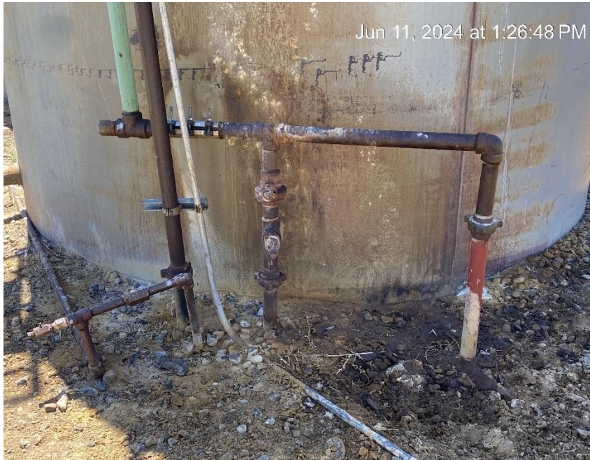
Old oily waste and stained soil