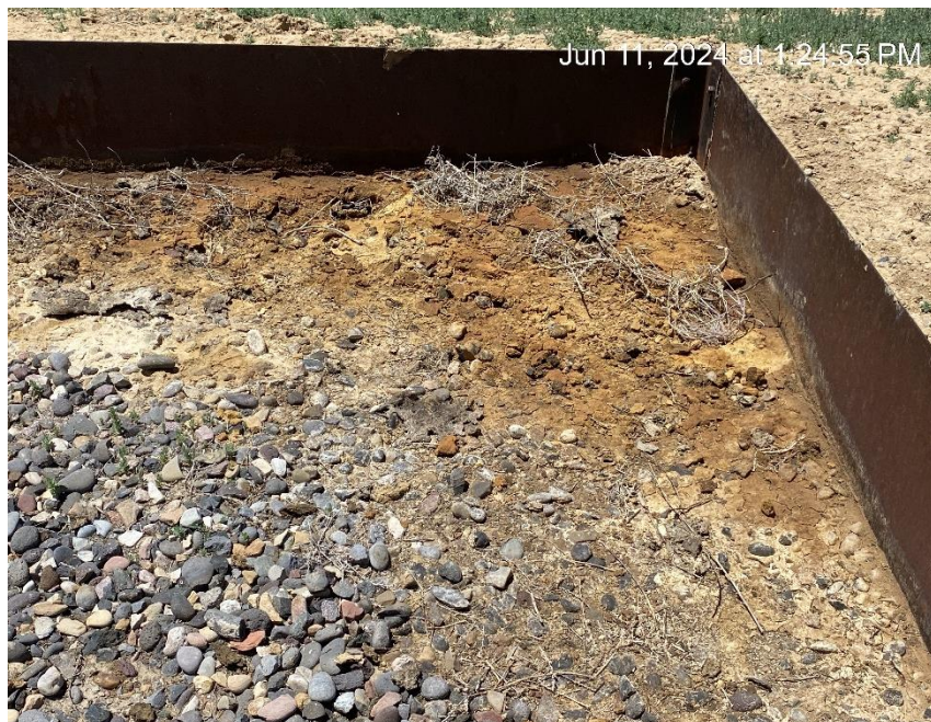
Dried oil and stained soil