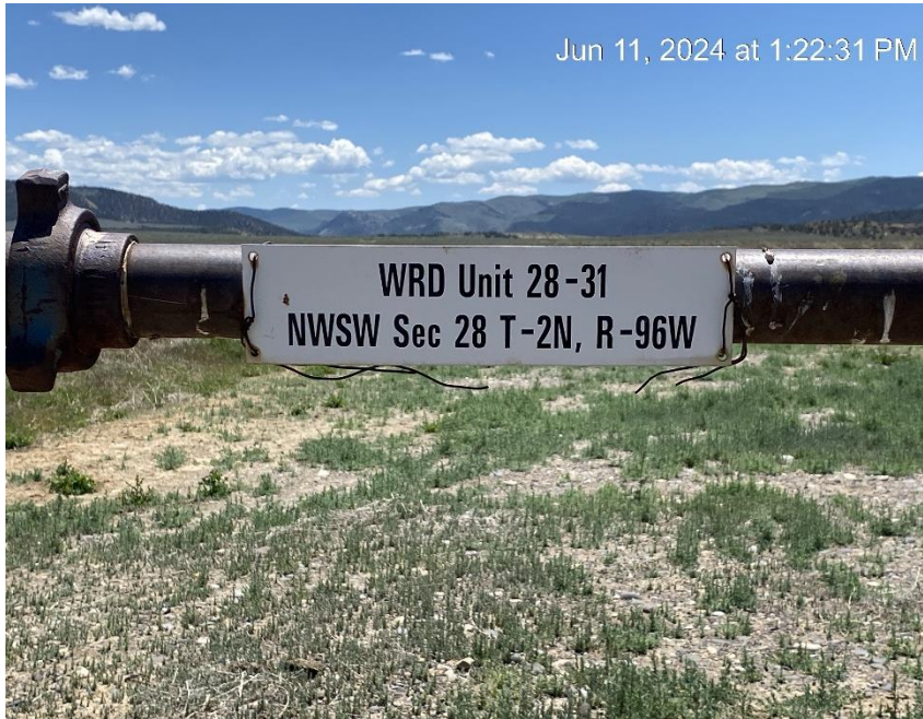
When replaced additional information is required