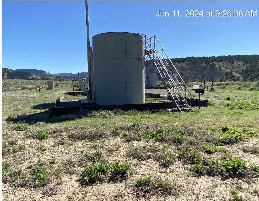
Location from Southwest corner