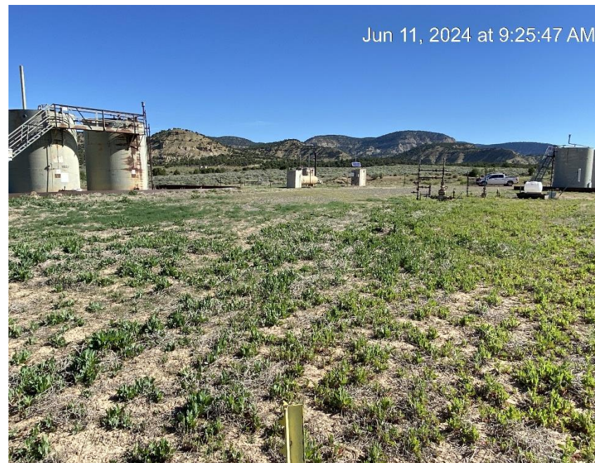
Location from Southeast corner