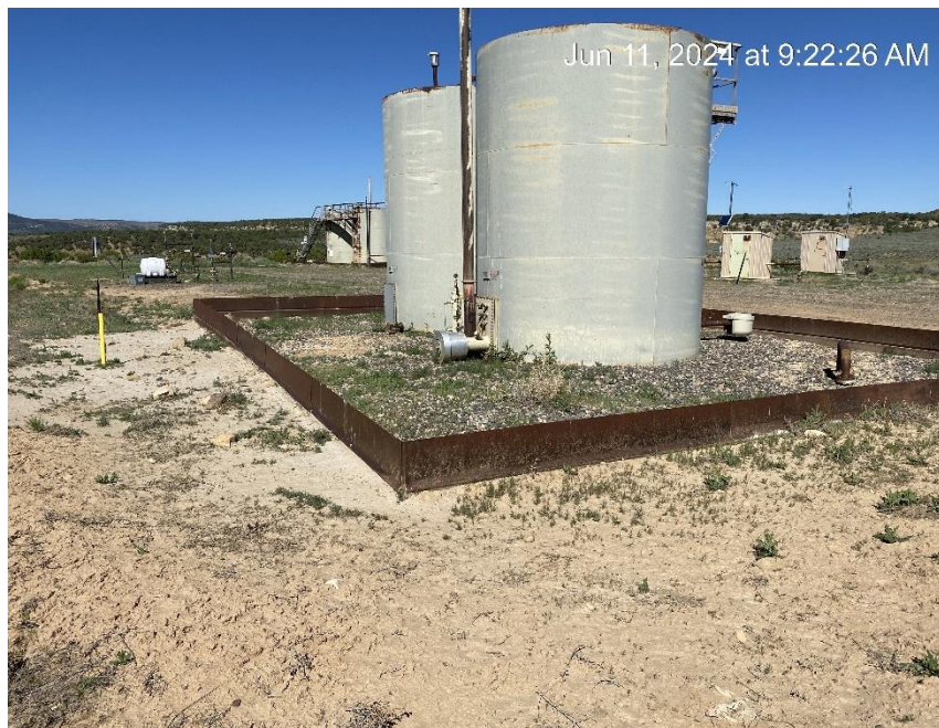
Location from Northeast corner