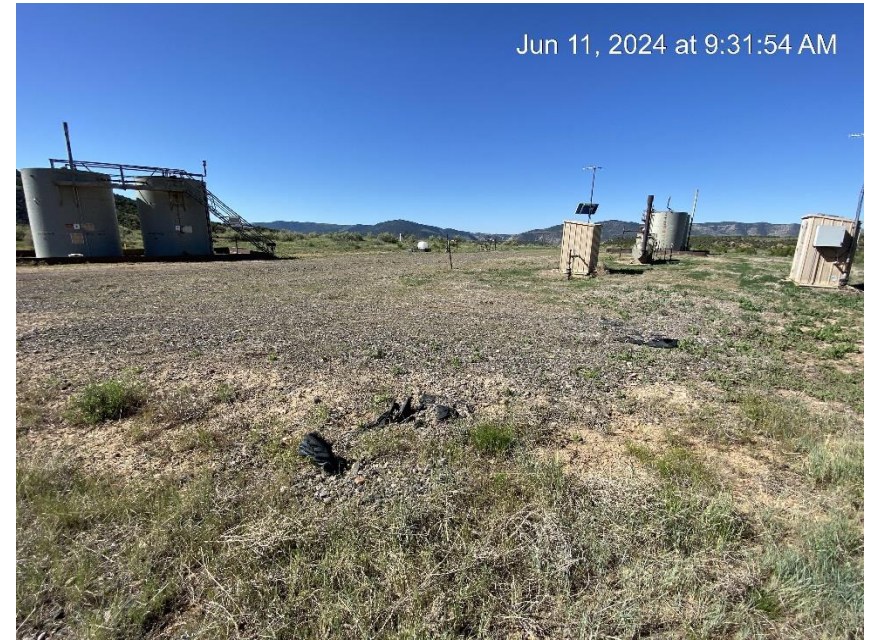
Location from Northwest corner