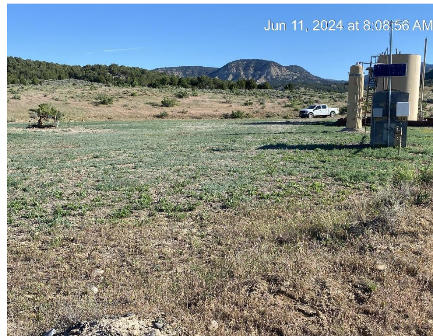
Location from Southeast corner