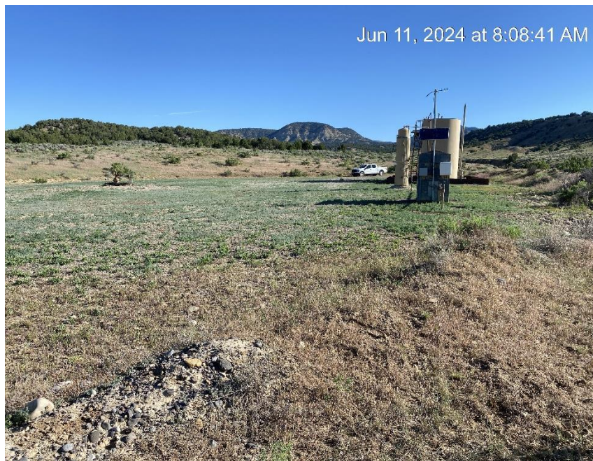
Location from Southwest corner