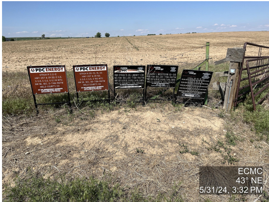
Photo 1. The photo was taken at the entrance to the well location facing Northeast. The photo illustrates Operator signs at the entrance.