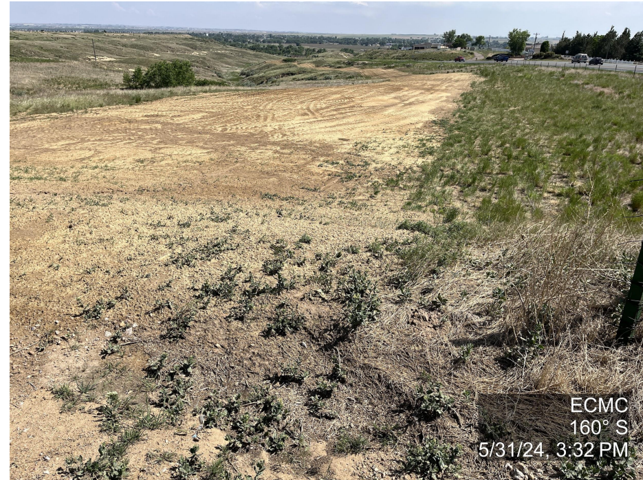
Photo 2. The photo was taken at the entrance to the well location facing South. The photo illustrates the operator has conducted final reclamation activities.