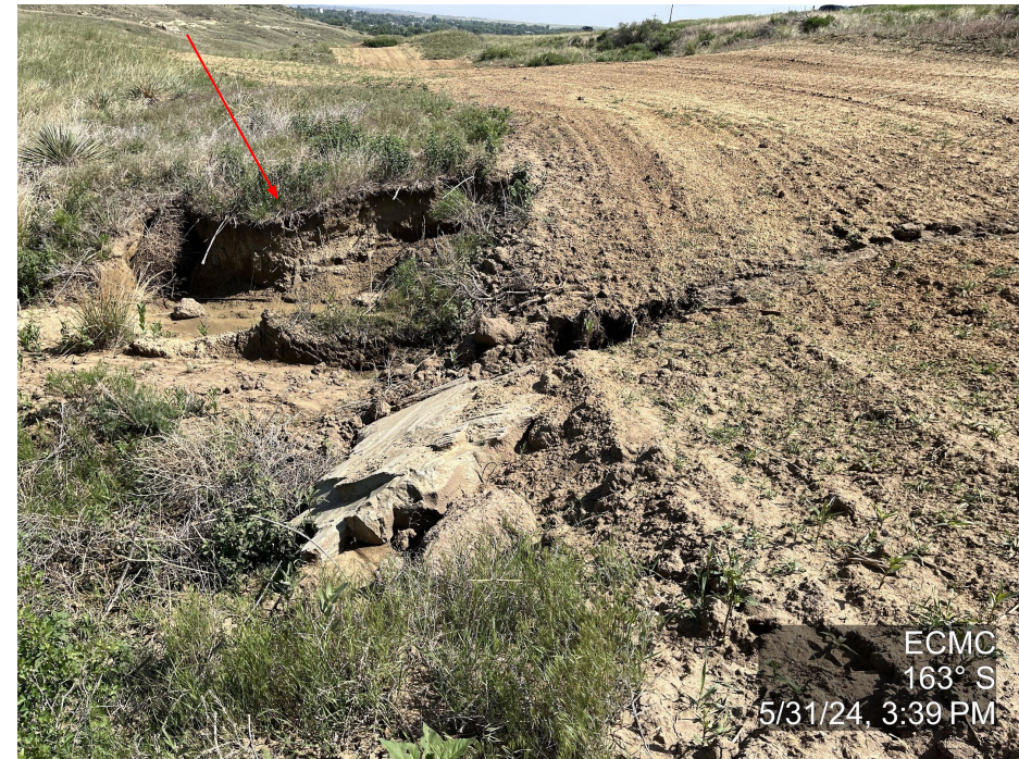
Photo 4. The photo was taken along the access road to the well location facing South. The photo illustrates erosion along the access road as well as erosion from issues in the previous inspection.