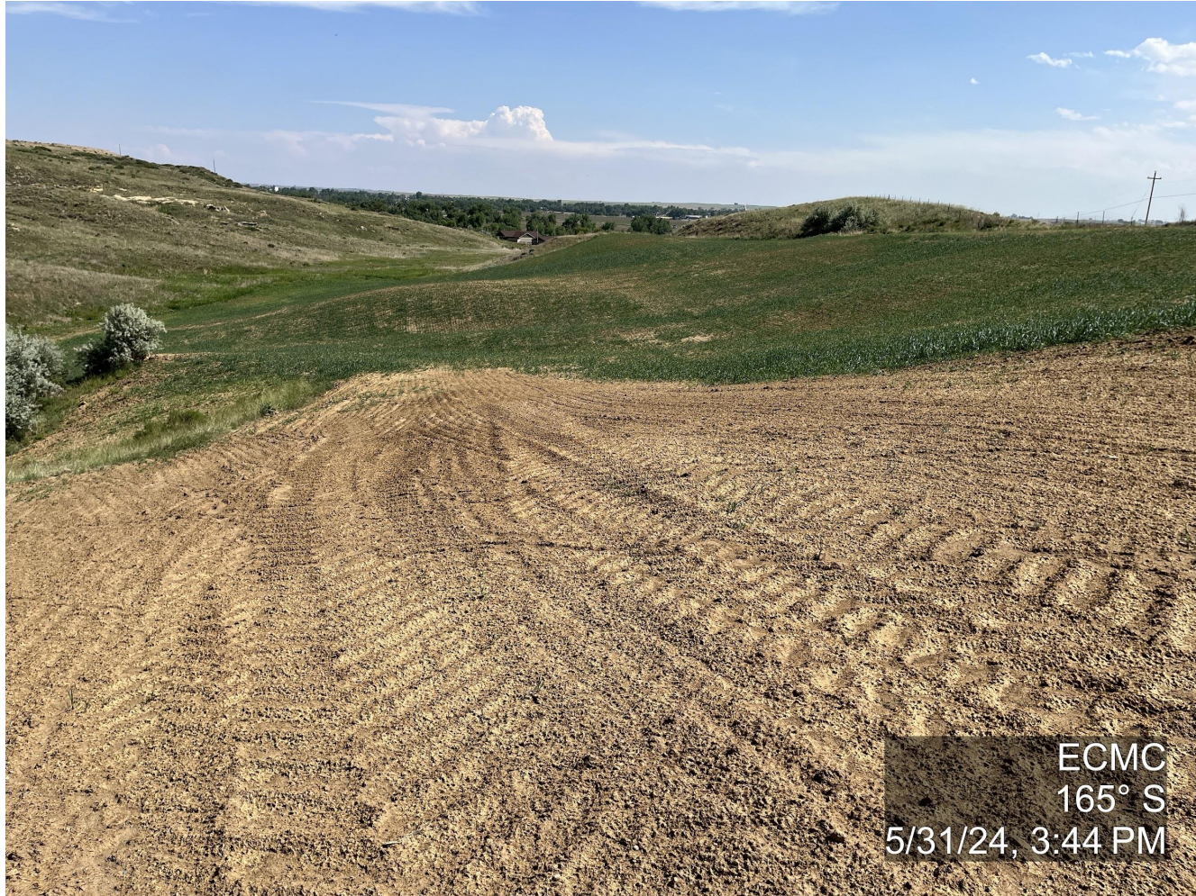
Photo 5. The photo was taken at the well location facing South. The photo illustrates the Operator has conducted final reclamation activities at the well location with germination and evidence of contouring.