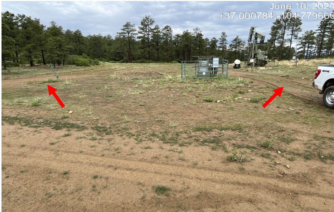
Photo 3. Facing northwest at the location. There are two going across the site creating unnecessary disturbance. The road to the left and middle of the location need to be reclaimed.