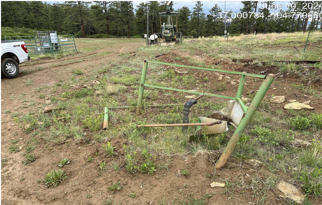
Photo 2. Facing northwest at the location. The pipe fence around this gas line needs to be repaired.