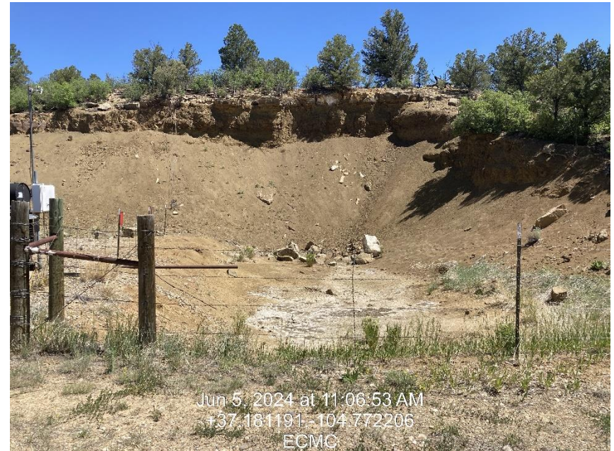
Photo 6 – Pit ID 113406, No freeboard marker present at the time of inspection