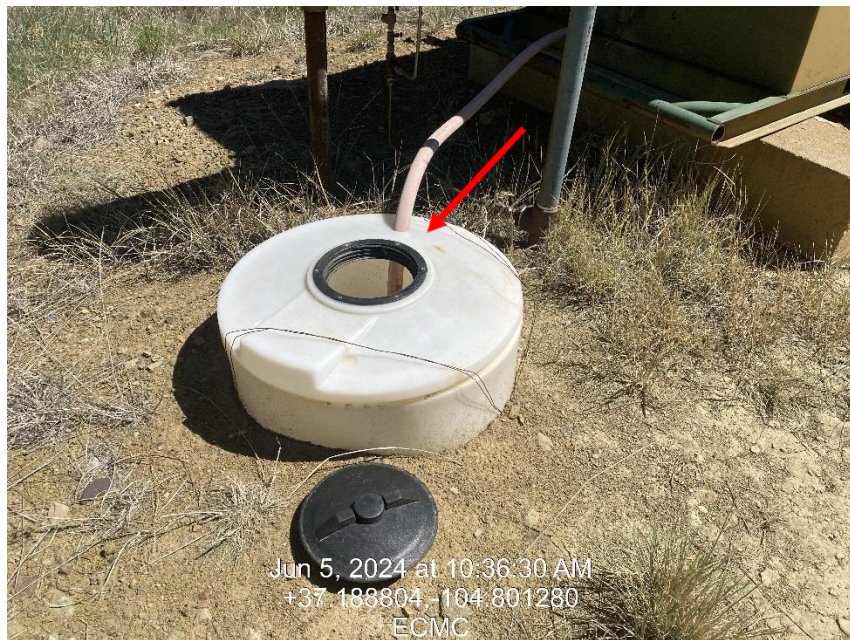
Photo 3 – Tank near Meter House, re-place cap to prevent wildlife access