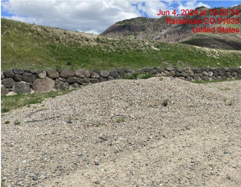
Unprotected Soil Stockpile – Photo #01513