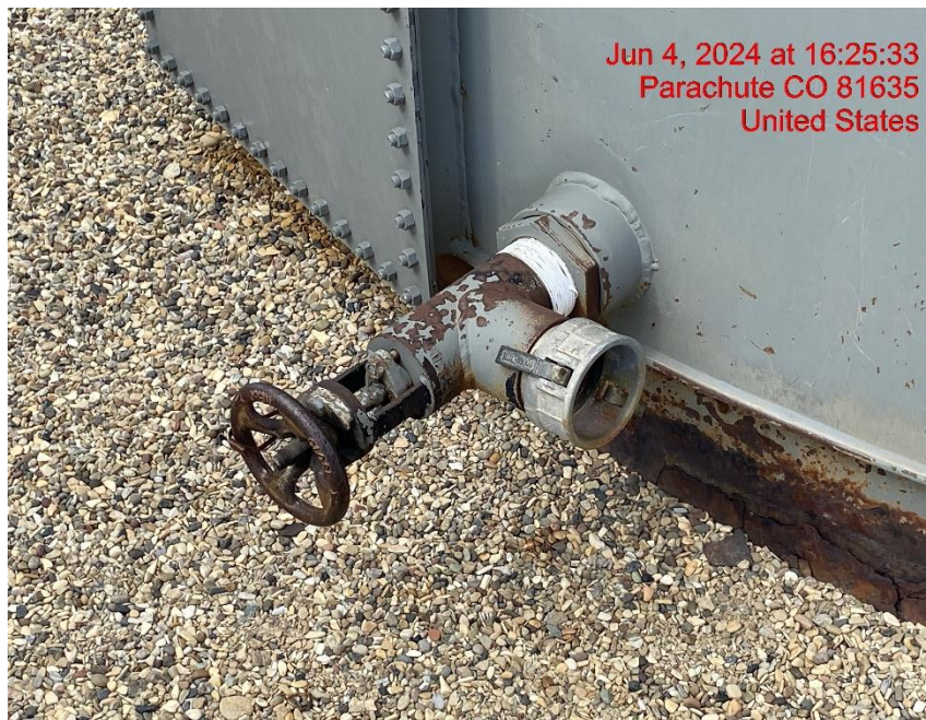
Open-Ended Line – Photo #01519