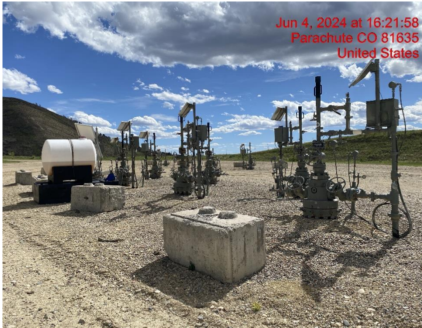
Wellheads – Photo #01510