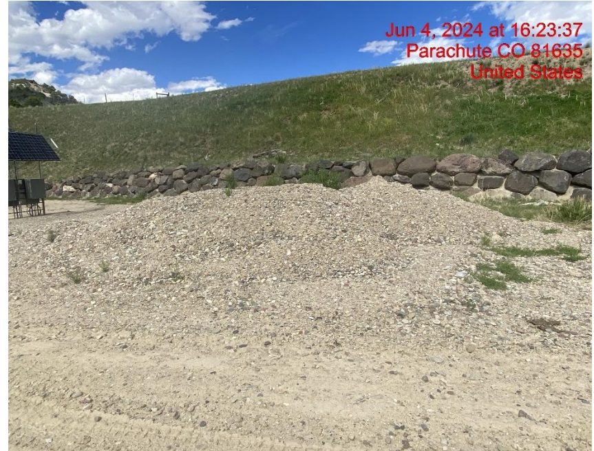
Unprotected Soil Stockpile – Photo #01514