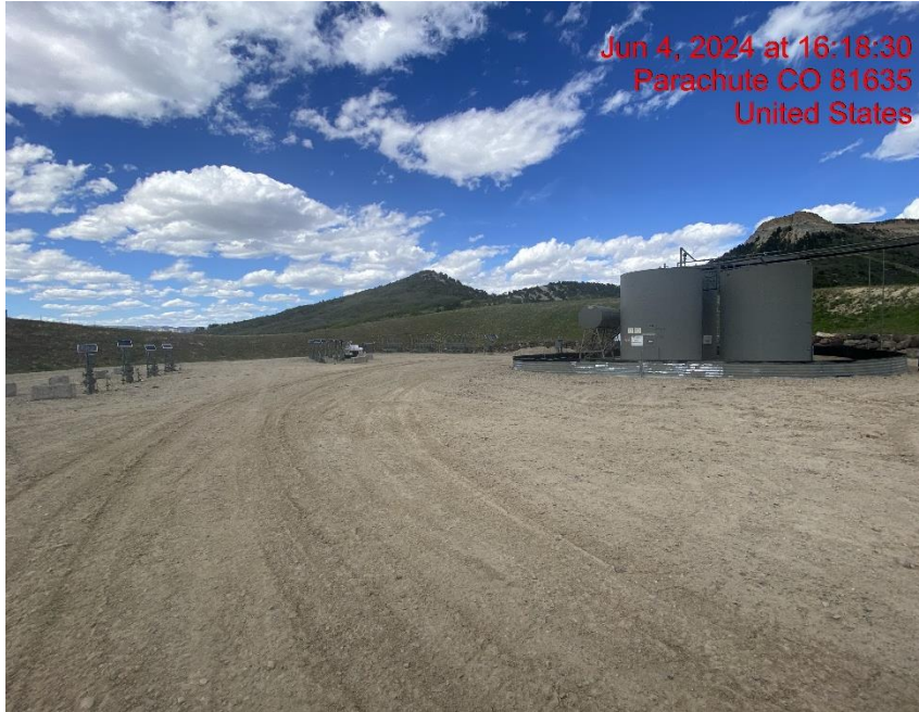
Location Entrance – Photo #01507