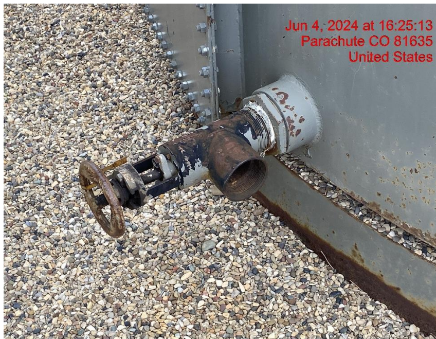
Open-Ended Line – Photo #01517