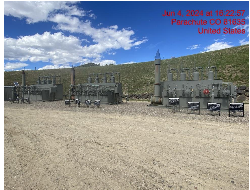
Separators – Photo #01512