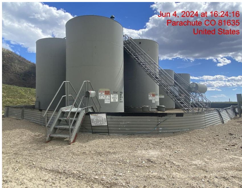
Tank Battery – Photo #01515