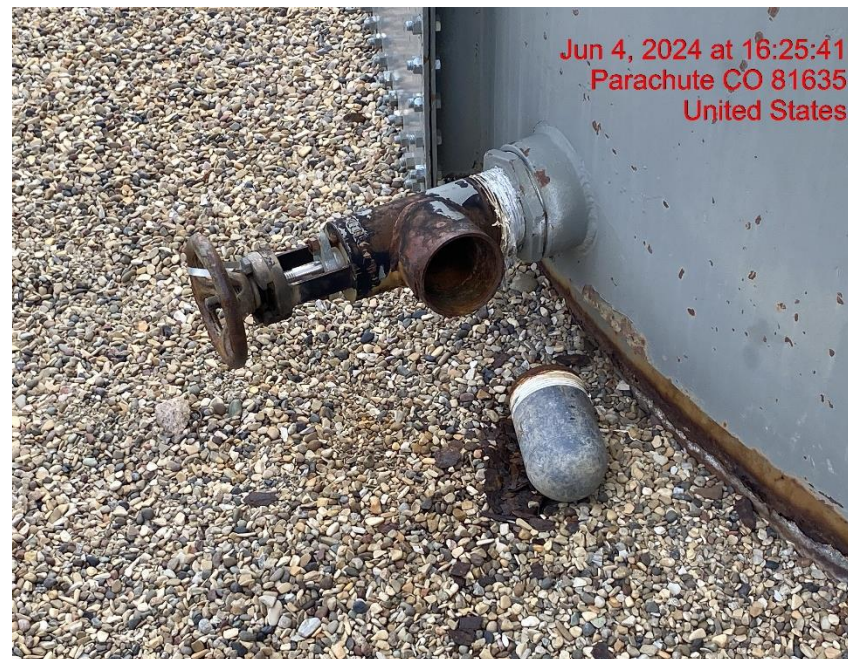
Open-Ended Line – Photo #01520