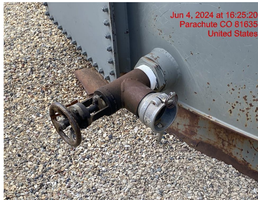
Open-Ended Line – Photo #01518