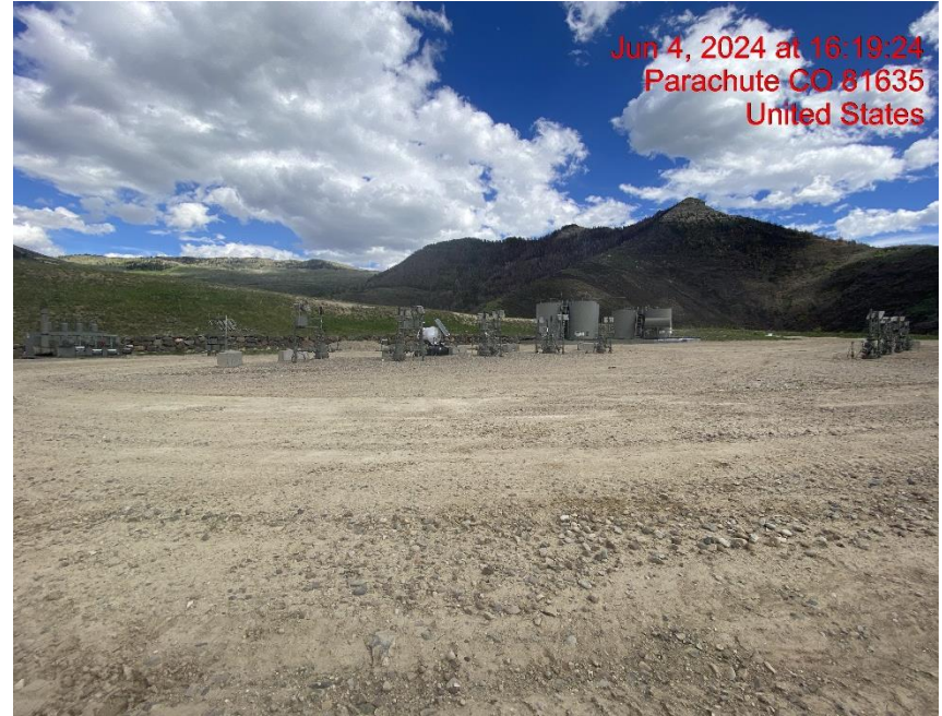
North End of Pad – Photo #01508