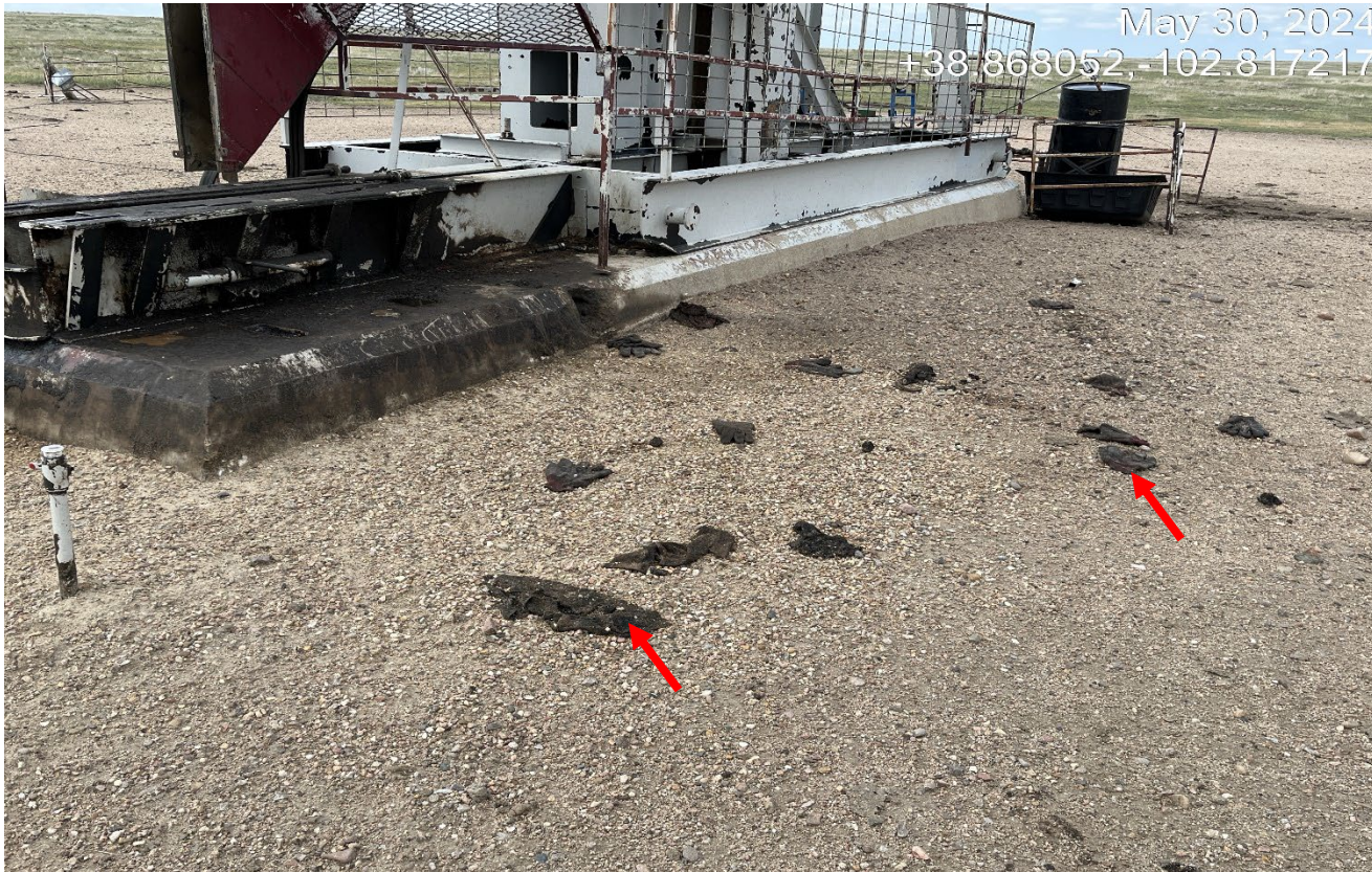
Photo 5. There are oily rags in this are that must be disposed.