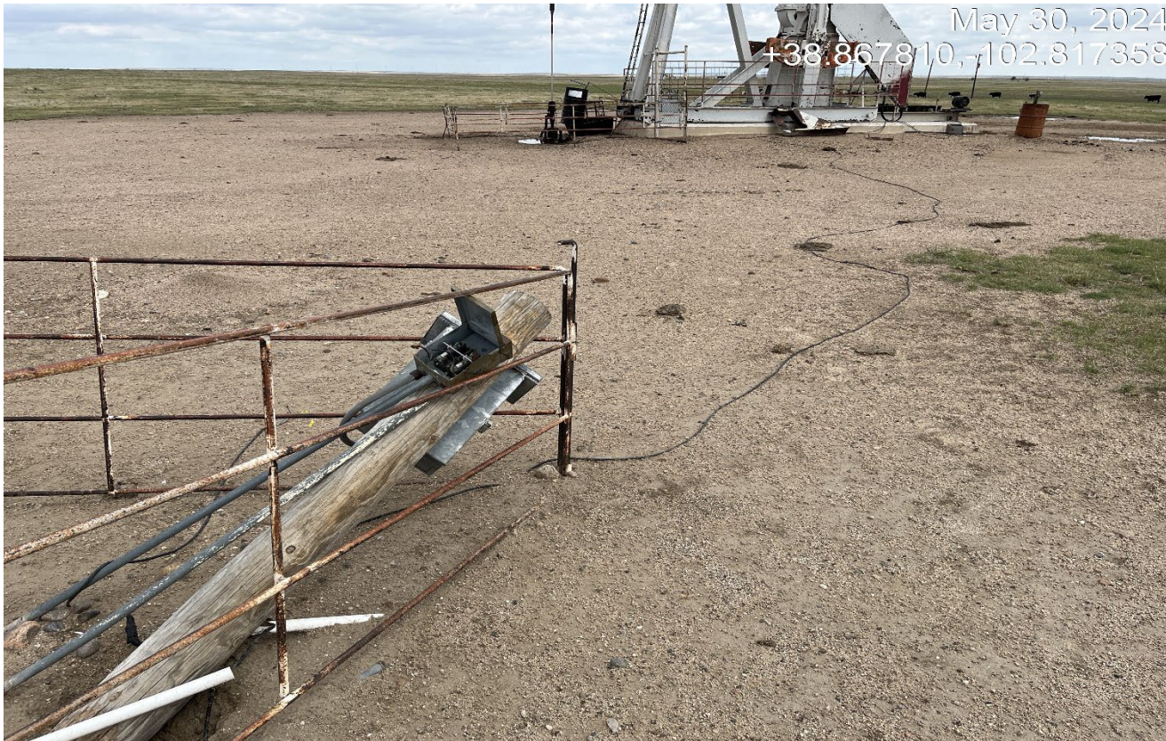
Photo 7. Facing toward the electric utility just south of the well. The electric wire is on the surface and not protected which is a safety concern. The electric breaker is disconnected from the electric line.