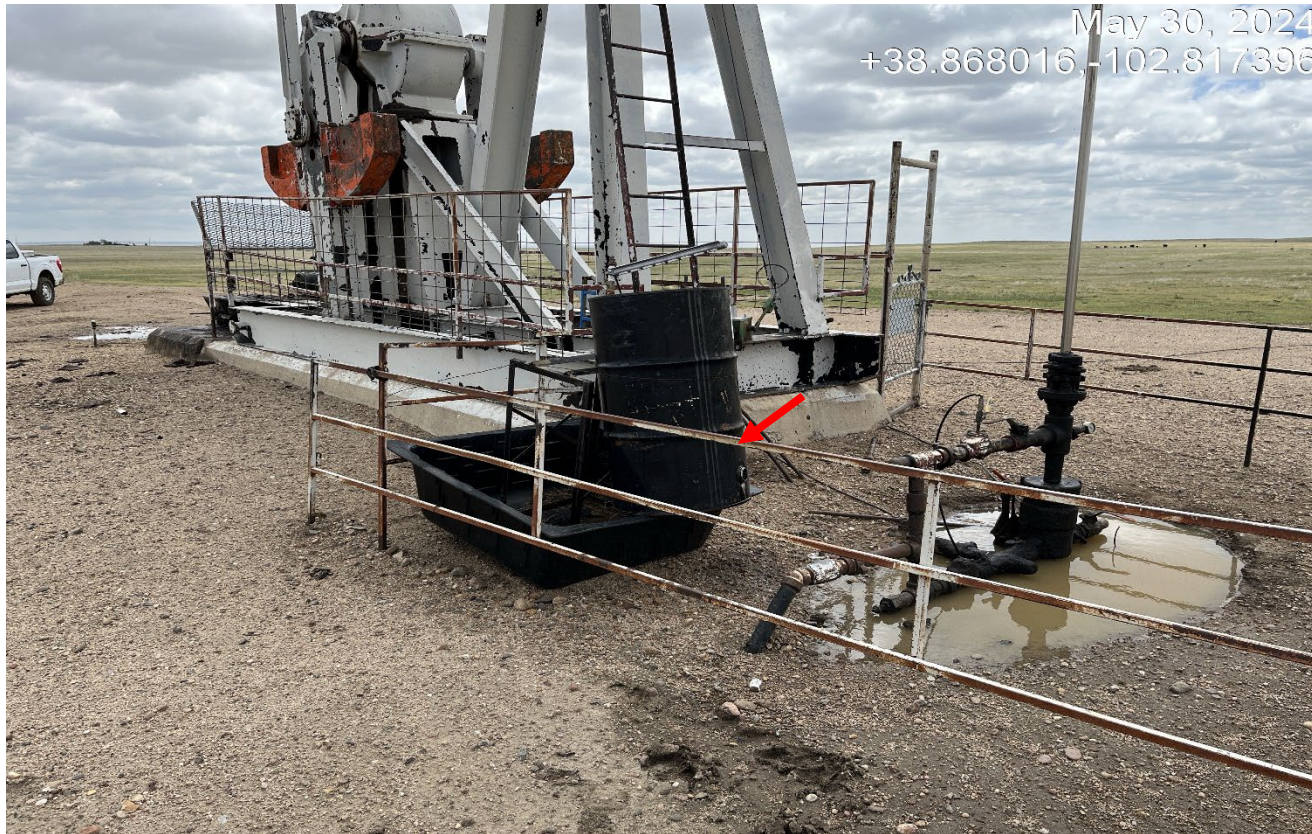
Photo 6. Facing toward the wellhead. The barrel is not properly set in the containment and there is no netting on the secondary containment..