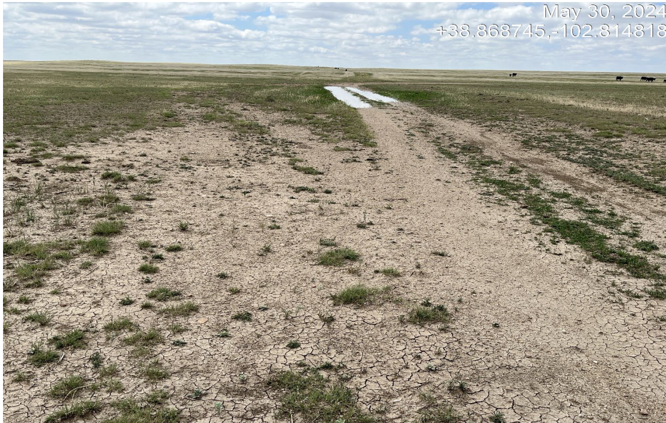
Photo 2. Facing south along the access road. Vehicles are causing unnecessary disturbance driving outside of the access road due to stormwater pooling on the road. The access road must be maintained and vehicles shall not drive outside of the access road boundary. Previous corrective action was not completed.