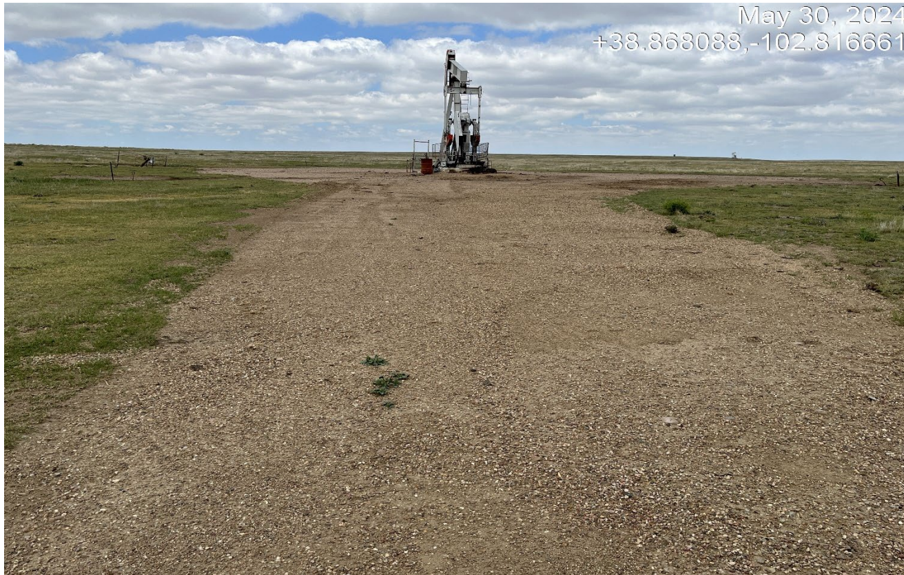
Photo 3. Facing west along the road toward the wellsite. There has been gravel spread along the area where erosion channel was previously observed.