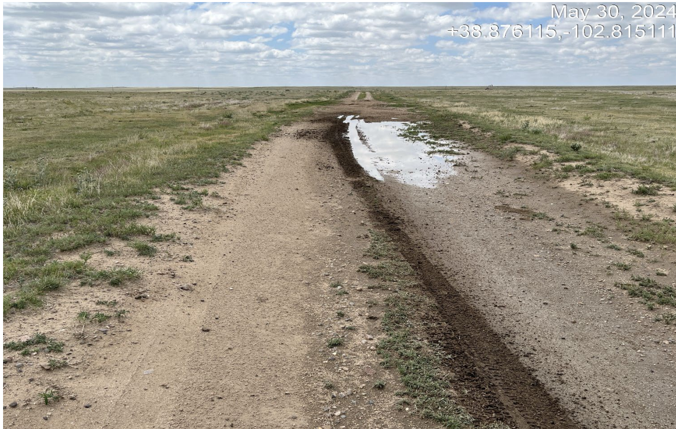
Photo 1. Facing south along the access road. Vehicles are causing unnecessary disturbance driving outside of the access road due to stormwater pooling on the road. The access road must be maintained and vehicles shall not drive outside of the access road boundary. Previous corrective action was not completed.