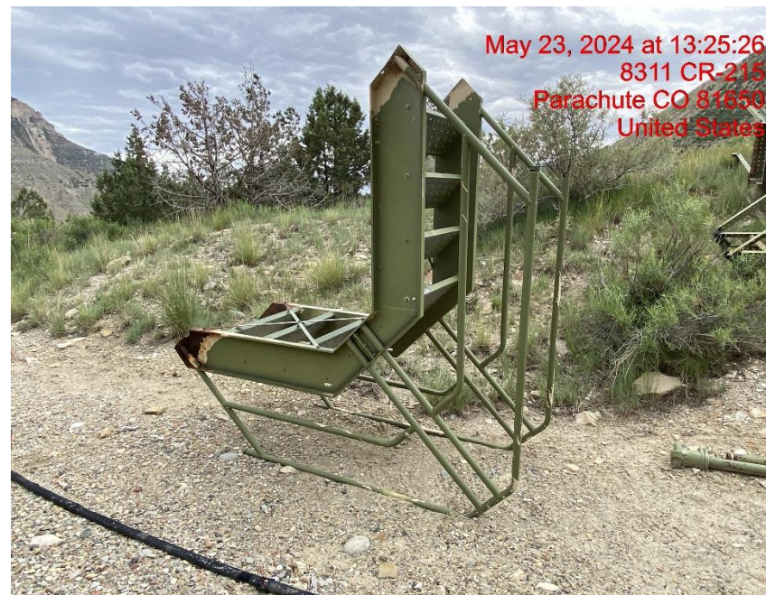
Stored Supplies/Equipment – Photo #01362