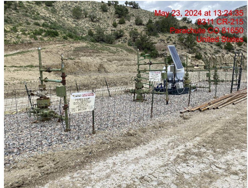
Wellheads – Photo #01357