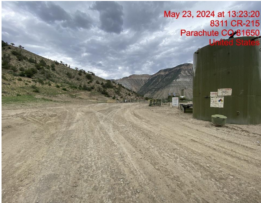
Location Entrance – Photo #01355