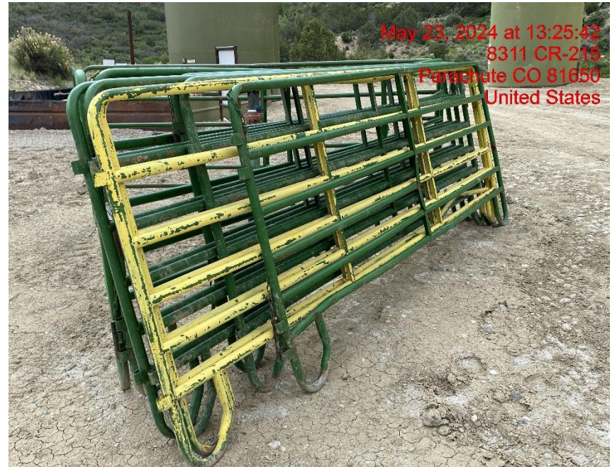
Stored Supplies/Equipment – Photo #01364