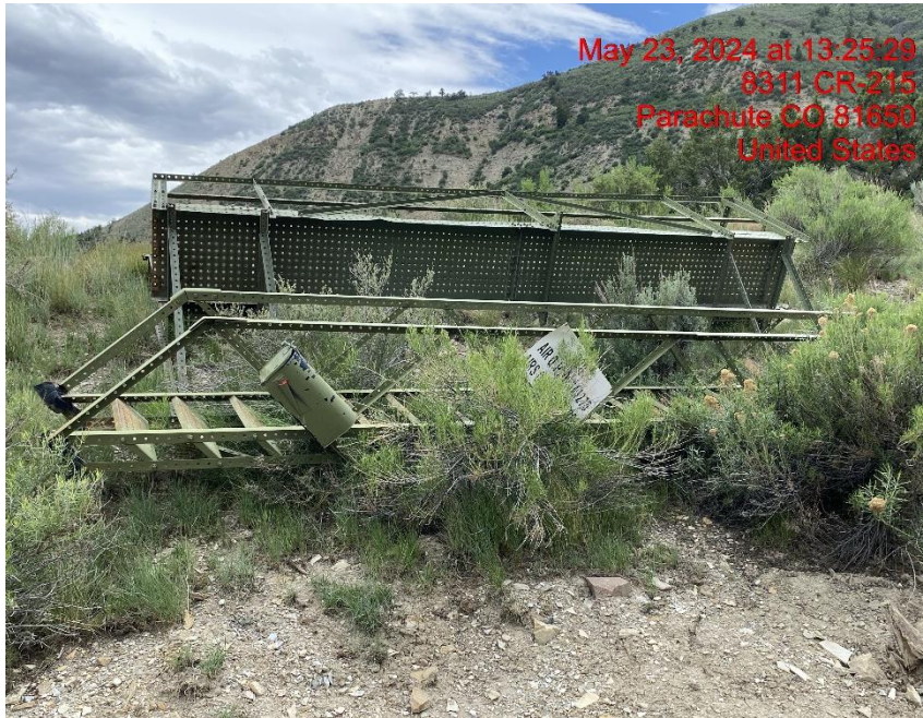
Stored Supplies/Equipment – Photo #01363