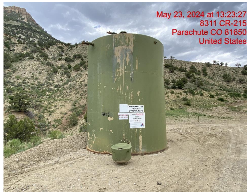
Storage Tank – Photo #01356