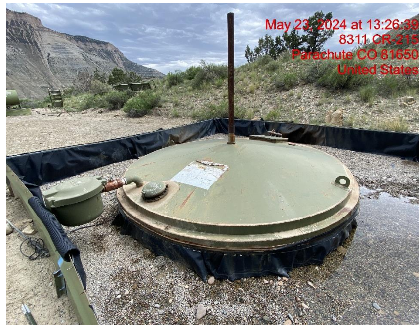
Tank Battery – Photo #01365