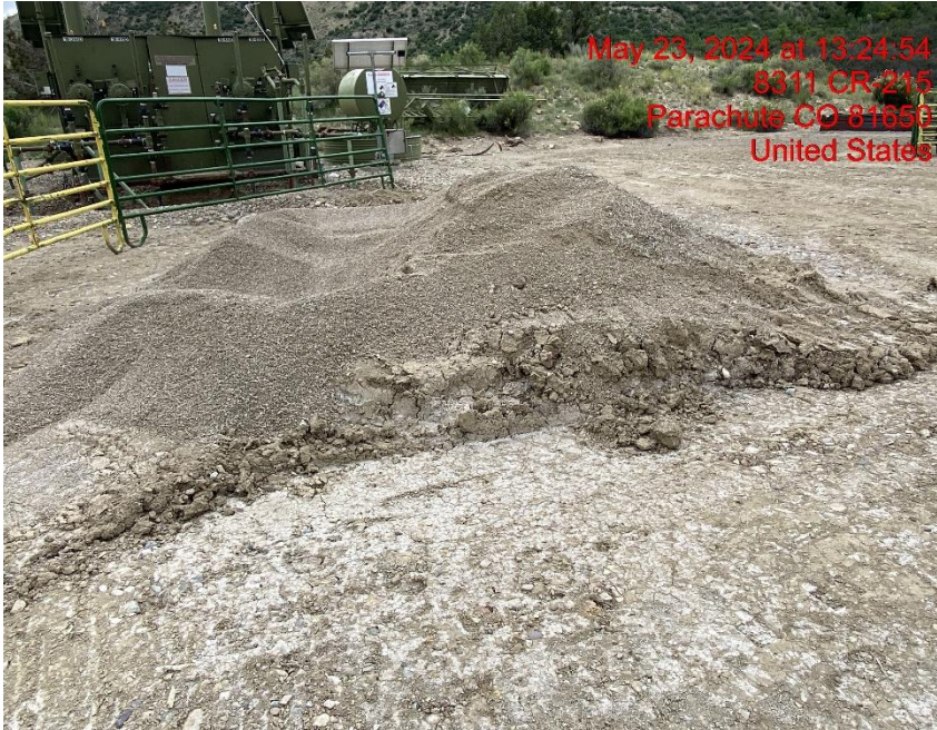
Unprotected Soil Stockpile – Photo #01359