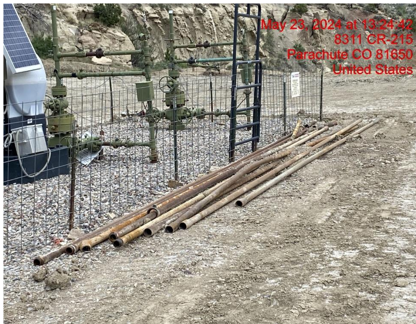
Stored Supplies/Equipment – Photo #01358