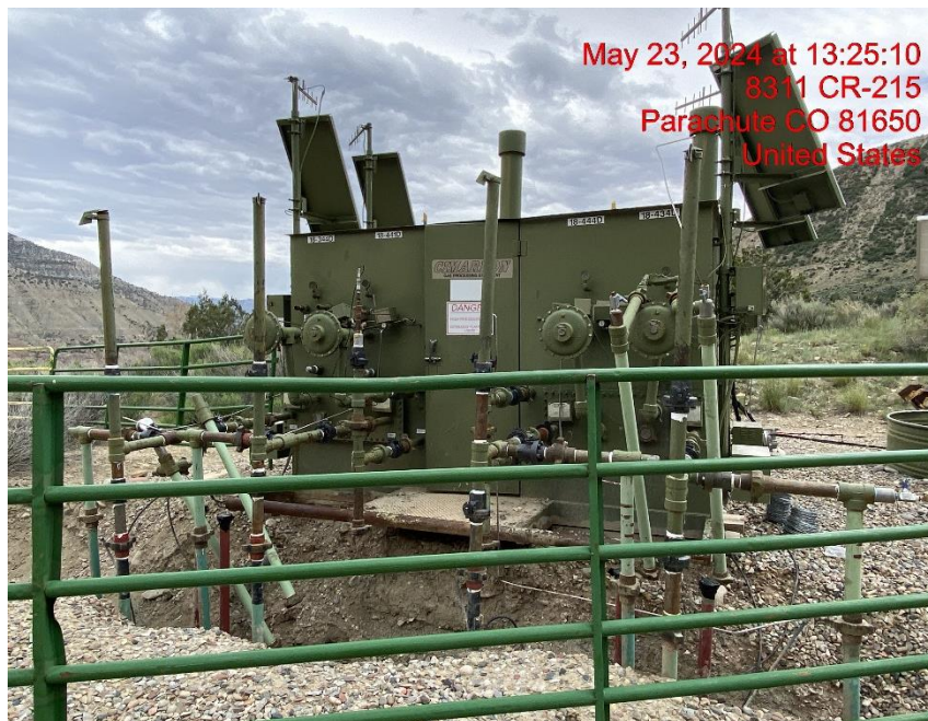
Separators – Photo #01360