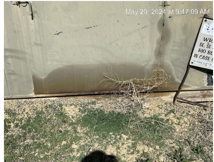
Stained soil at separator