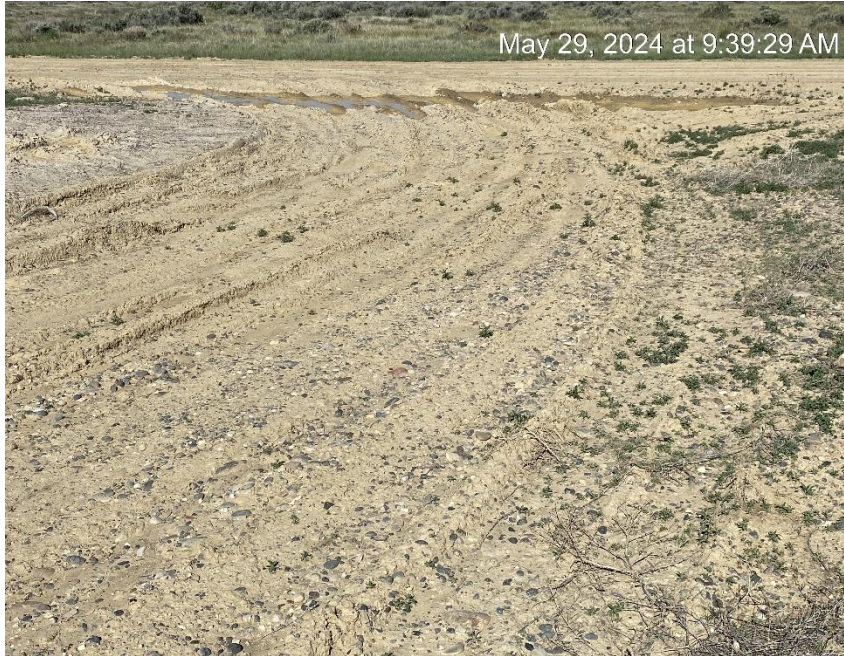
Northwest entrance/exit to location to county road