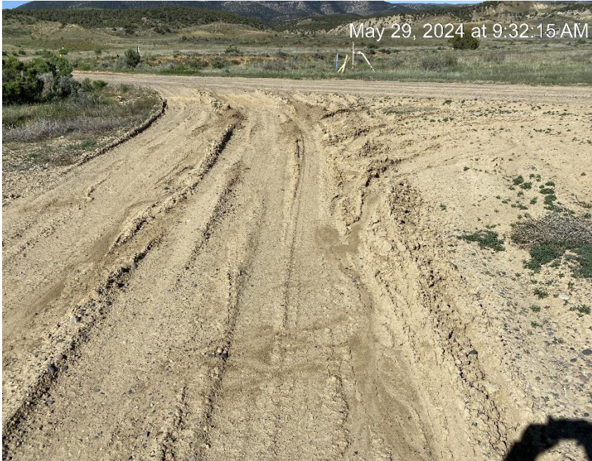
Southwest entrance/exit to county road