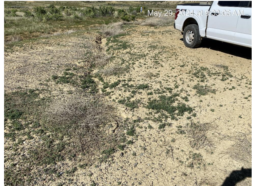
Erosion and sediment migration from location