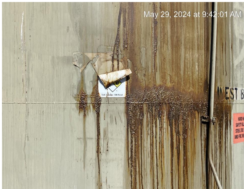
Oily waste. Illegible label.