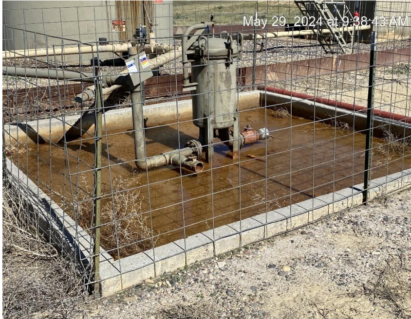
Open to wildlife