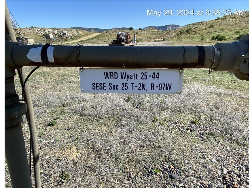
As signs are replaced additional information will be required