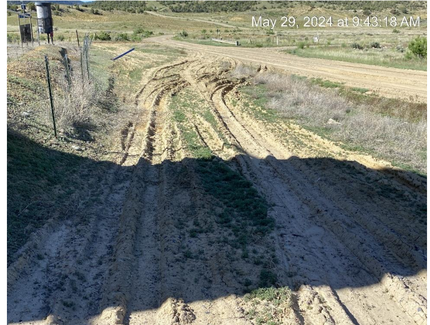
Vehicle tracking to county road