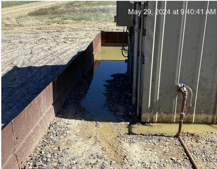
Suspect containment leak in corner