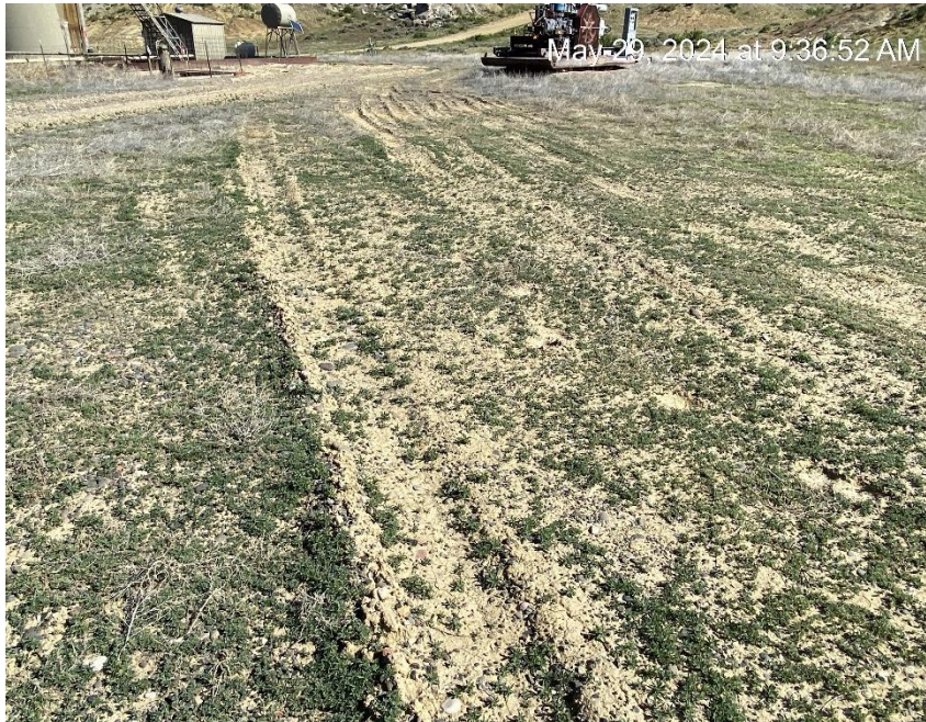
Lack of stabilization. New weed growth.