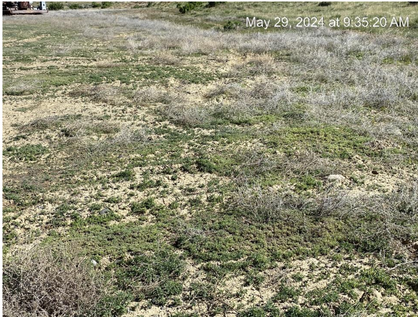
Last years and this years weed s