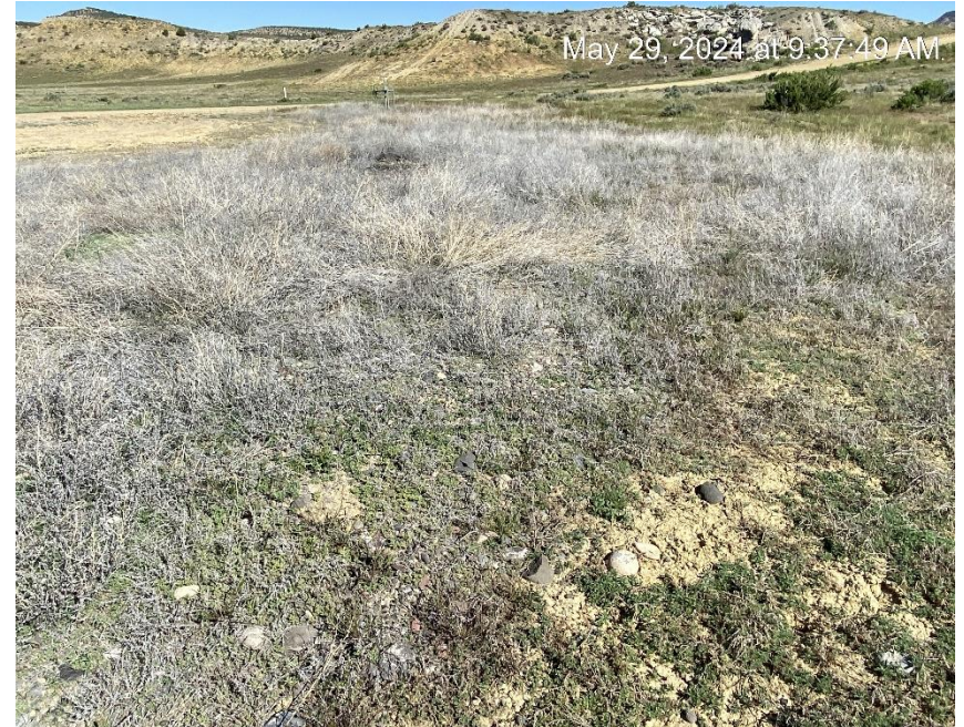
Last year and this years weeds