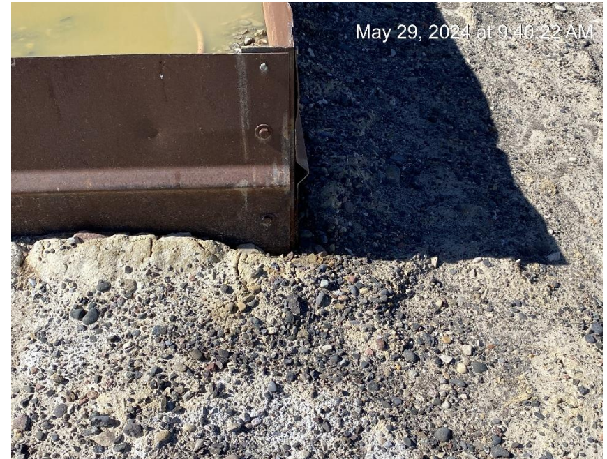
Containment corner wet