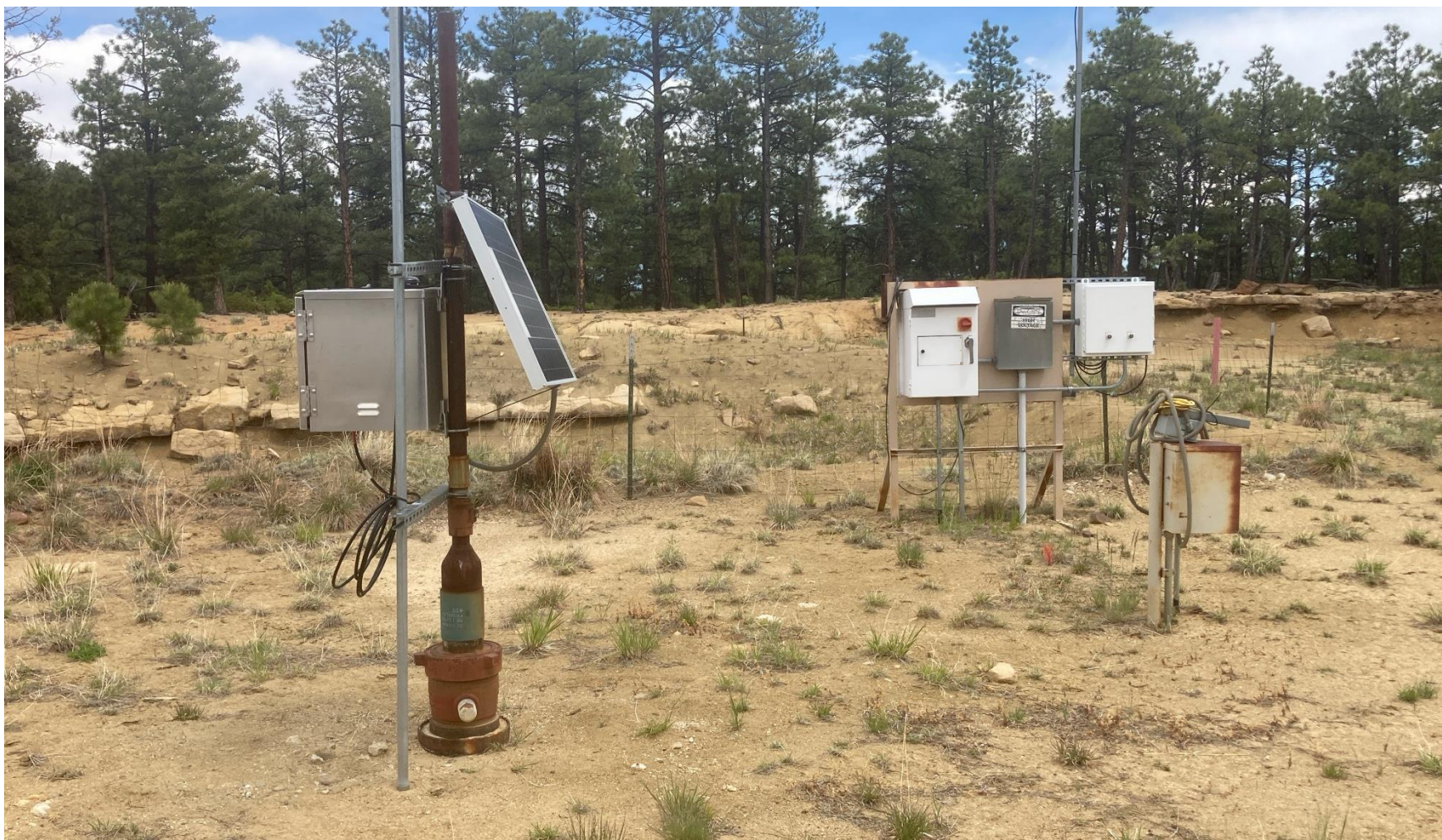
PHOTO 4: V WELLHEAD AND EQUIPMENT WELL IS SET UP AS A SEISMIC MONITOR WELL.