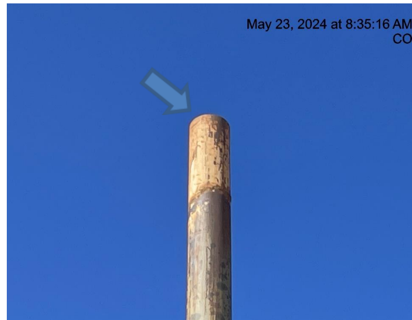
Photo # 8062 Stack/piping lacks wildlife protection/does not comply with CECMC wildlife rules