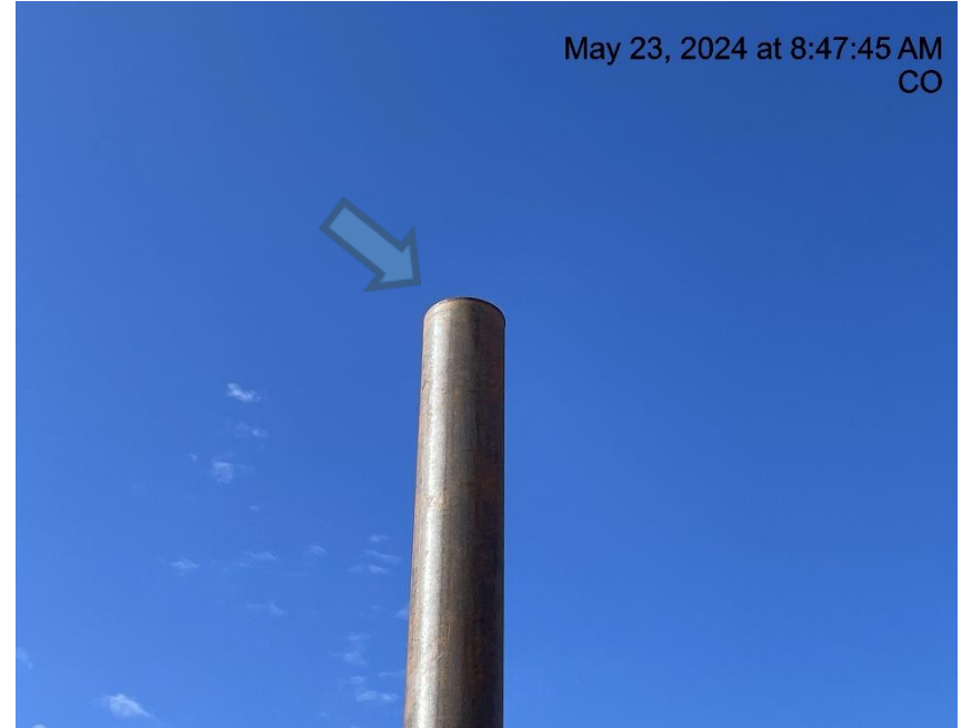
Photo # 8064 PRV vent line lacks cap/does not comply with CECMC pressure safety device rules