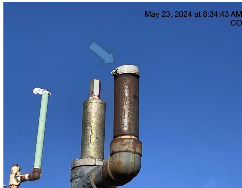
Photo # 8060 PRV vent line lacks cap/does not comply with CECMC pressure safety device rules