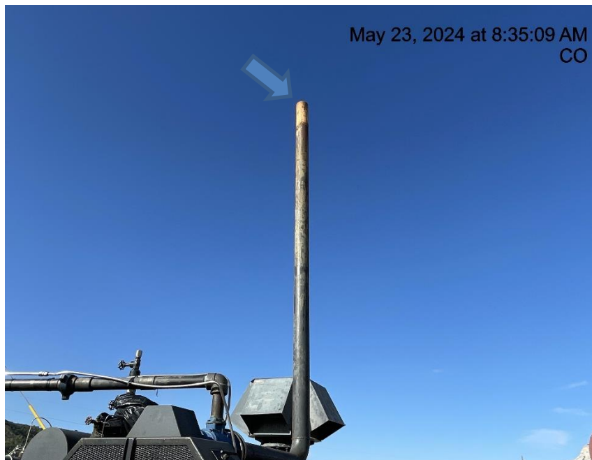
Photo # 8061 Stack/piping lacks wildlife protection/does not comply with CECMC wildlife rules