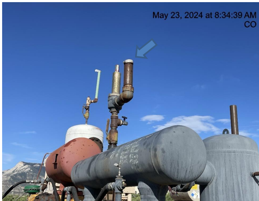
Photo # 8059 PRV vent line lacks cap/does not comply with CECMC pressure safety device rules