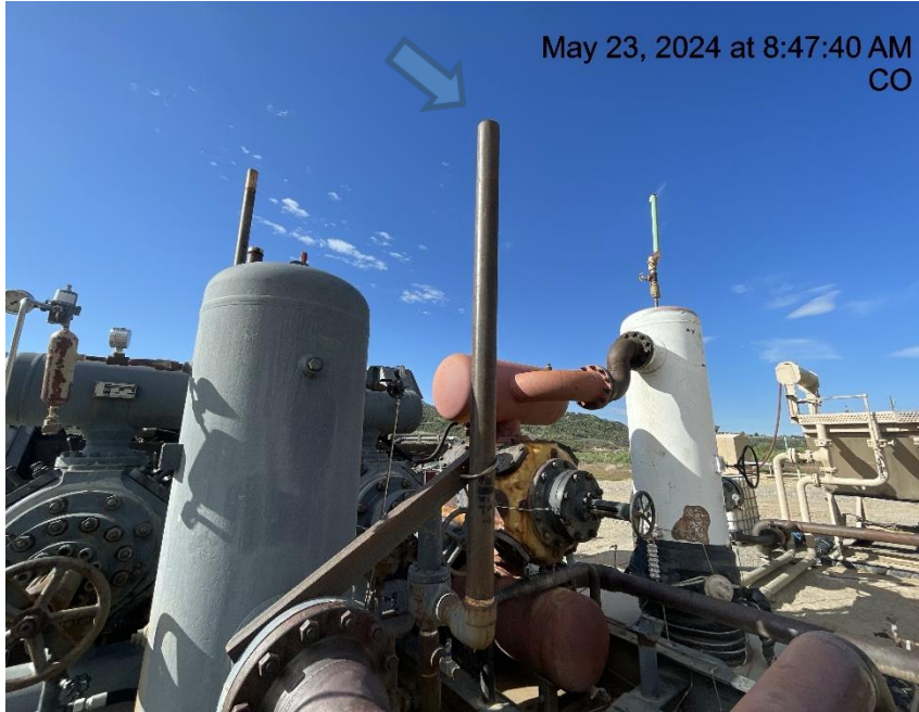
Photo # 8063 PRV vent line lacks cap/does not comply with CECMC pressure safety device rules