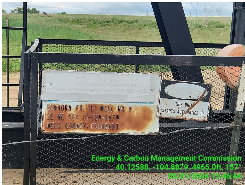
Photo 3 WH sign is faded not legible.