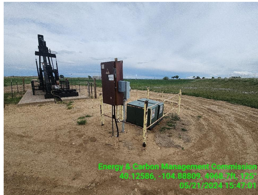
Photo 4 Ancillary equipment.