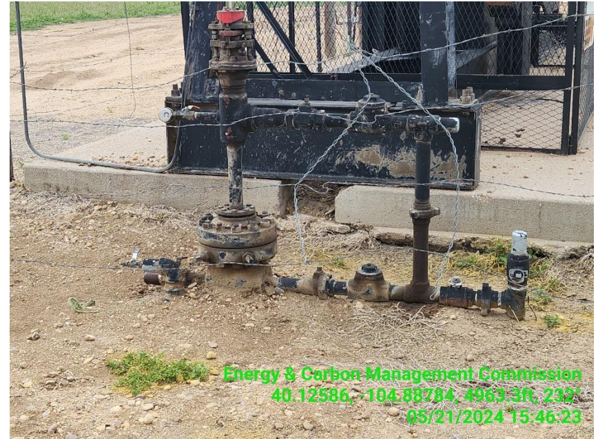
Photo 2 WH.