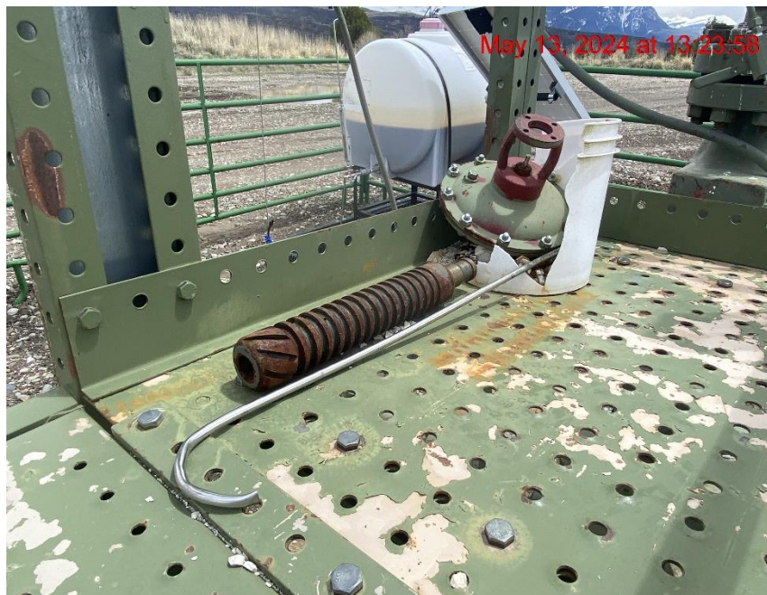
Stored Supplies – Photo #01189