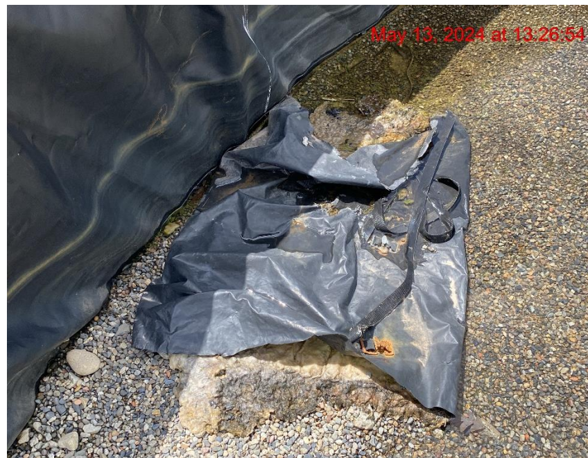
Trash/Debris – Photo #01194