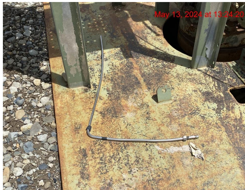
Stored Supplies – Photo #01190