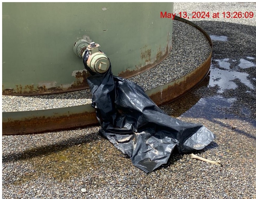
Trash/Debris – Photo #01193