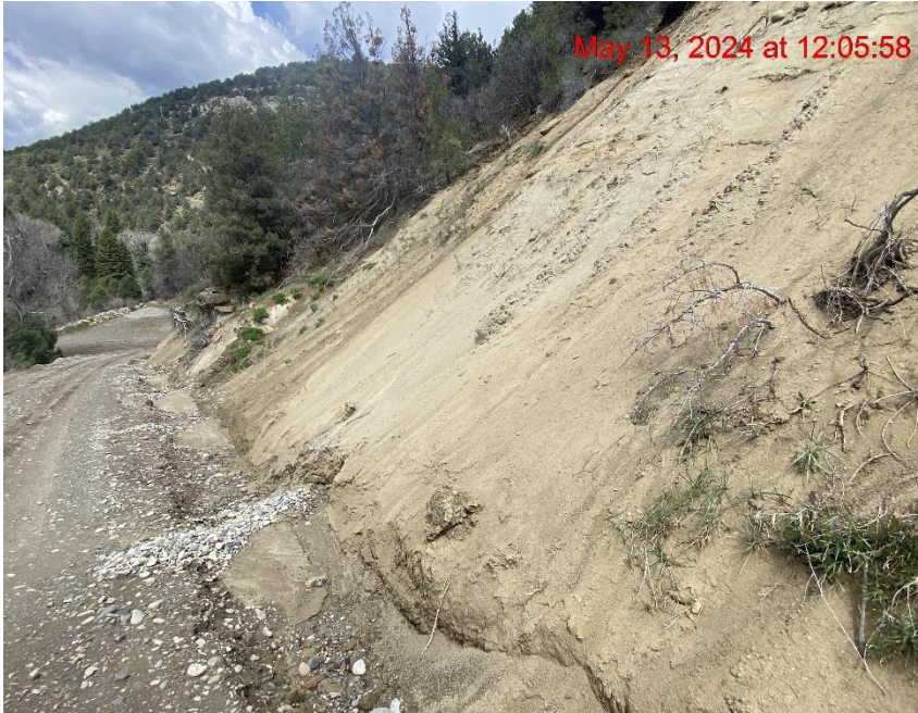
Insufficient Erosion Control/BMPs Need Maintenance on Lease Road – Photo #01131