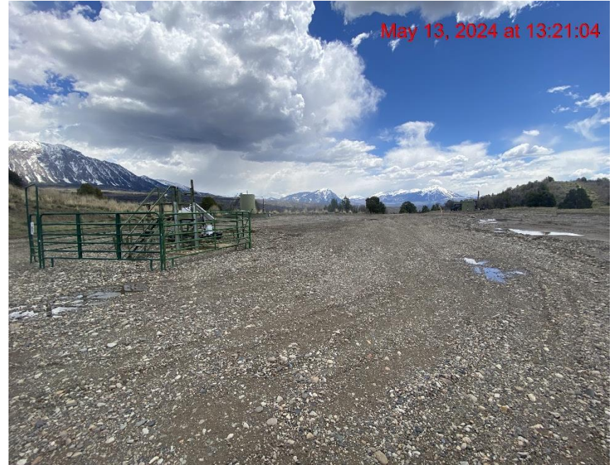
Northeast Corner of Location – Photo #01185