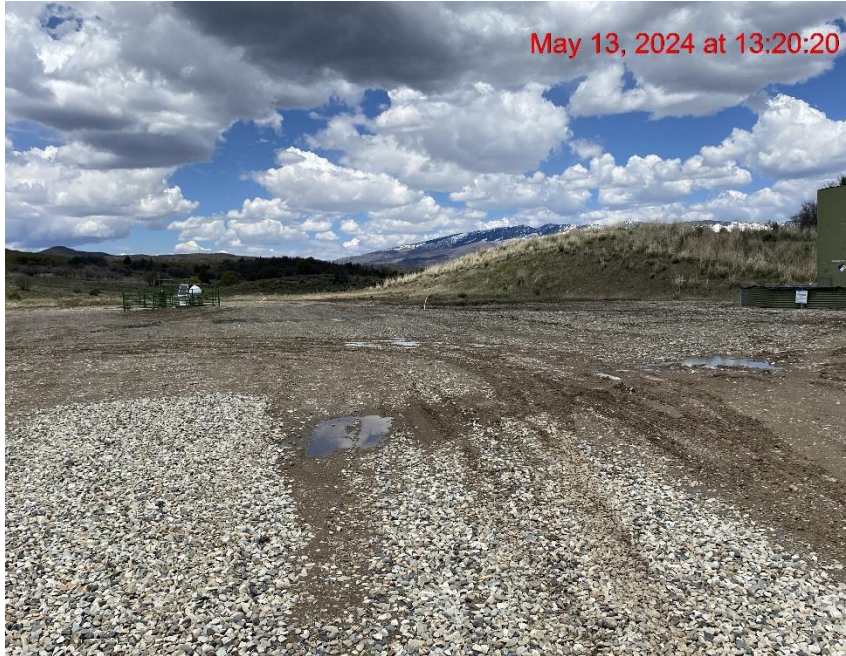
Location Entrance – Photo #01183