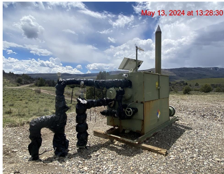
Wellhead – Photo #01187