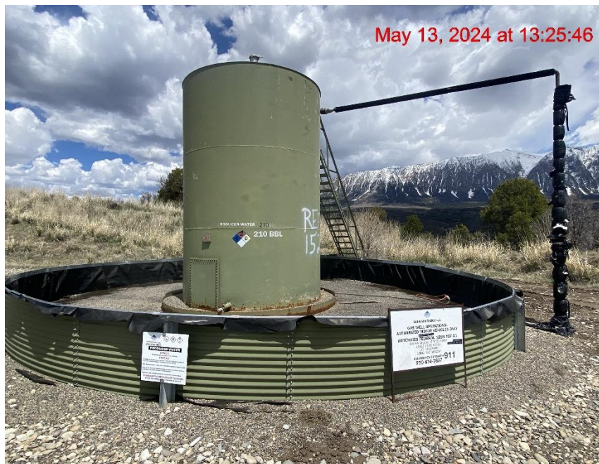
Tank Battery – Photo #01191