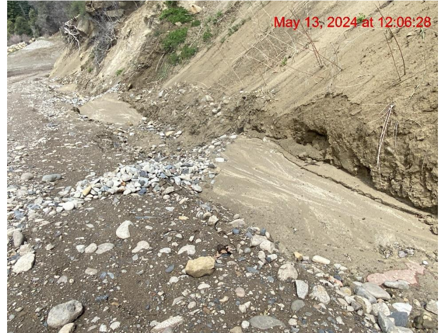
Insufficient Erosion Control/BMPs Need Maintenance on Lease Road – Photo #01132