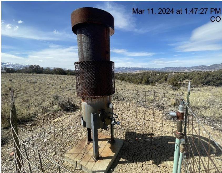
Photo # 9283 From inspection 708903254 conducted on 03/11/2024 - Unused equipment/ECD disconnected