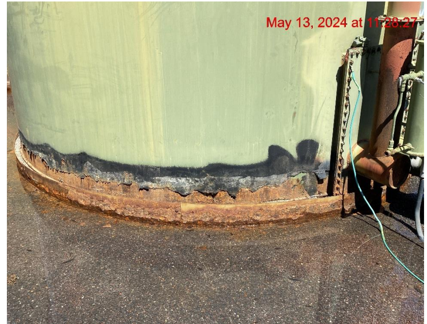
Corroded Tank Wall/Chime – Photo #01118