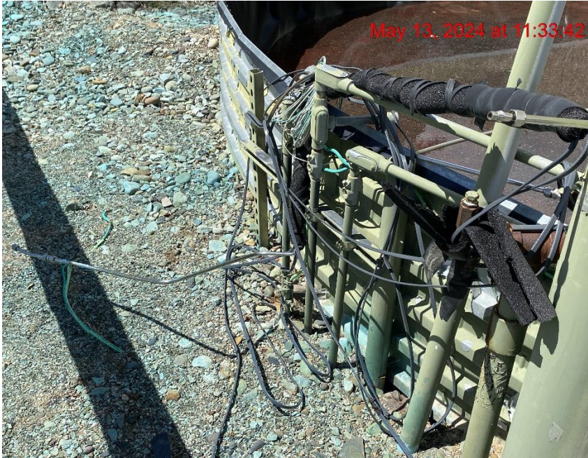
Unused Equipment – Photo #01119