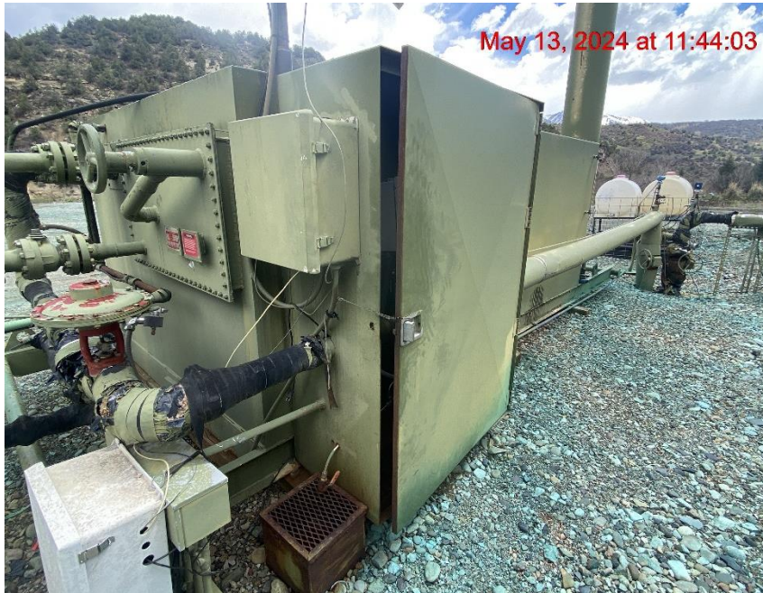
Unsecured Separator – Photo #01123