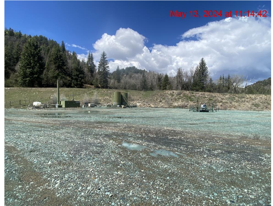
Southeast Corner of Location – Photo #01110