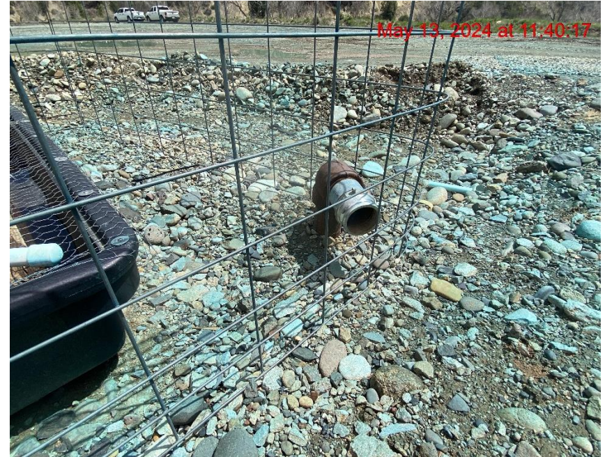
Open-Ended Line – Photo #01122