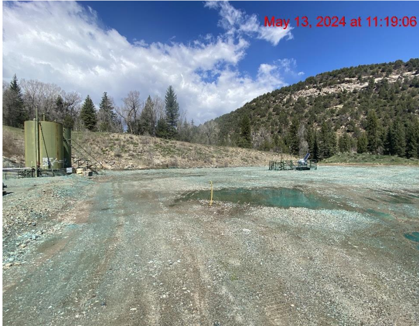
Location Entrance – Photo #01113