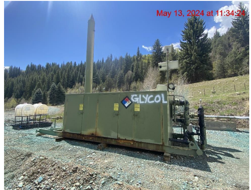
Separator – Photo #01120