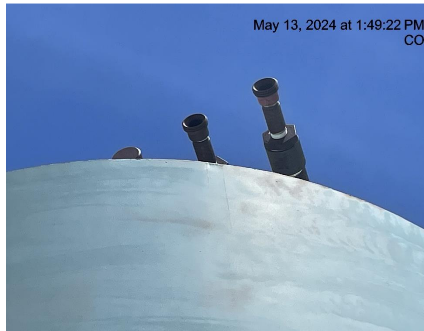
Photo # 6750 Open ended lines on out of service tank/wildlife hazards