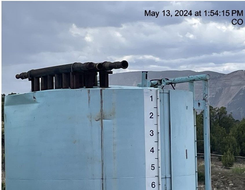
Photo # 6752 Open ended lines on out of service tank/wildlife hazards