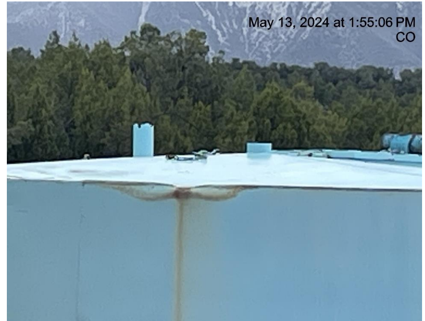
Photo # 6753 Open ended piping & port on out of service tank/wildlife hazards