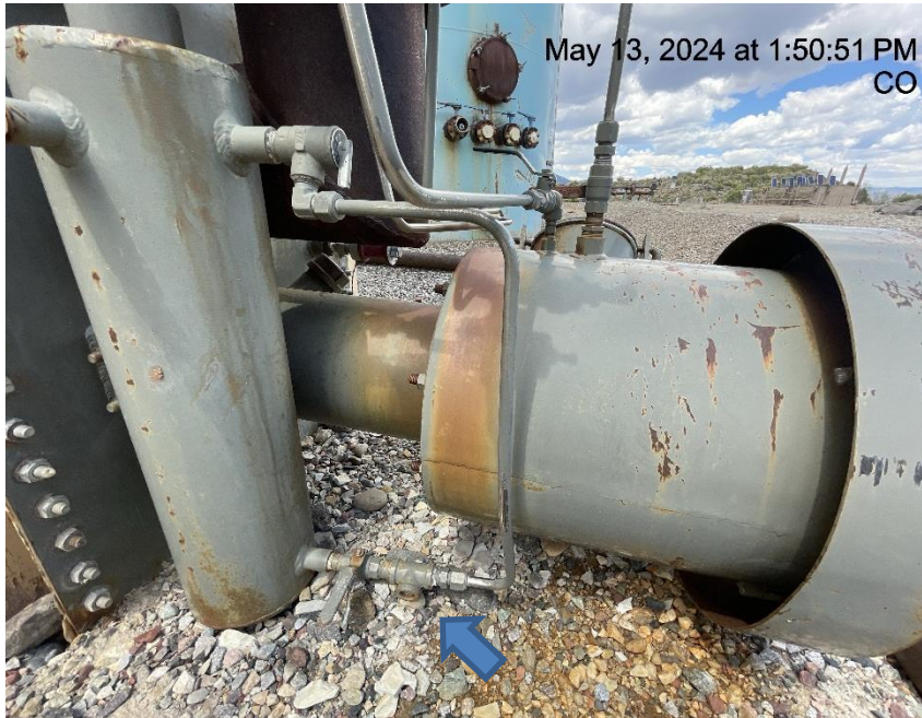
Photo # 6754 PRV vent line does not comply with CECMC pressure safety device rules