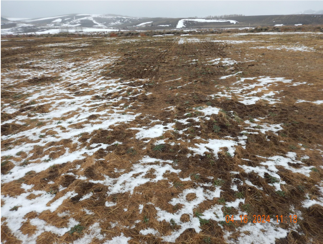
Photo 5. Photo taken from the eastern interim reclamation area, facing North. Photo illustrates interim reclamation has been performed with the evidence of germination of grass species and straw crimped mulch.