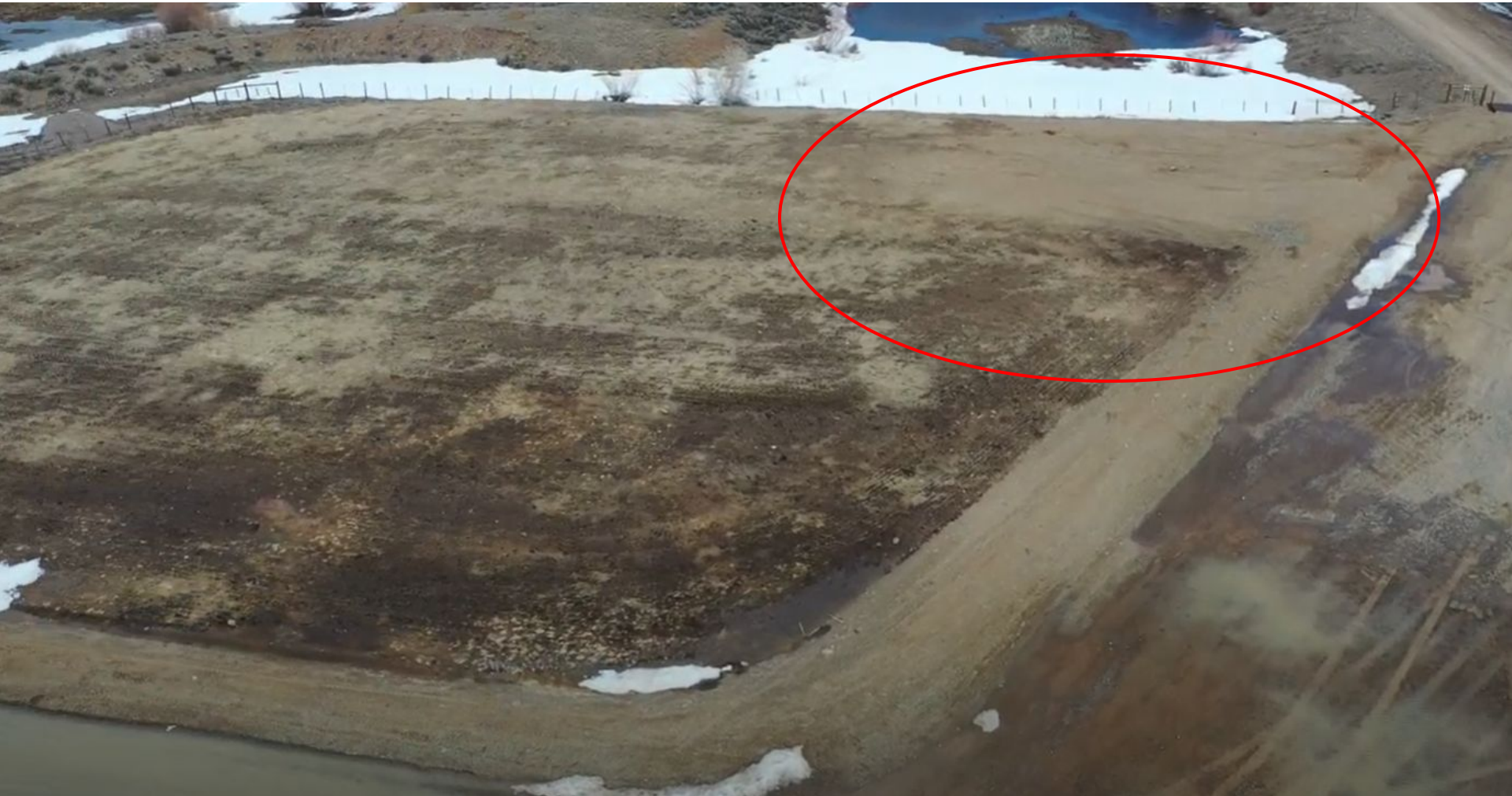
Photo 1. Drone imagery illustrates a portion of the interim reclamation area needs to be reclaimed. Refer to Photo 4.