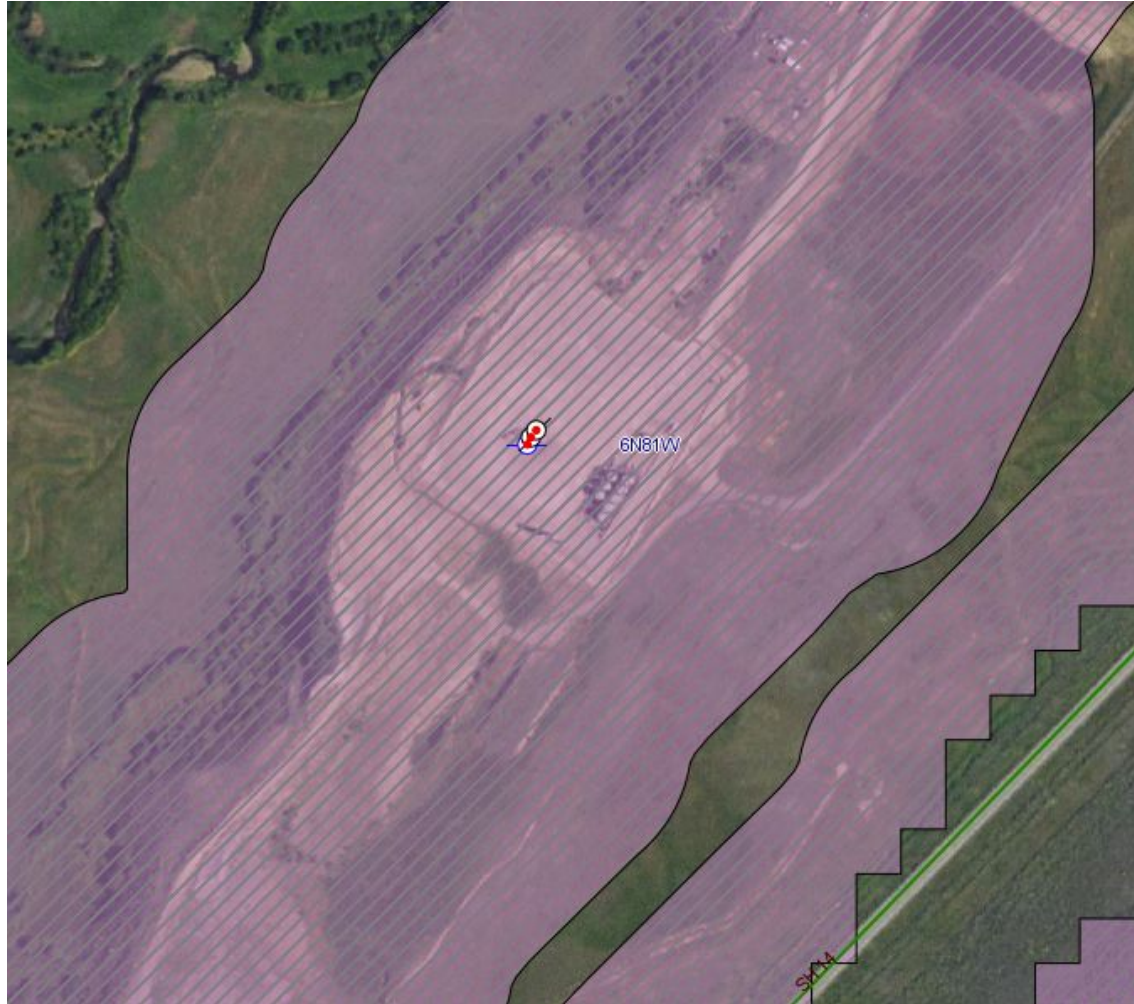
Photo 6. ECMC GIS aerial imagery illustrates the location falls within Greater Sage Grouse General Habitat Management Area.