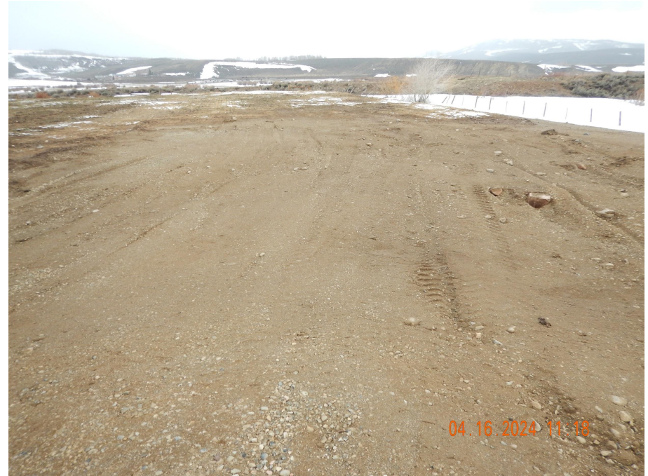
Photo 4. Photo taken from the eastern interim reclamation area, facing North. Photo illustrates an area that needs to be reclaimed.