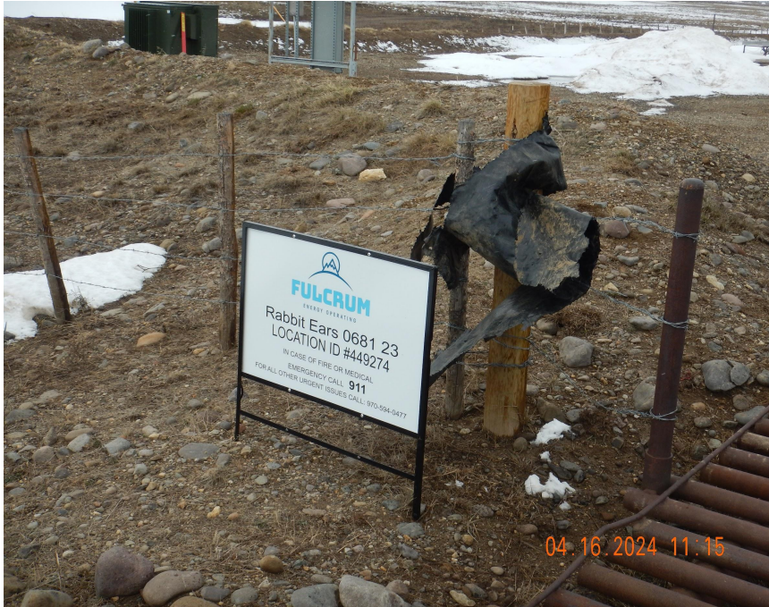
Photo 3. Photo taken from the entrance of location. Photo illustrates the Location Operator sign and debris caught in the fencing. This appears to have been removed based on the most recent inspection conducted on May 1, 2024.