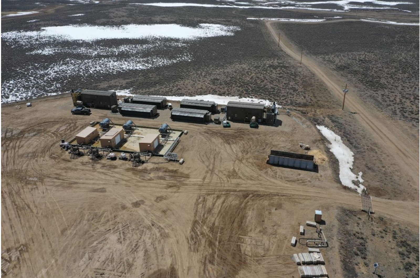
Photo 1. Drone imagery illustrates Fulcrum's 3rd party cloud computing/data processing company along the western perimeter of the working pad surface.