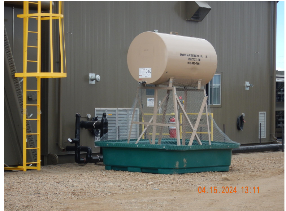
Photo 4. Photo taken from the western working pad surface, facing West. Photo illustrates the equipment and secondary containment has proper wildlife protection.