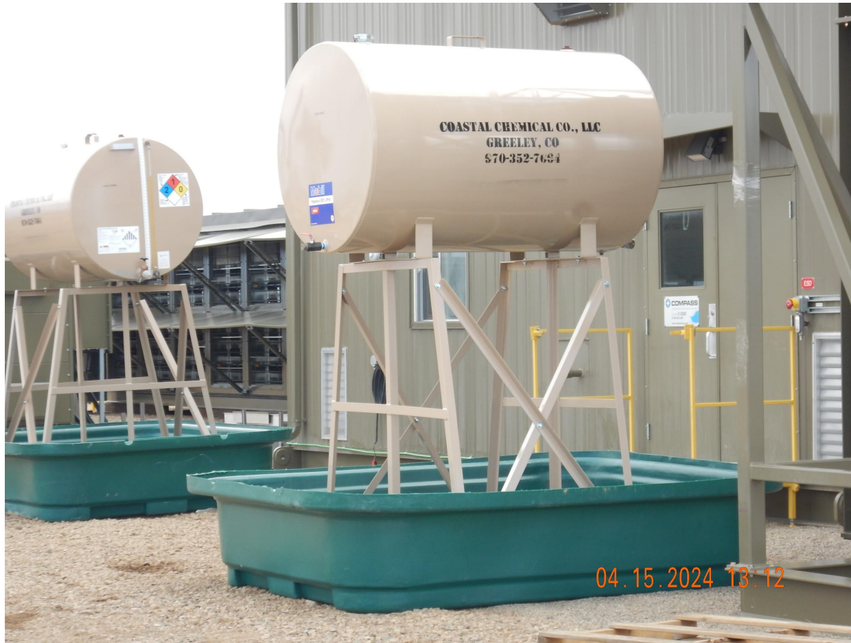
Photo 5. Photo taken from the southern working pad surface, facing Southeast. Photo illustrates the equipment and secondary containment lacks wildlife protection.