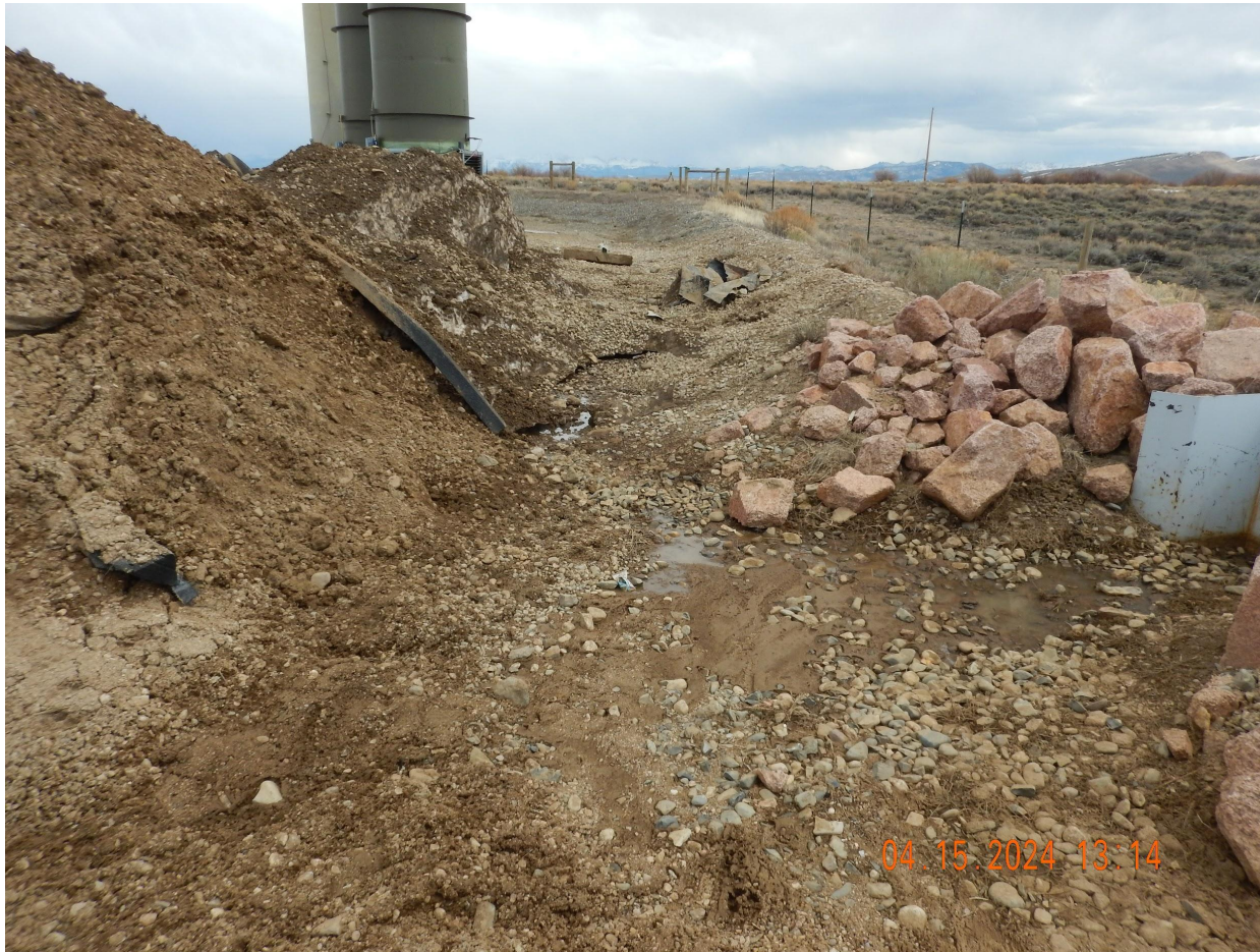
Photo 6. Photo taken from the southeastern working pad surface, facing East. Photo illustrates a snow plow pile with random debris. Operator reported that as the pile melts debris is being removed and being properly disposed of.