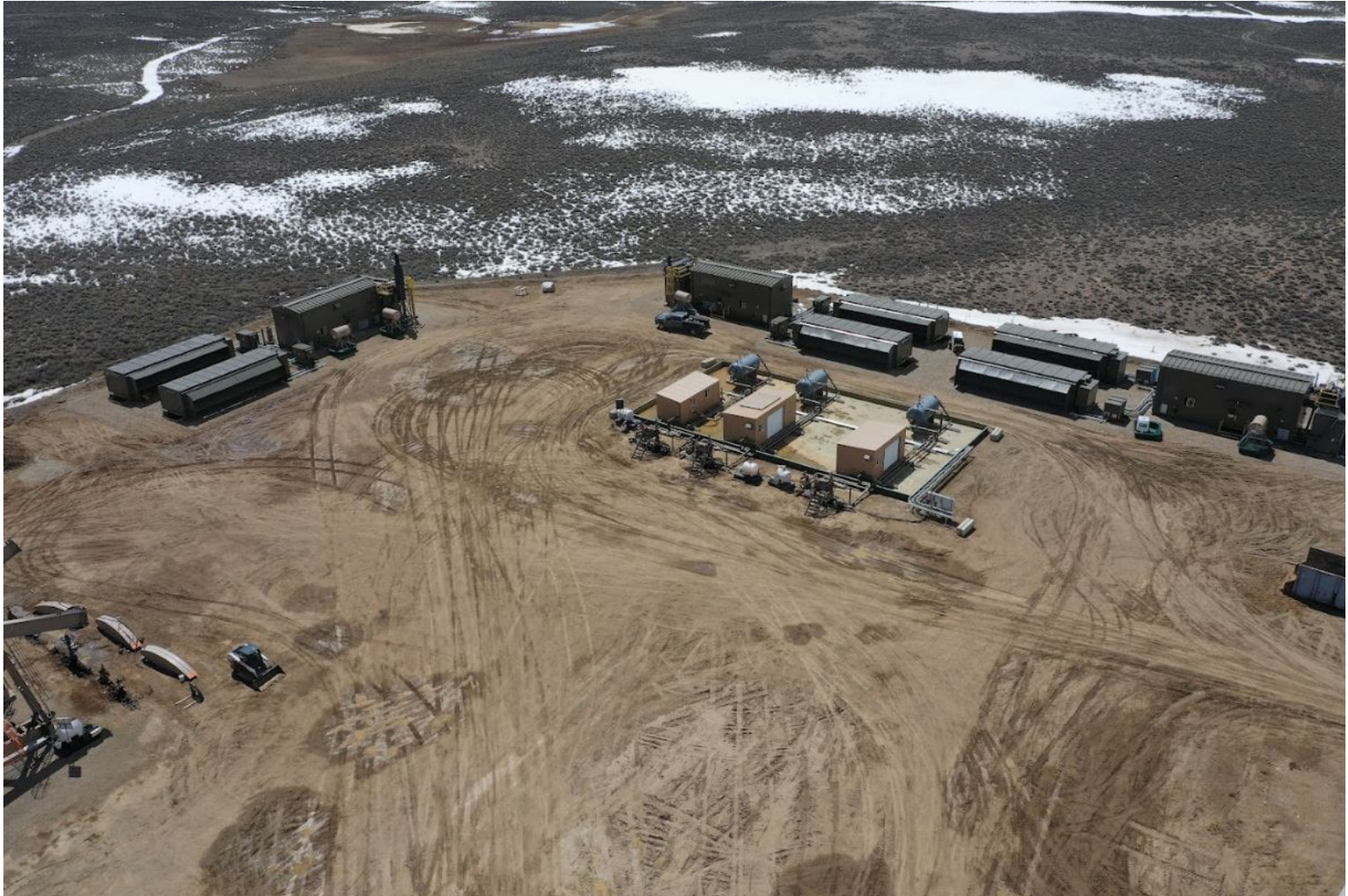
Photo 2. Drone imagery illustrates Fulcrum's 3rd party cloud computing/data processing company along the western and southern perimeter of the working pad surface.