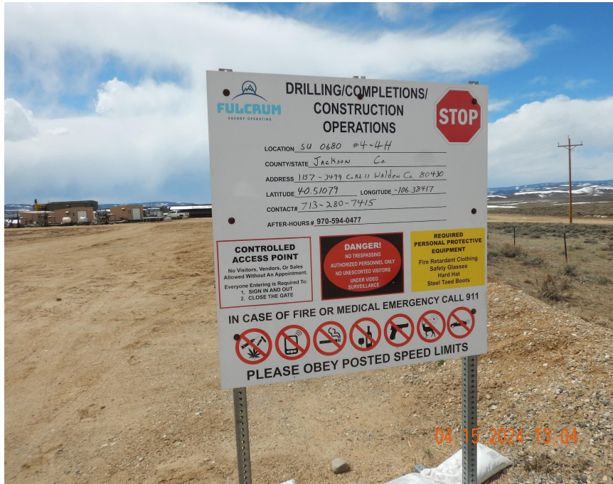
Photo 3. Photo taken from the entrance of location. Photo illustrates the Location Operator sign.