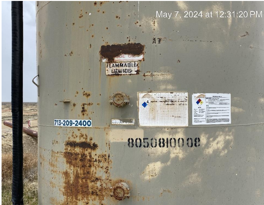
Missing required information