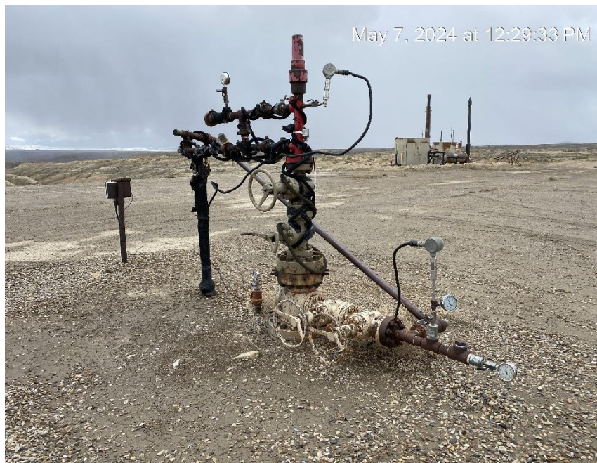
No sign at wellhead