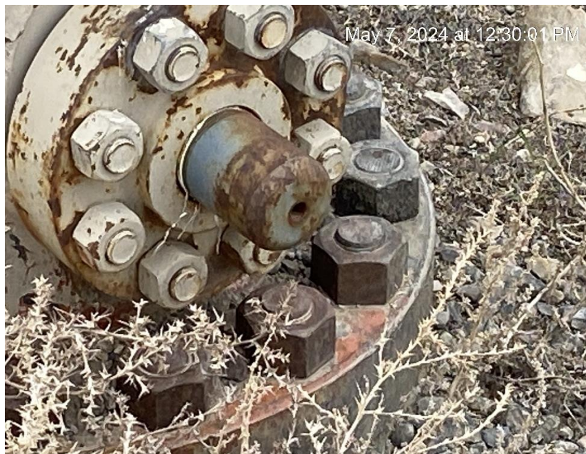
Blanking plug in wellhead?