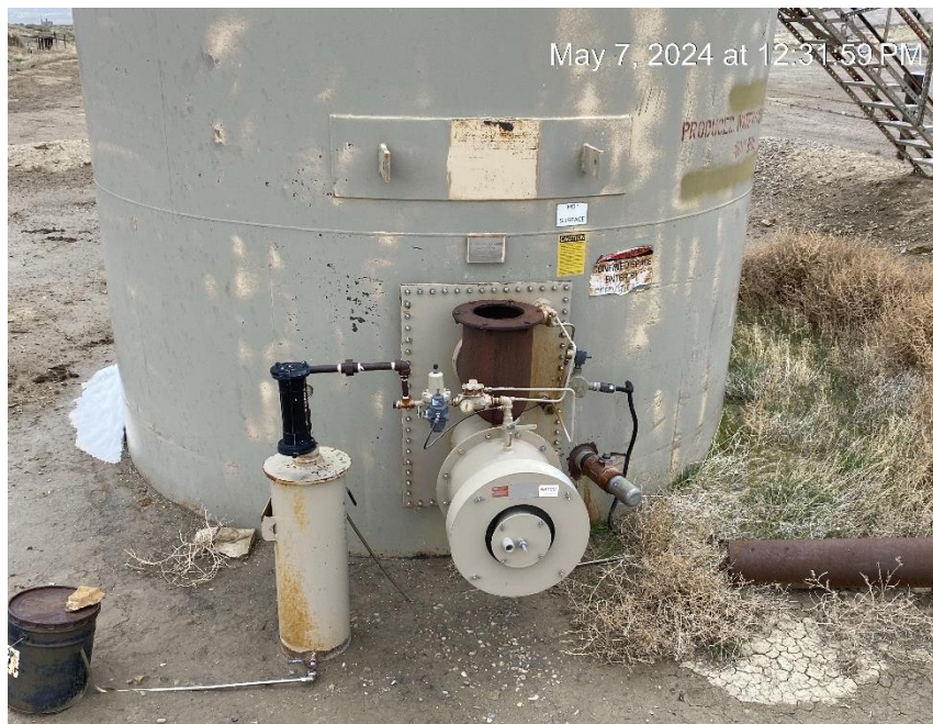
Open to wildlife