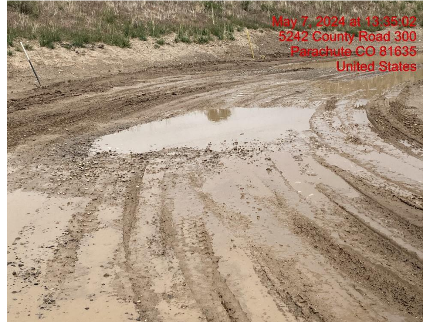
Lack of Stabilization – Photo #00994