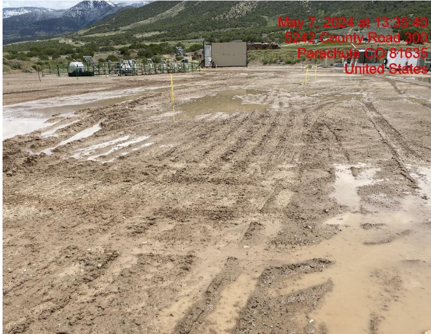
Lack of Stabilization – Photo #00995