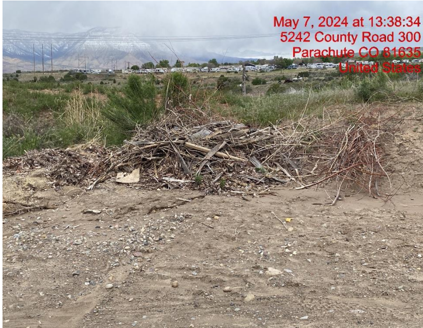
Debris – Photo #00999