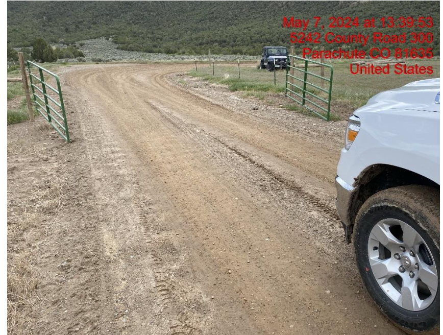
Insufficient Vehicle Tracking BMPs at Location Entrance/Exit – Photo #01000