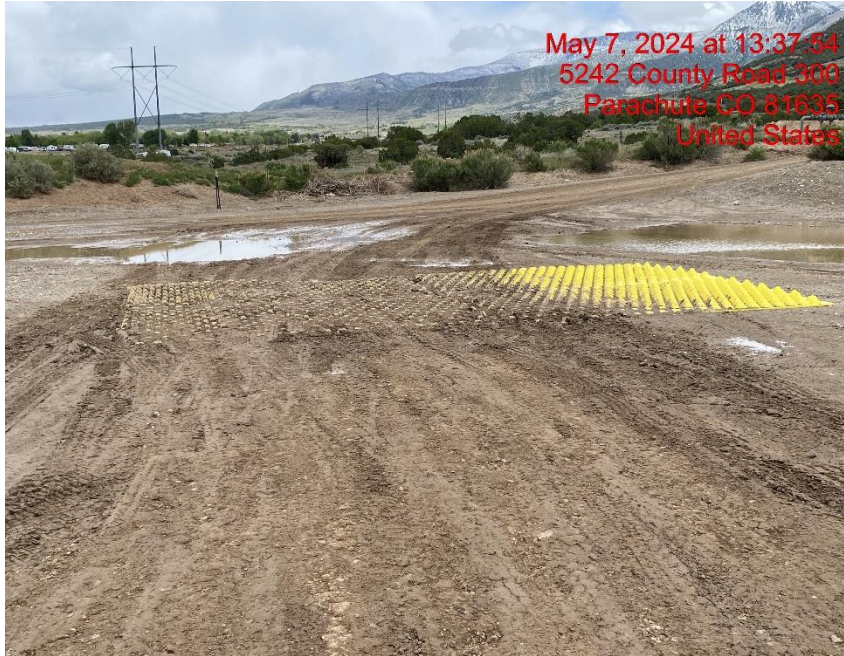
Insufficient Tracking BMP – Photo #00997