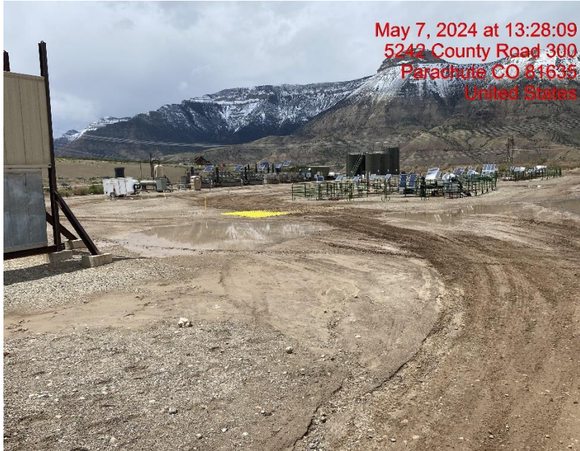
Location Entrance – Photo #00985