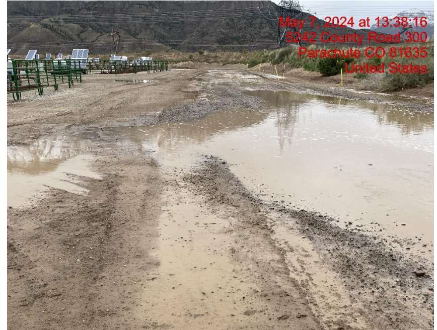
Lack of Stabilization – Photo #00998