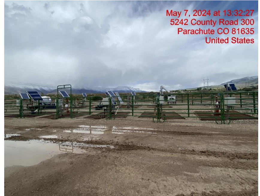
Wellheads – Photo #00990