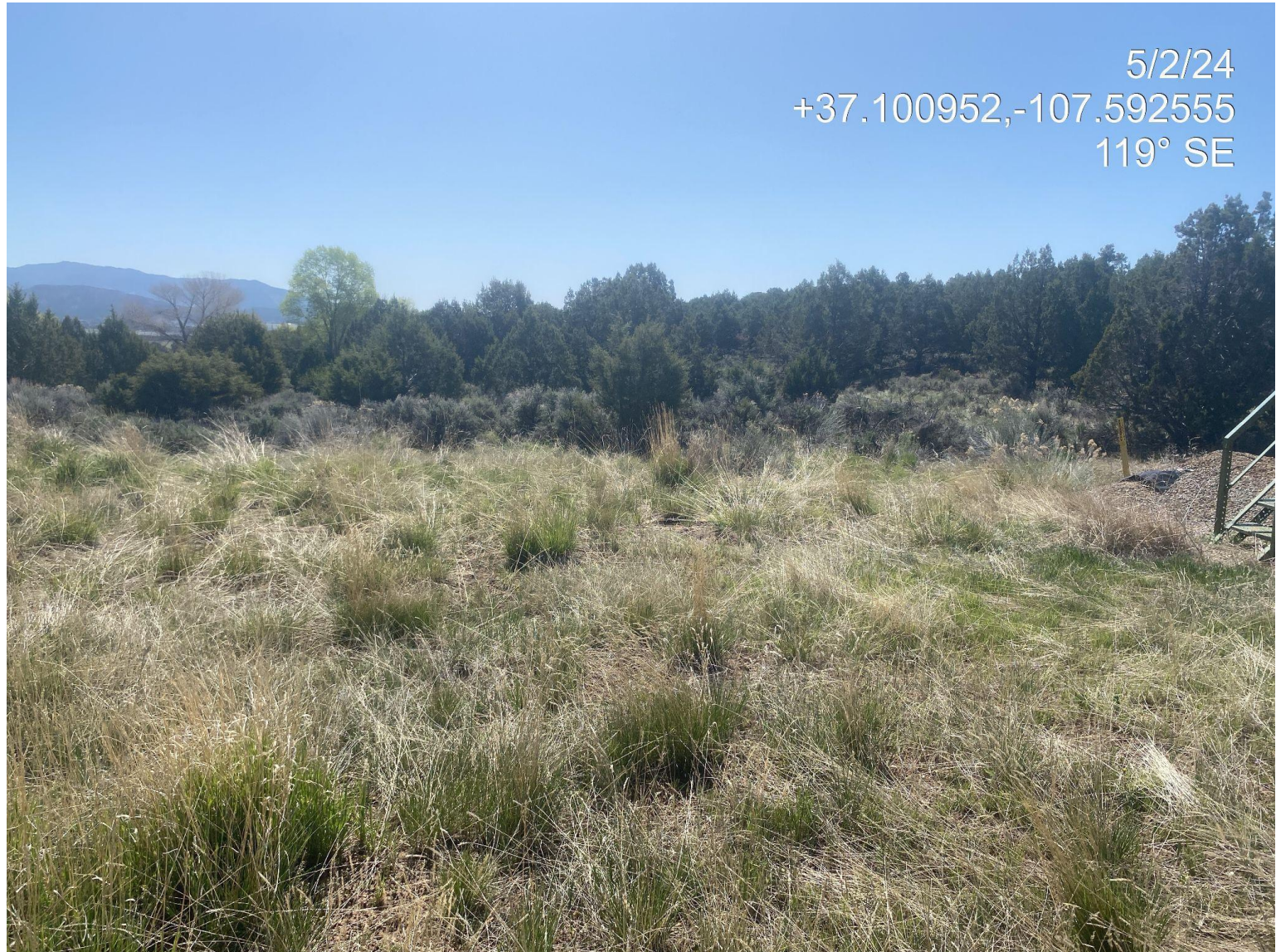
Photo 4. View of the eastern interim reclamation area facing southeast. Vegetation comprised of crested, western wheatgrass and rabbit brush.

Inspection Photos Location Name: B E Behrmann 1 Location ID: 333388