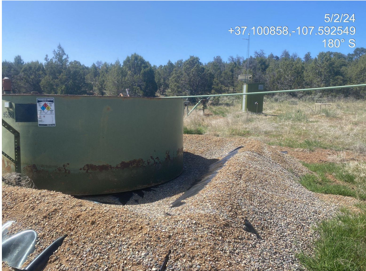
Photo 2. Produced water tank label and weeds at berm corrective actions identified in the previous inspection doc #702500045 have been addressed/resolved.