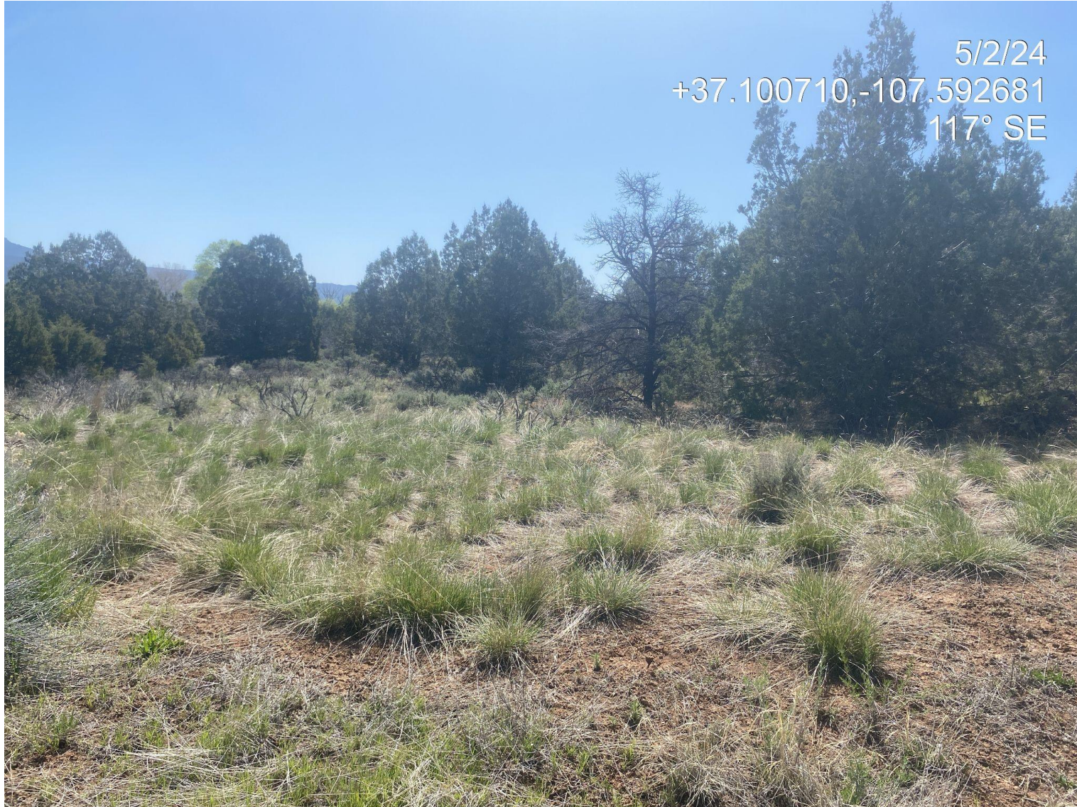
Photo 5. Reference area comprised of crested wheatgrass, sage brush and juniper.