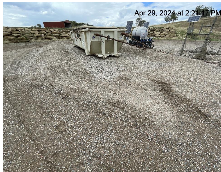
Photo # 5442 Earthen secondary containment damaged /does not comply with CECMC secondary containment rules