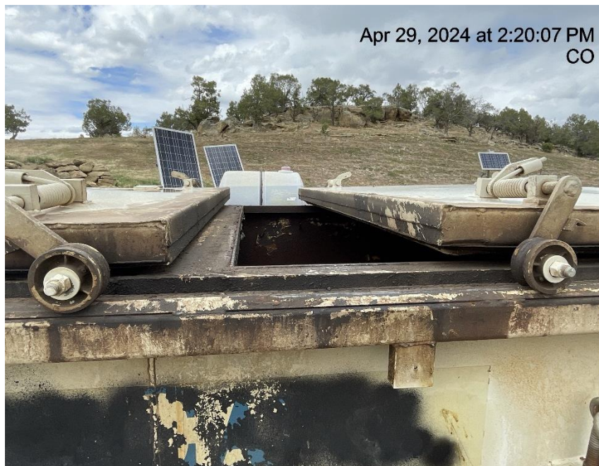
Photo # 5441 Tank is partially open & available for entry by wildlife/wildlife hazard