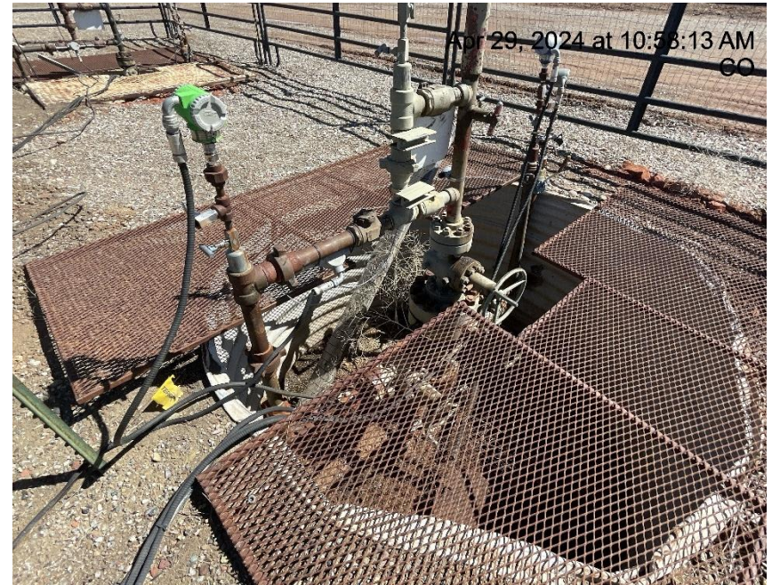
Photo # 5236 Cellar not properly covered/wildlife & personnel hazard