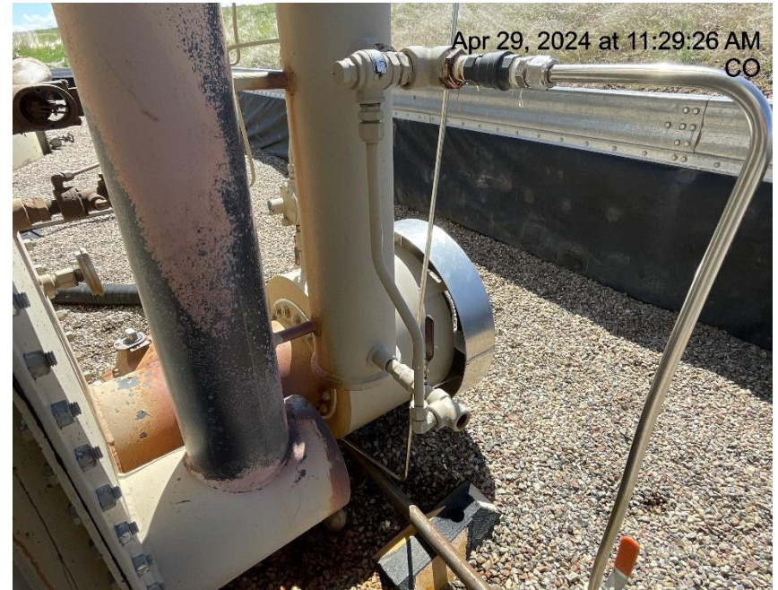
Photo # 5242 PRV vent line terminates in an unsafe manner /does not comply with CECMC pressure safety device rules & general safety rules