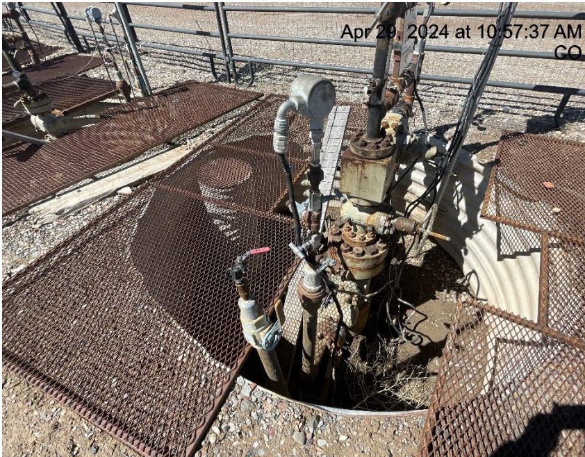
Photo # 5235 Cellar not properly covered/wildlife & personnel hazard