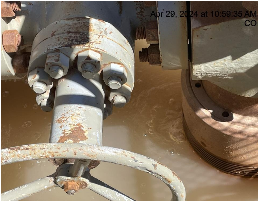
Photo # 5237 Possible wellhead leak/gas bubbling up around wellhead through water in cellar