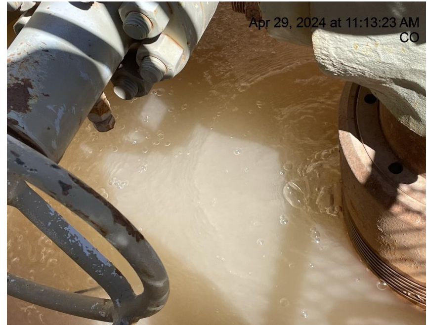
Photo # 5238 Possible wellhead leak/gas bubbling up around wellhead through water in cellar