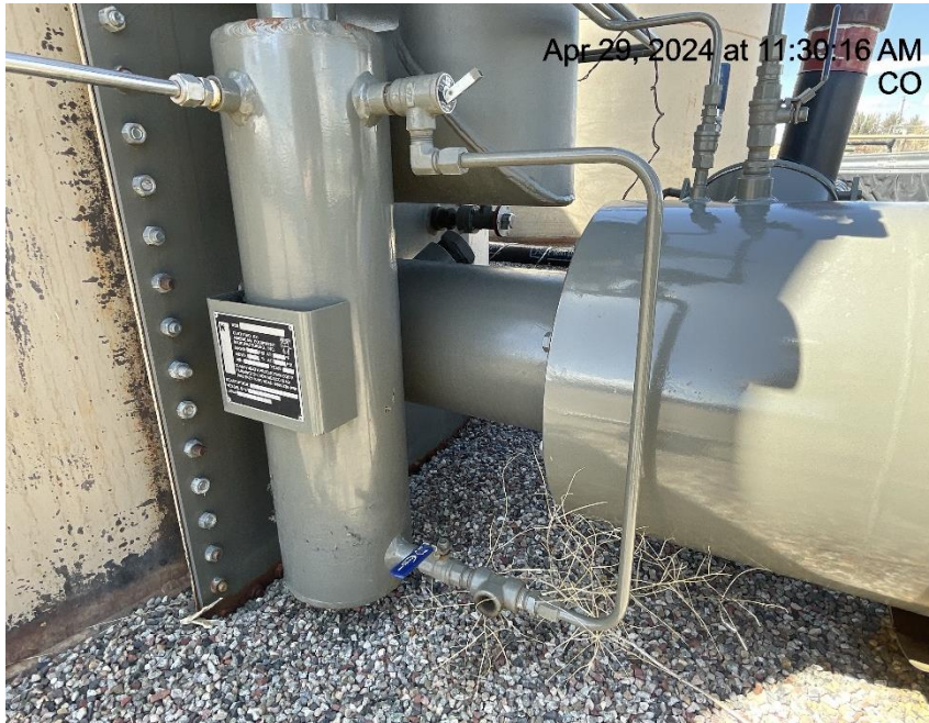
Photo # 5241 PRV vent line terminates in an unsafe manner /does not comply with CECMC pressure safety device rules & general safety rules