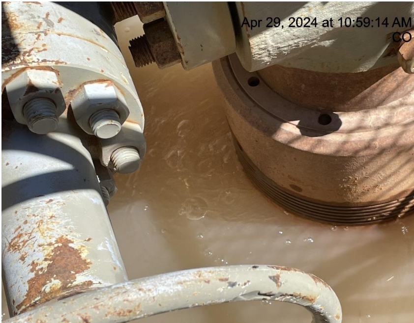
Photo # 5239 Possible wellhead leak/gas bubbling up around wellhead through water in cellar