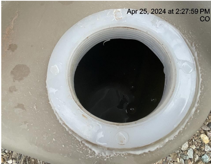
Photo # 5152 Failure to maintain chemical BMP/chemical containment approximately 3/4 full of fluid/not sufficient to contain possible spill