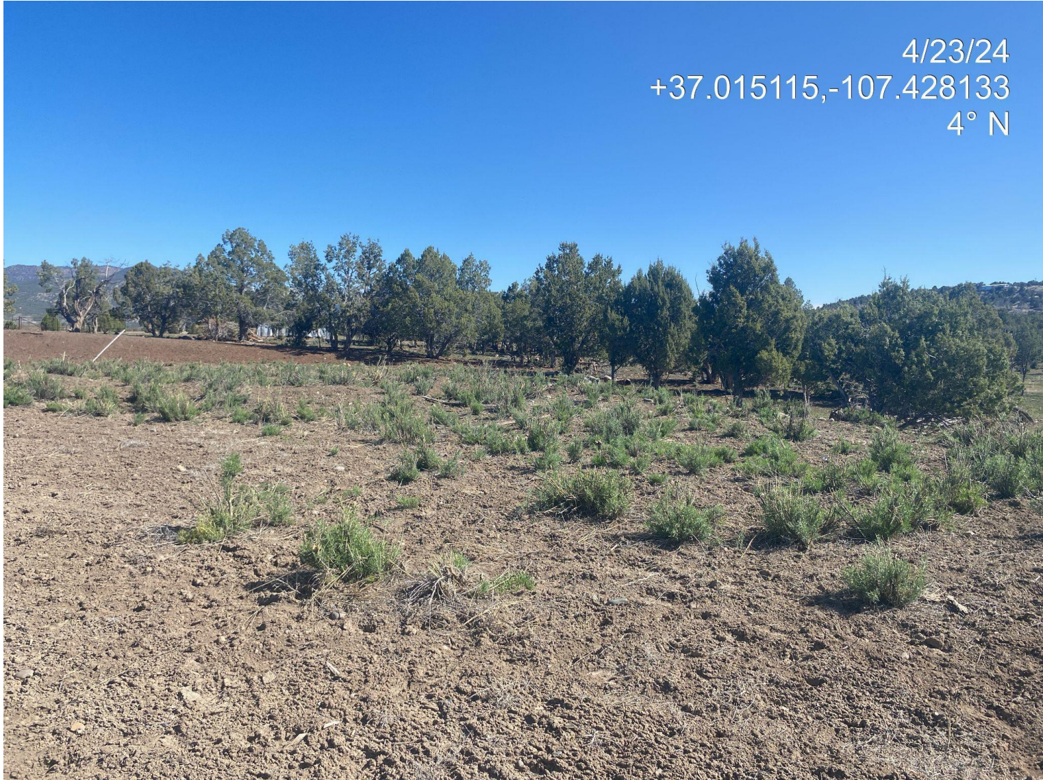
Photo 5. View of the northern interim reclamation area comprised of rabbit brush.