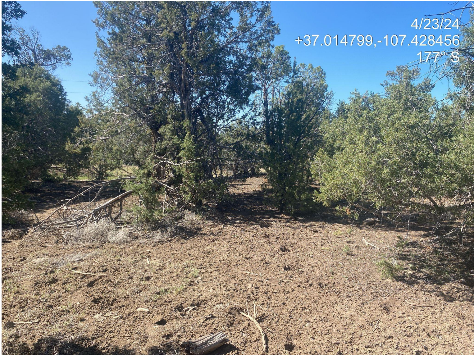
Photo 6. Reference area comprised of juniper and under story of grazed grasses.