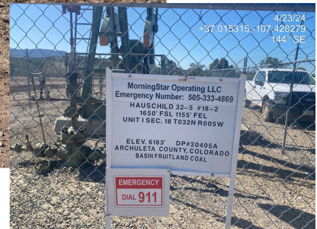
Photo 1. View of the disturbance taken from the access point facing center.