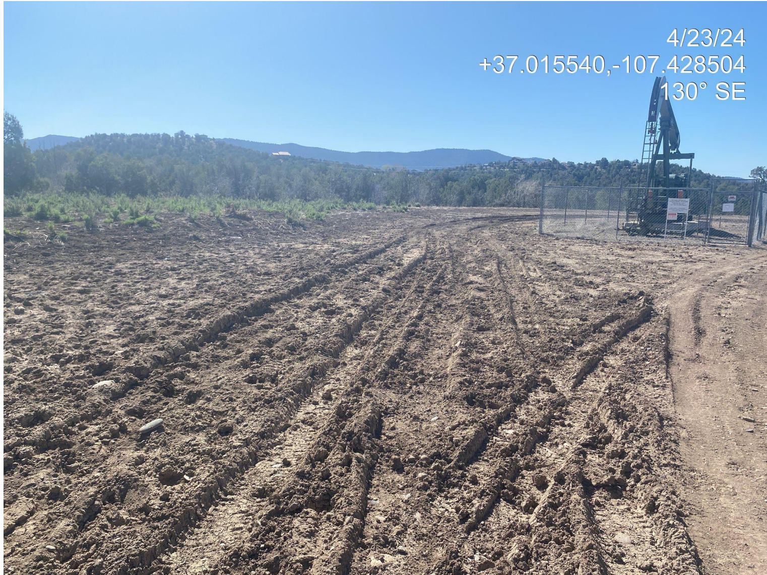
Photo 3. Rutting observed on location, additional stabilization is needed to minimize site degradation.