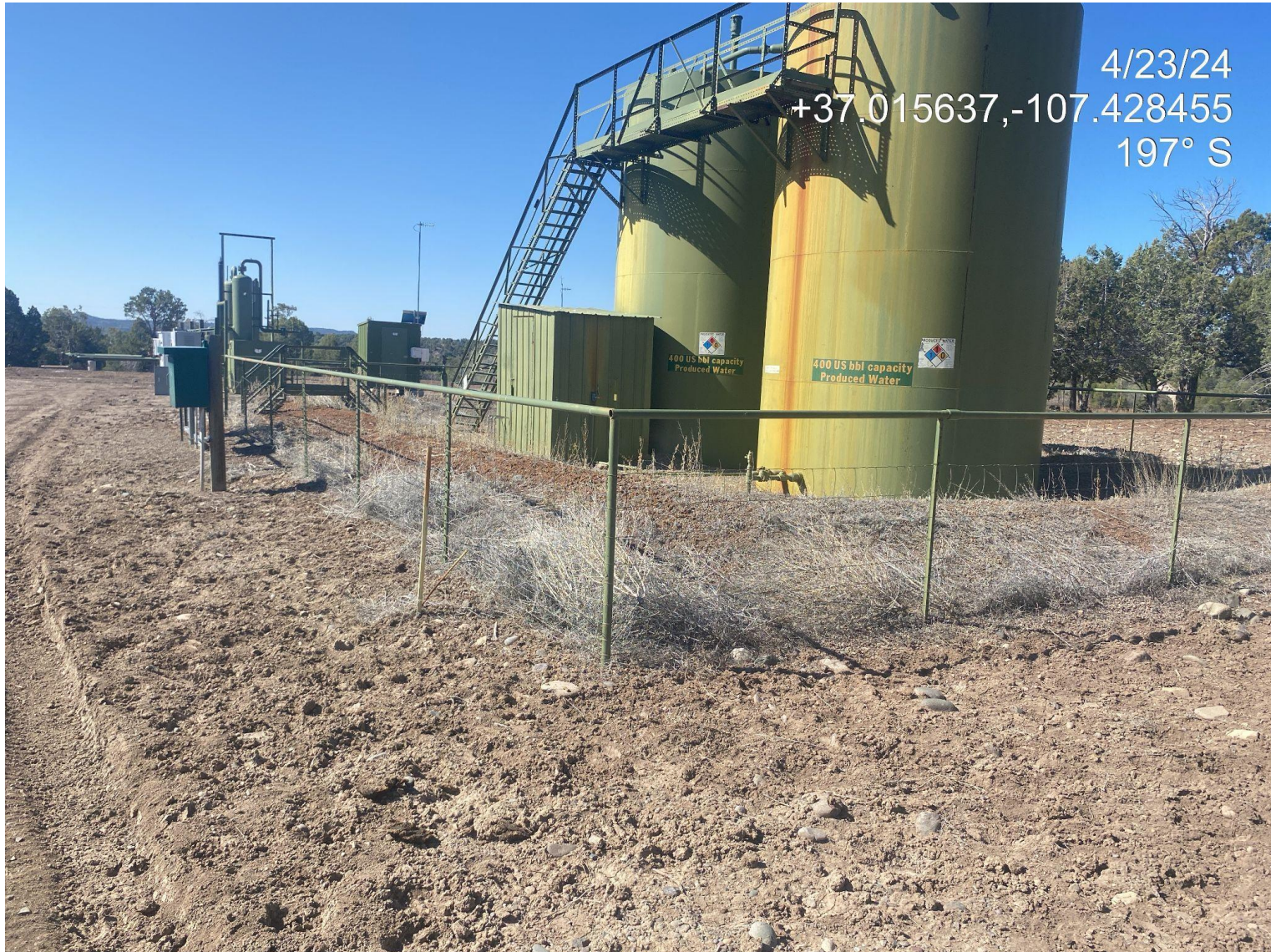
Photo 2. Weedy debris observed at the tank berm.