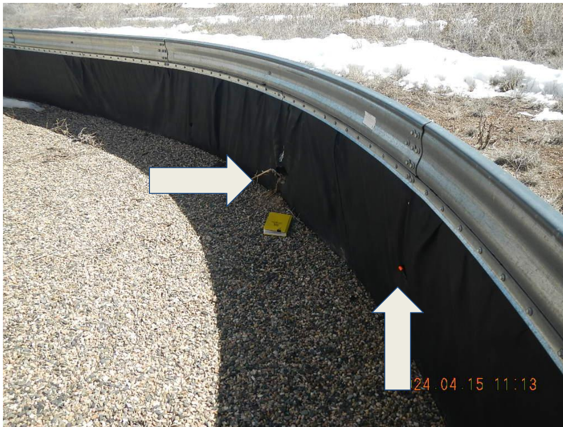
Photo 7. Secondary containment liner compromised with vegetation growth though liner.