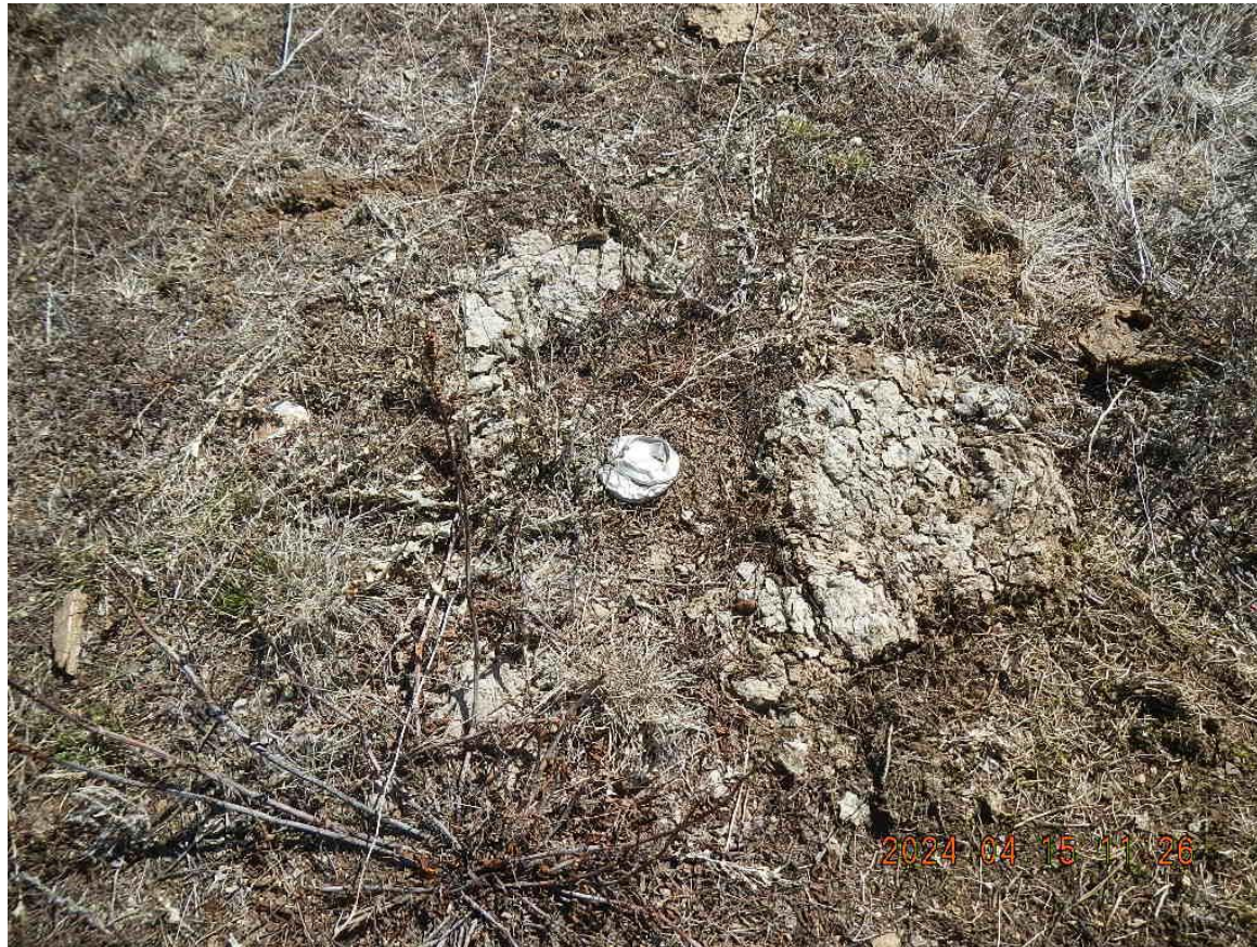
Photo 14. Trash/debris.

Inspection Photos Facility Name: Fuqau 18-15 Pad LocationID: 324766 Apl: 057-06483, Fuqua 19-02-10-1H Date: April 15, 2024