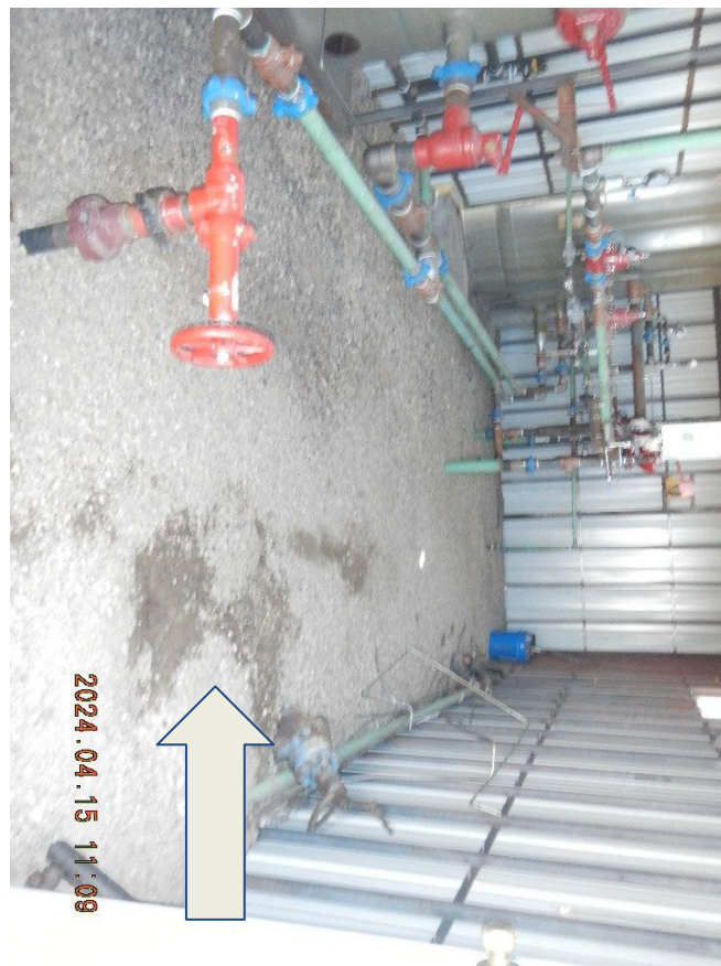
Photo 16. Apparent gravel placed on hydrocarbon stained surface (See Inspection 690900189).