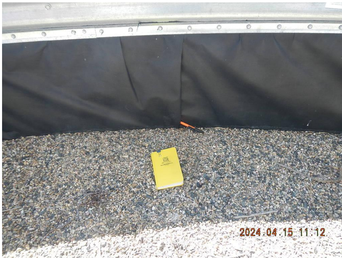
Photo 6. Secondary containment liner compromised.

Inspection Photos Facility Name: Fuqau 18-15 Pad LocationID: 324766 Apl: 057-06483, Fuqua 19-02-10-1H Date: April 15, 2024