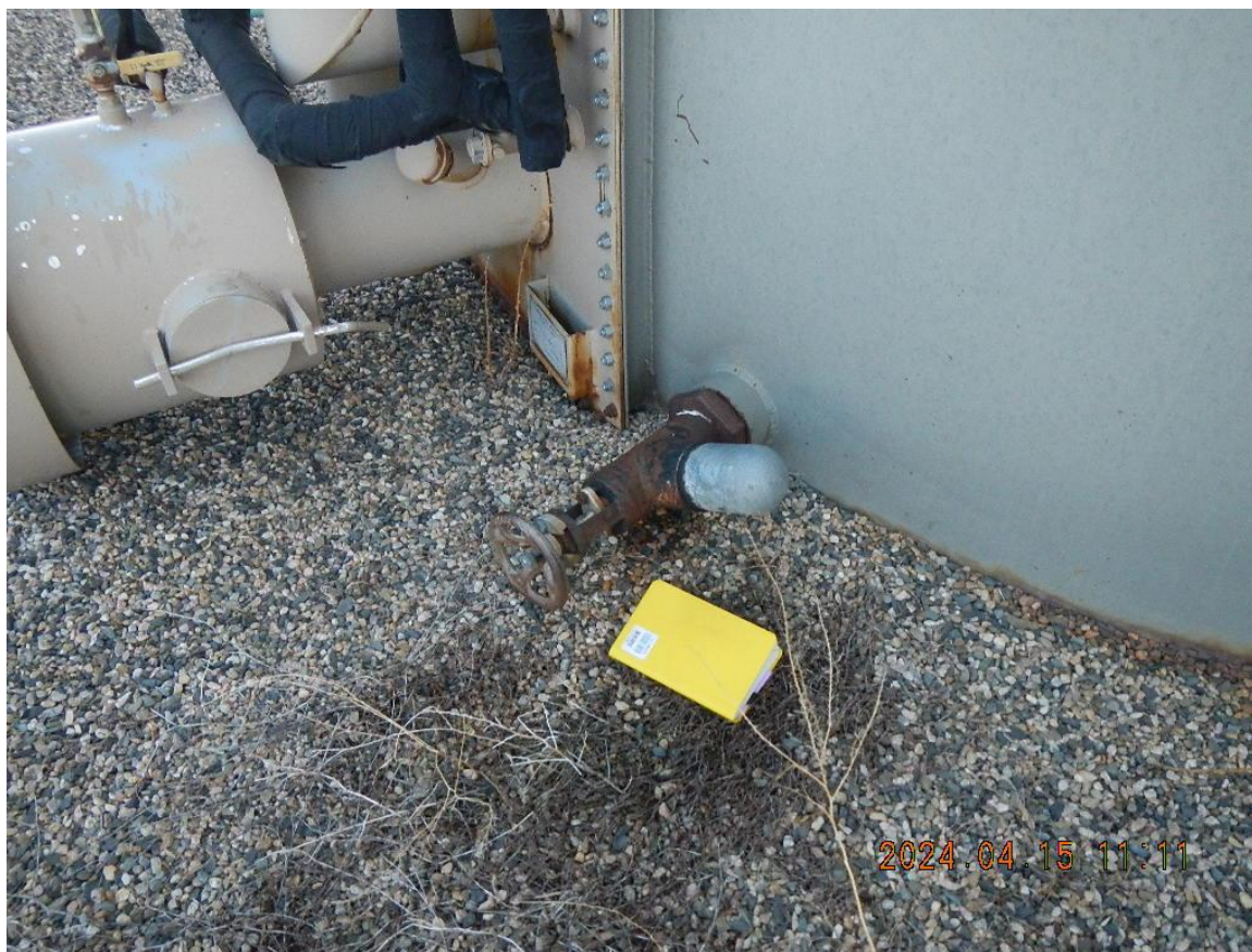
Photo 5. Tank 00163 indicates signs of hydrocarbon staining.