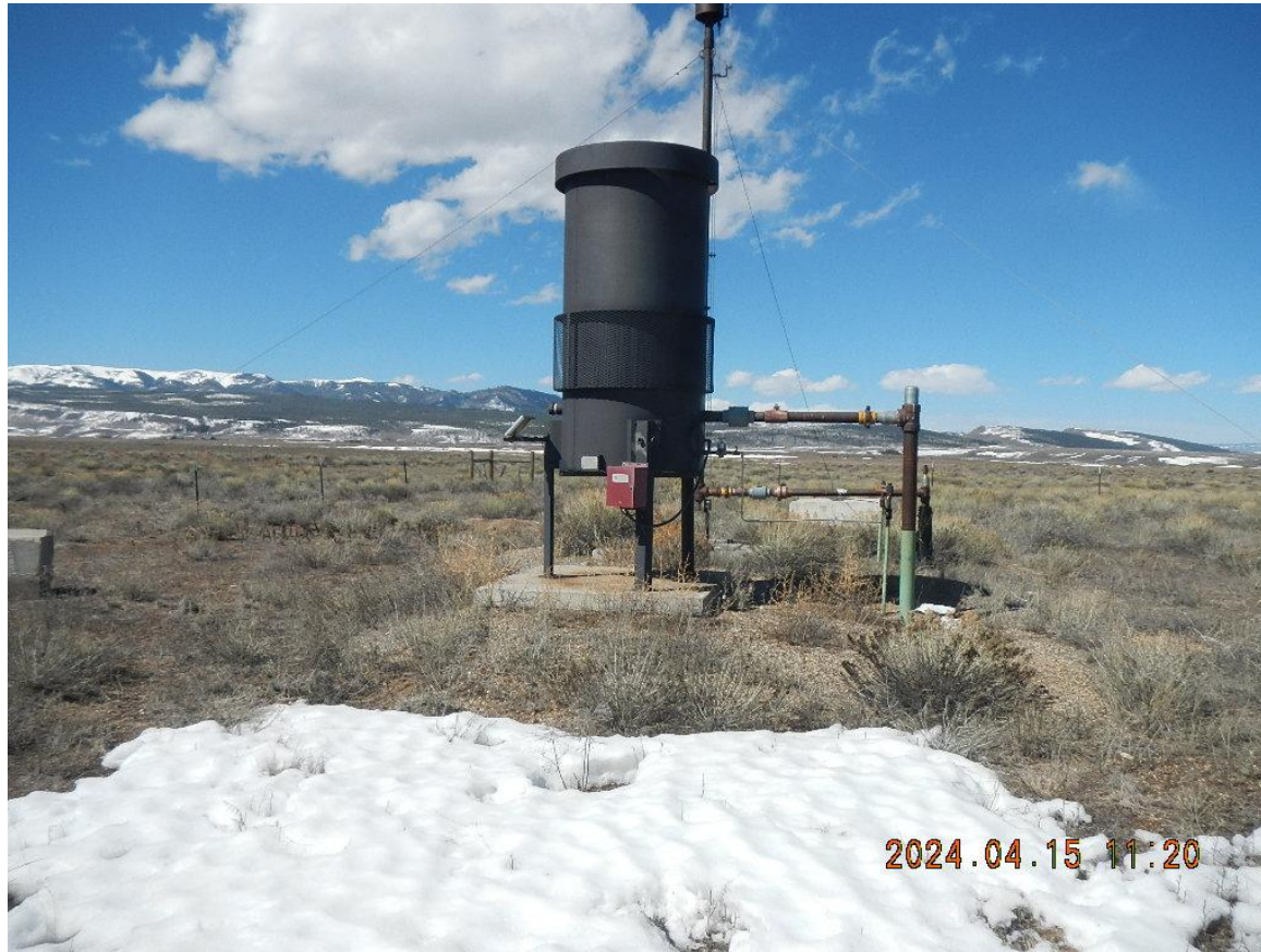
Photo 11. Flare.

Inspection Photos Facility Name: Fuqau 18-15 Pad LocationID: 324766 Apl: 057-06483, Fuqua 19-02-10-1H Date: April 15, 2024