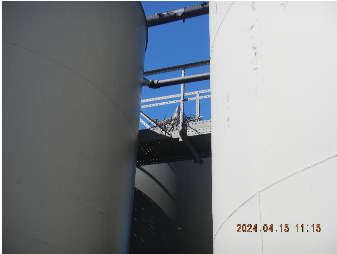
Photo 10. Nest on catwalk.