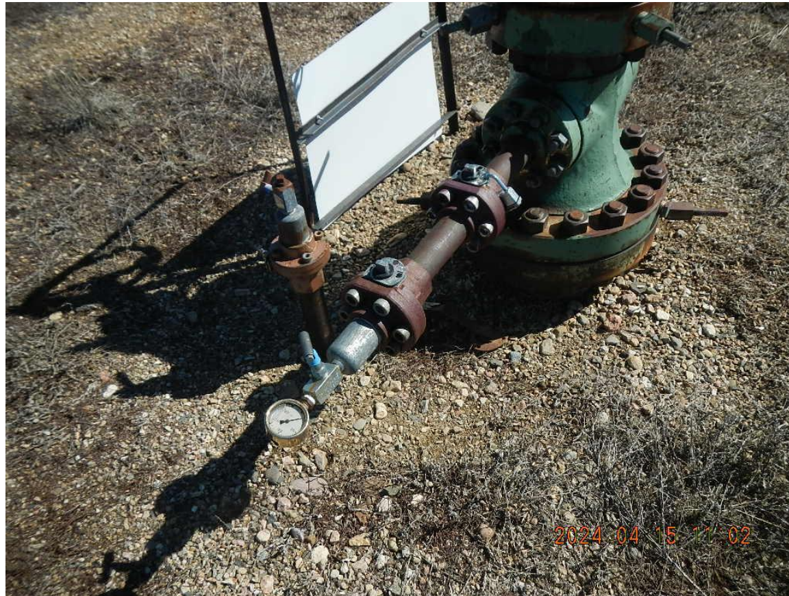
Photo 4. Well is locked out.

Inspection Photos Facility Name: Fuqau 18-15 Pad LocationID: 324766 Apl: 057-06483, Fuqua 19-02-10-1H Date: April 15, 2024