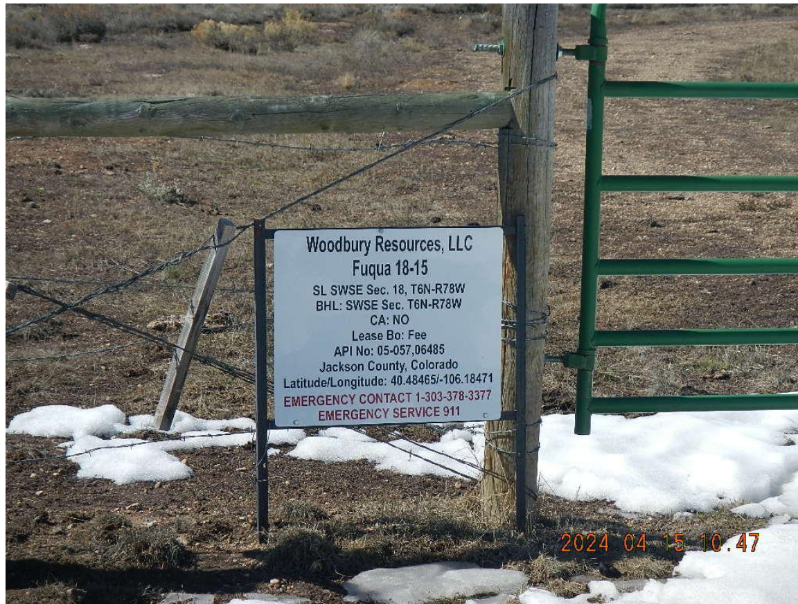
Photo 1. Entrance signage. NOTE: API shown is 05-057-06485, CORRECT API should read 05-057-06483.

Inspection Photos Facility Name: Fuqau 18-15 Pad LocationID: 324766 Apl: 057-06483, Fuqua 19-02-10-1H Date: April 15, 2024