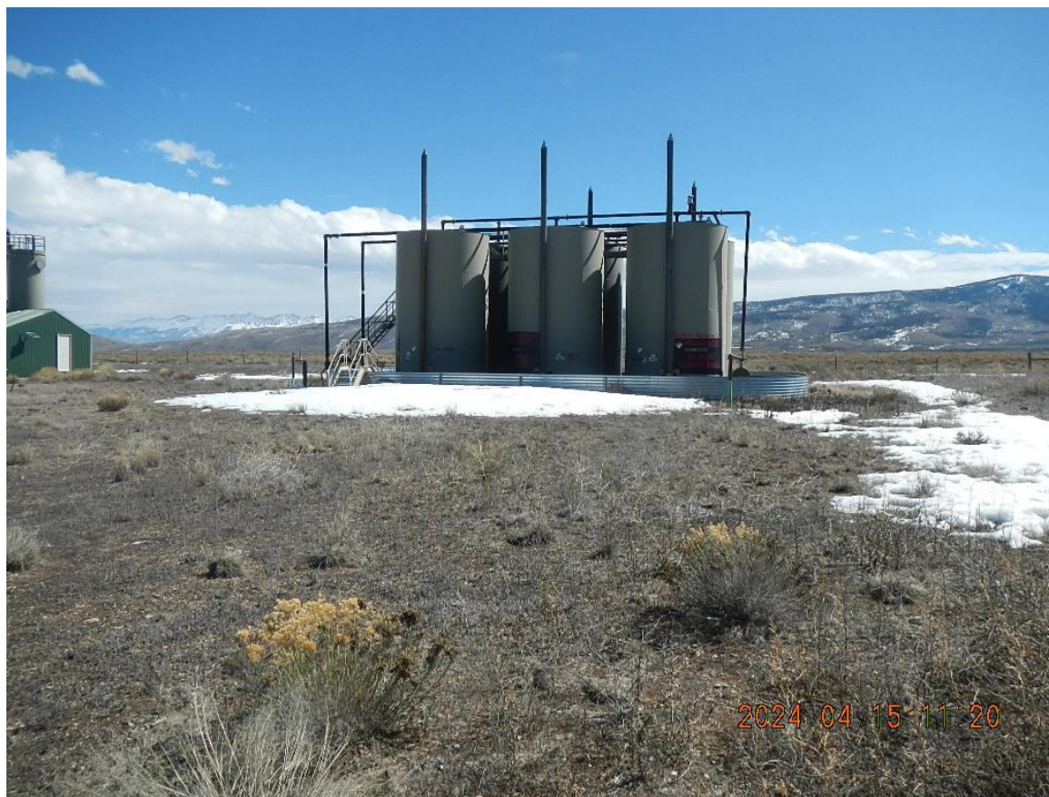
Photo 12. Looking east toward tank battery.