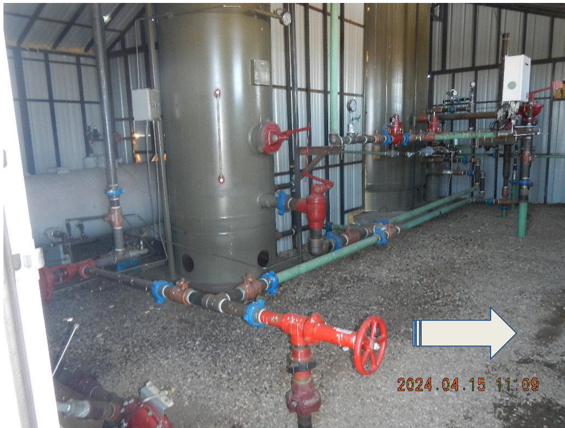
Photo 15. Apparent gravel placed on hydrocarbon stained surface (See Inspection 690900189).

Inspection Photos Facility Name: Fuqau 18-15 Pad LocationID: 324766 Apl: 057-06483, Fuqua 19-02-10-1H Date: April 15, 2024