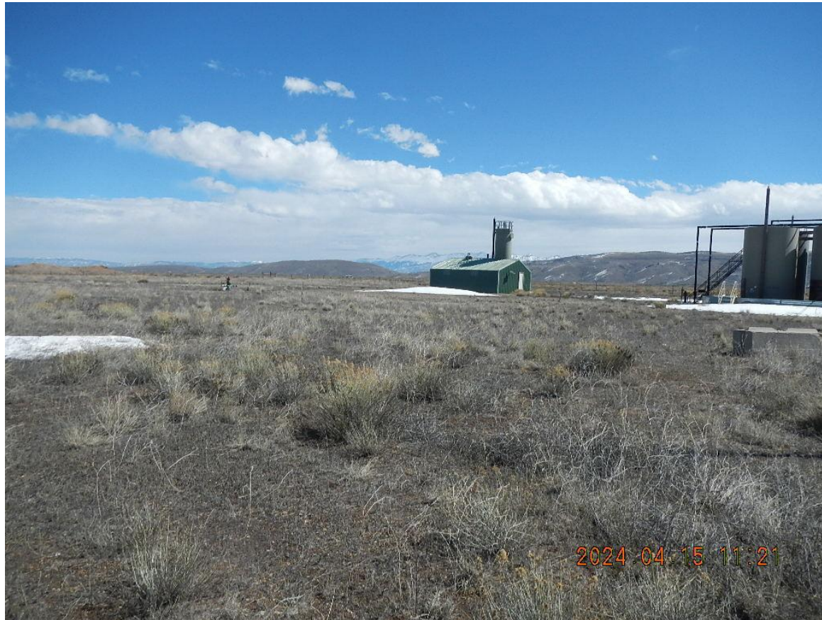
Photo 13. Weeds across location.

Inspection Photos Facility Name: Fuqau 18-15 Pad LocationID: 324766 Apl: 057-06483, Fuqua 19-02-10-1H Date: April 15, 2024