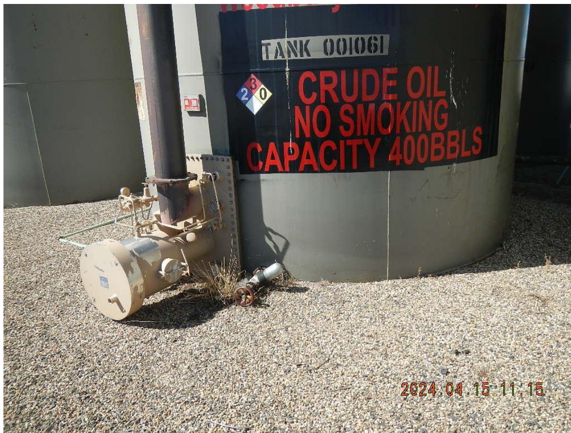
Photo 9. Weeds/Debris near fire tube.