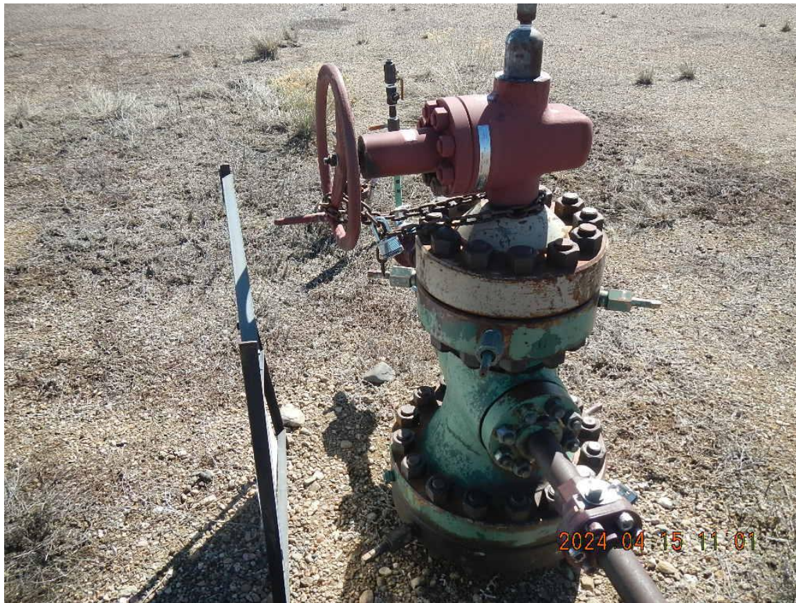
Photo 3. Well is locked out.

Inspection Photos Facility Name: Fuqau 18-15 Pad LocationID: 324766 Apl: 057-06483, Fuqua 19-02-10-1H Date: April 15, 2024