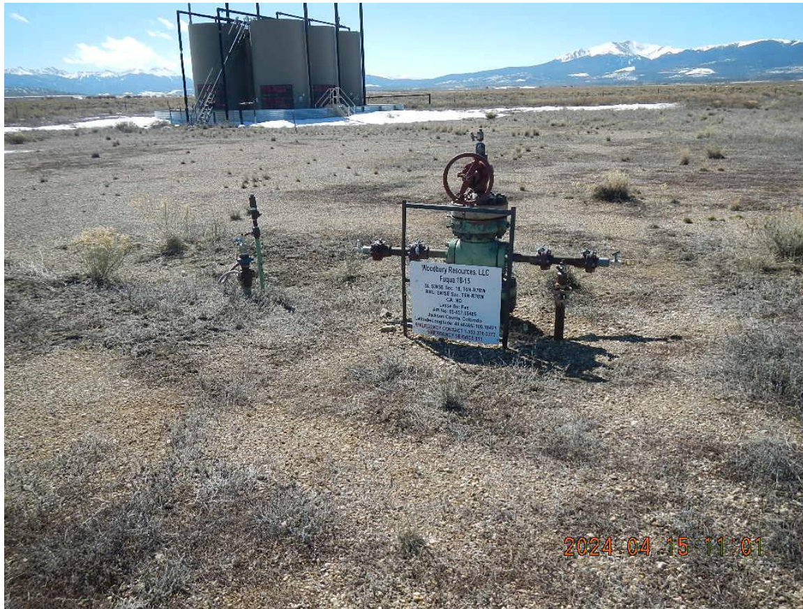
Photo 2. Well signage. NOTE: API shown is 05-057-06485, CORRECT API should read 05-057-06483.