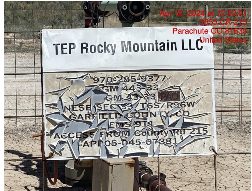
Weathered Wellhead Sign – Photo #00698