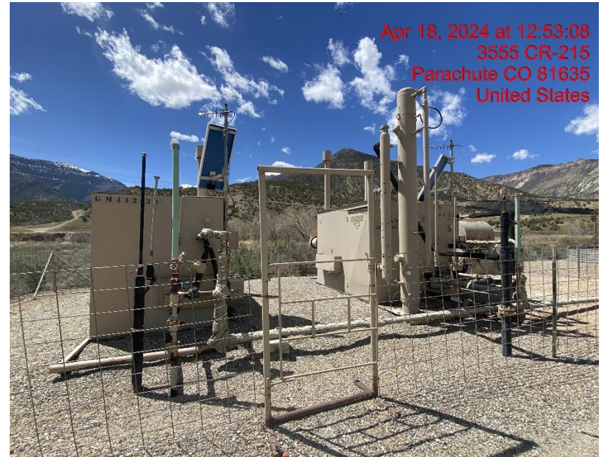
Separators – Photo #00700