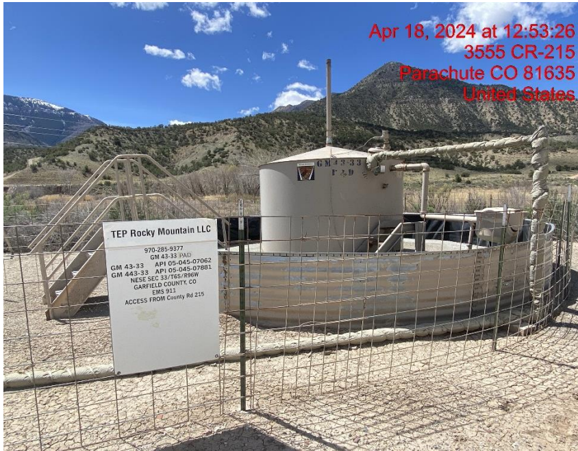
Tank Battery – Photo #00701