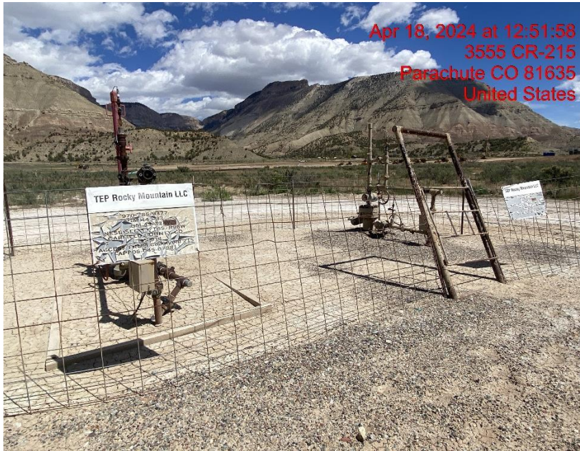
Wellheads – Photo #00697