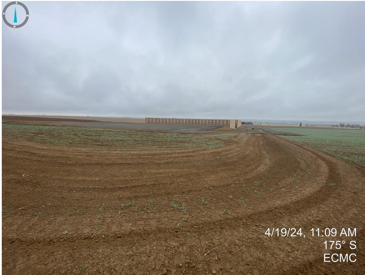
Photo 6. Taken from the northwestern portion of the disturbance area. Perimeter ditch and berm do not appear to be properly stabilized as evidenced by bare/exposed soils.