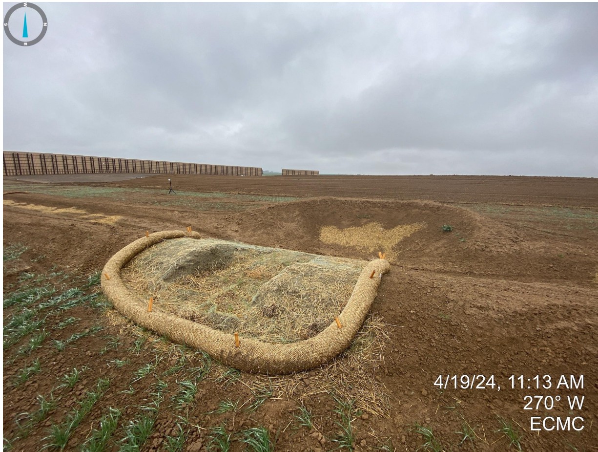
Photo 8. Taken along the east side of the disturbance area. Photo illustrates a sediment trap and temporarily stabilized outlets.