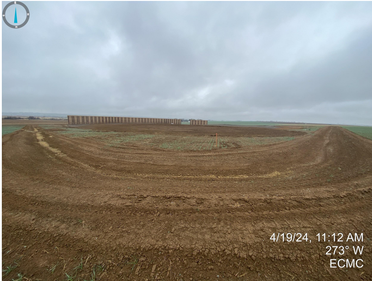
Photo 7. Taken from the northeastern portion of the disturbance area. Perimeter ditch and berm do not appear to be properly stabilized as evidenced by bare/exposed soils.