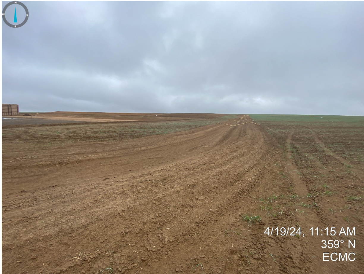
Photo 10. Taken near the eastern/southeastern portion of the disturbance area; see comments in Photo 9.