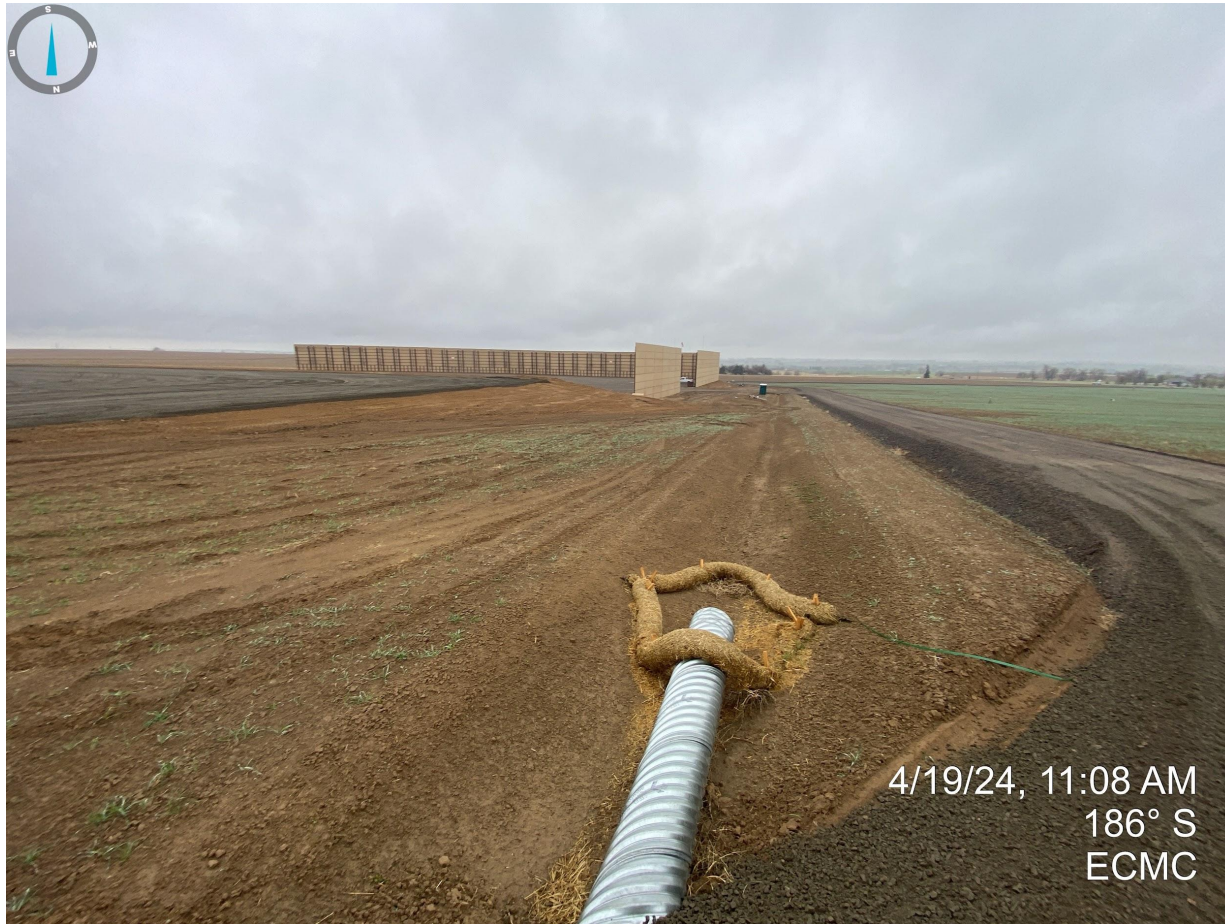
Photo 5. Taken from the western portion of the disturbance area. Stormwater ditch and berm and culvert with temporarily stabilized outlets.