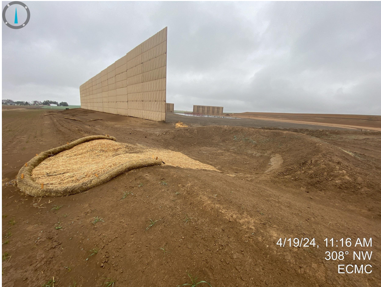
Photo 11. Taken near the eastern/southeastern portion of the disturbance area; see comments in Photo 8.