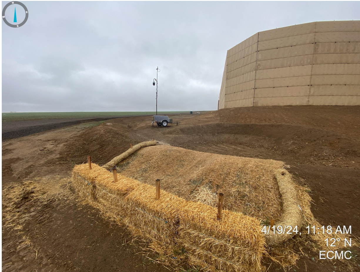
Photo 2. Taken from the southern portion of the disturbance area. Stormwater control measures have been installed during the construction phase of the location. Temporarily stabilized outlets, ditch and berm and sediment traps pictured.