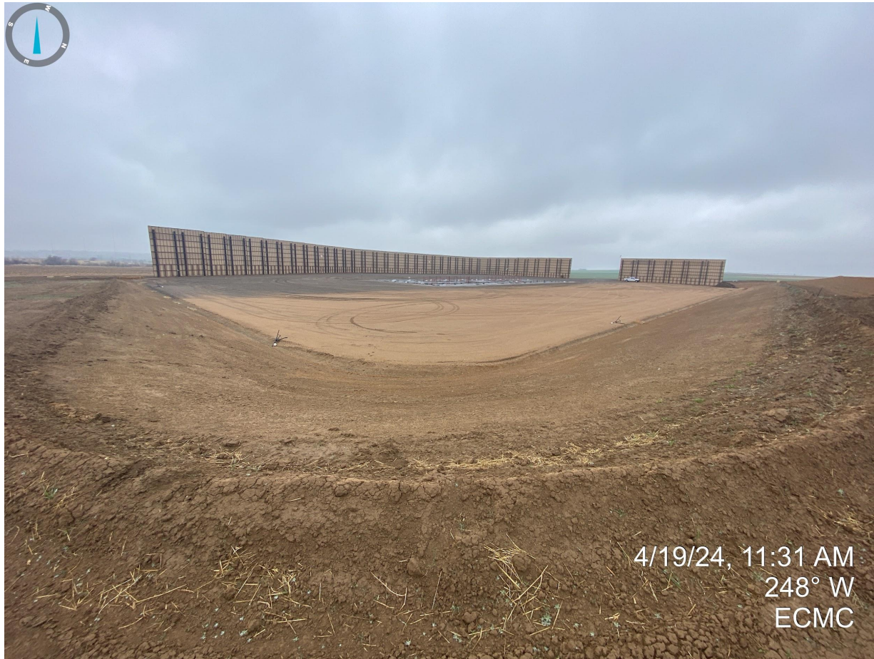
Photo 18. Taken from the cut/fill transition near the proposed well locations. Photo illustrates that cut/fill slopes require additional stabilization BMPs.