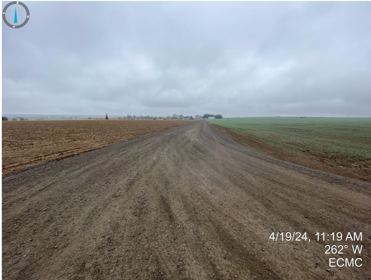
Photo 13. Facing west near the construction area. Photo illustrates that the existing county road has been improved and stabilized.