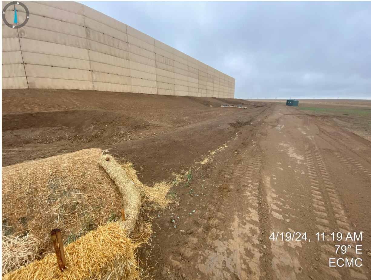
Photo 2. Taken near the southern portion of the disturbance area; see comments in Photo 1.