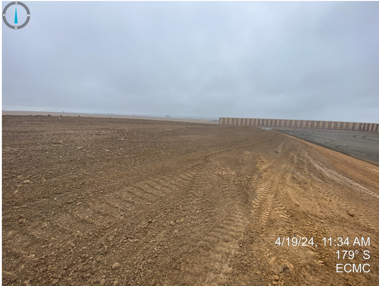
Photo 21. Taken from the eastern side of the topsoil stockpile; see comments in Photo 19.