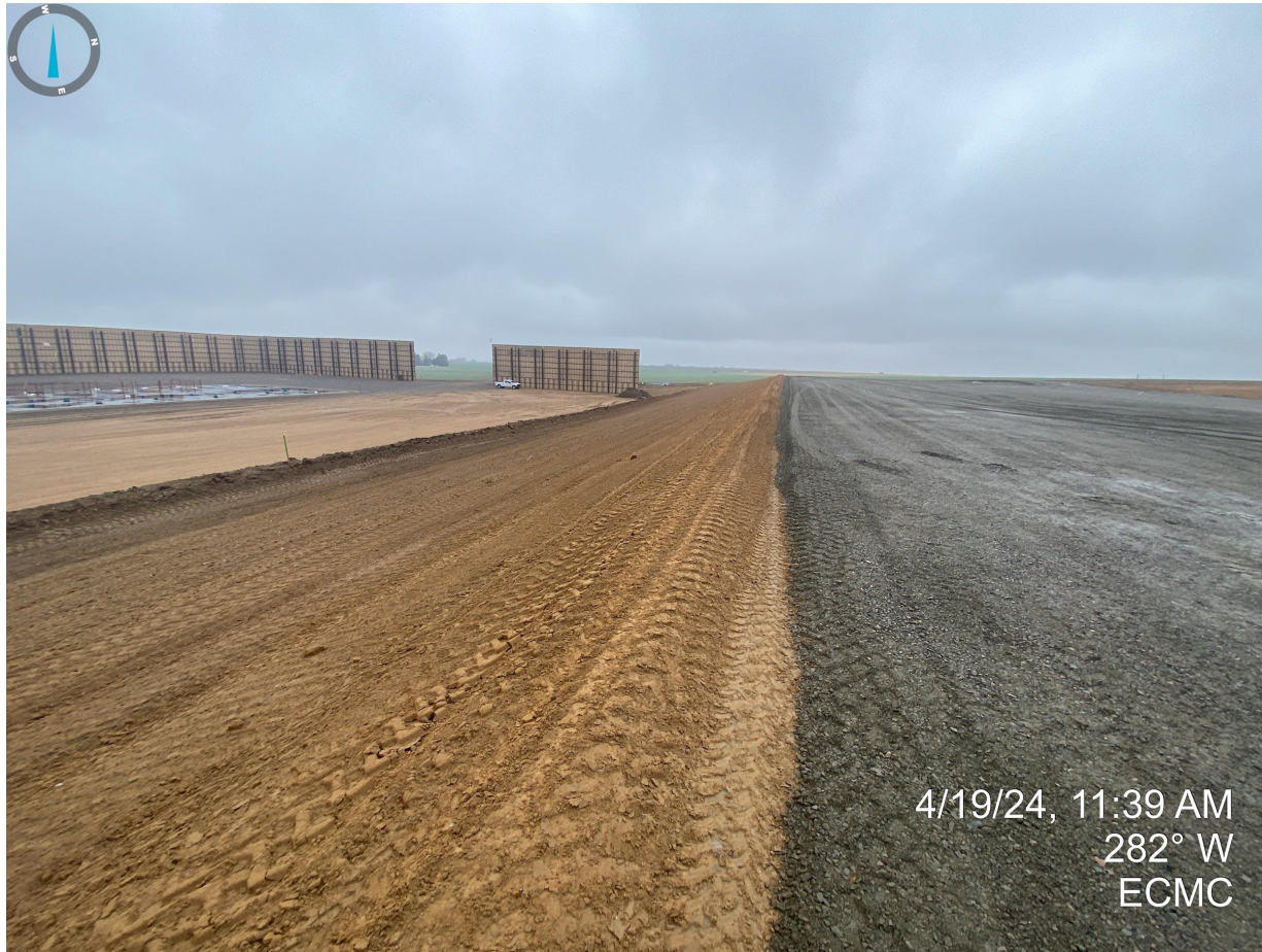
Photo 16. Taken from the cut/fill transition near the proposed production facility location. Photo illustrates that cut/fill slopes require additional stabilization BMPs.