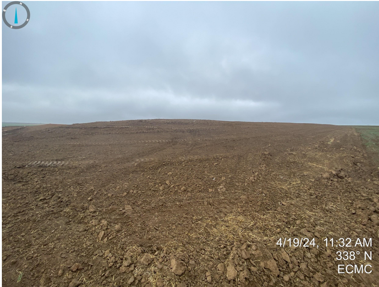
Photo 19. Taken from the southeast corner of the topsoil stockpile. Photo illustrates that the stockpile requires additional temporary stabilization BMPs.