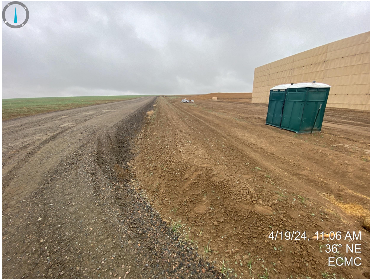
Photo 4. Taken from the western portion of the disturbance area. Stormwater ditch and berm installed along the temporary access road to the working pad surface.