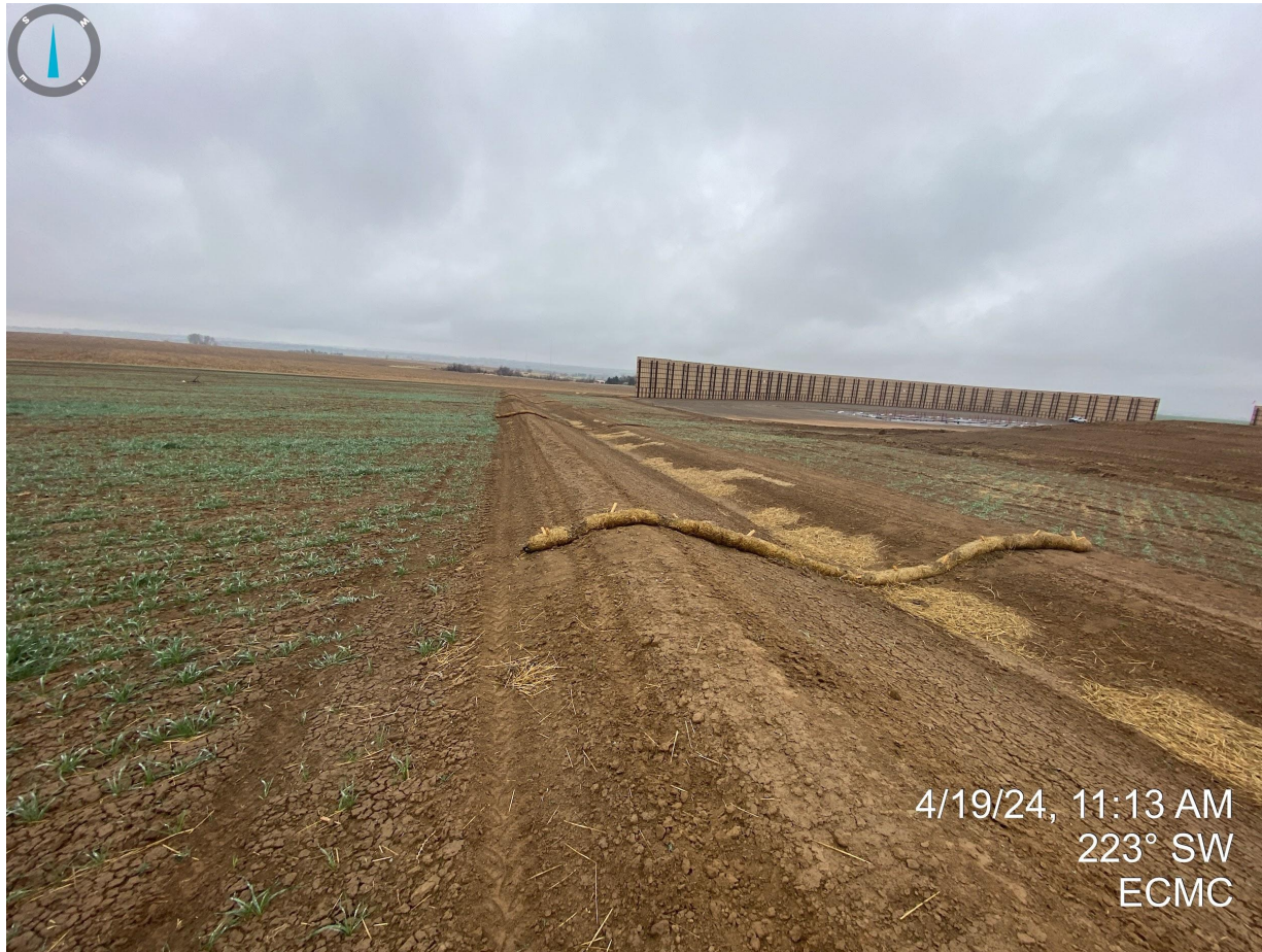
Photo 9. Taken along the eastern side of the disturbance area. erosion control logs installed in the perimeter stormwater ditch. Perimeter ditch and berm do not appear to be properly stabilized as evidenced by bare/exposed soils