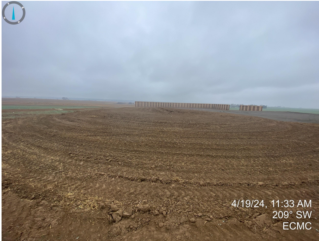
Photo 20. Taken from the northern portion of the topsoil stockpile; see comments in Photo 19.