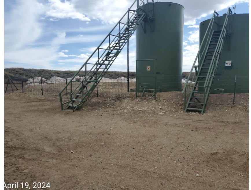
Photo 1: Photos 1-2 taken from the west end of the Location. Photo provides and overview from north, northeast, southeast to south. Photos also show signage missing from the battery facility.