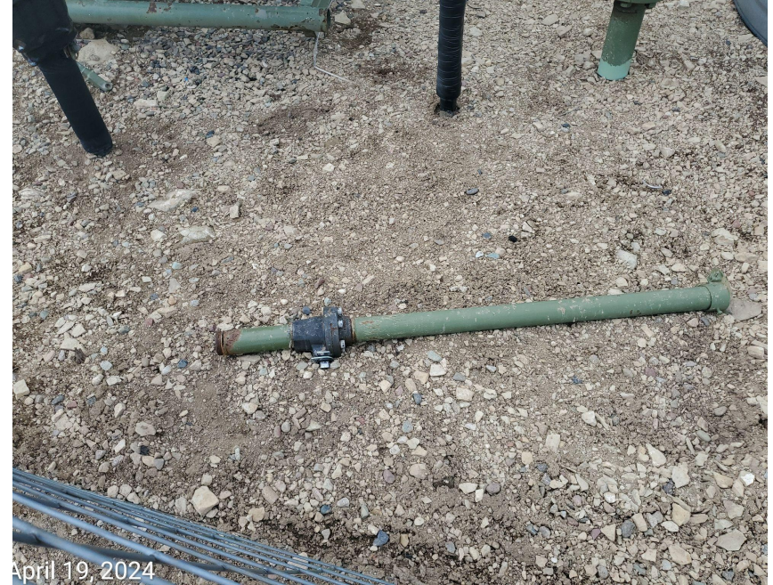
Photo 5: Unused equipment (Fence, pipe) observed at the separator equipment.