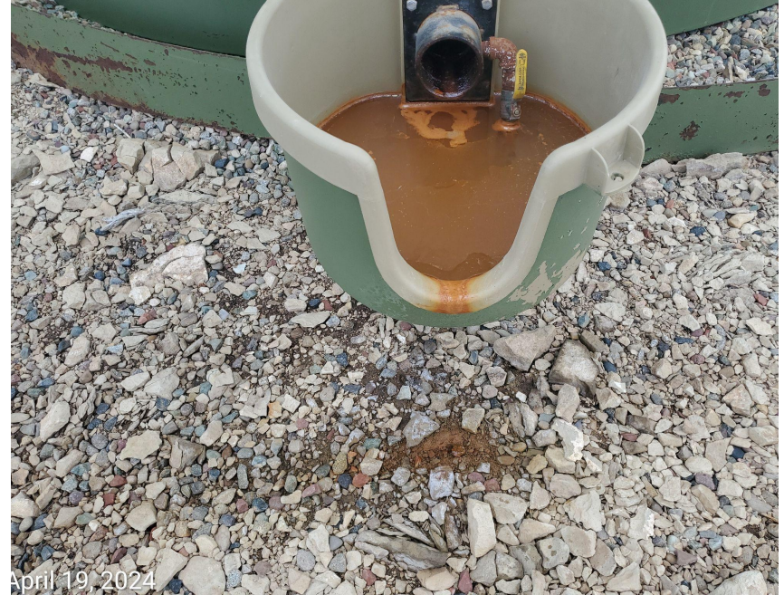
Photo 3: Lines at tanks missing cap/plug. Photo right shows line at condensate is leaking, with fluids spilling out of the honeypot. Inspector contacted/left message with Operator upon discovery. Leak requires stopping, and fluids/impacts require removal/cleaning.