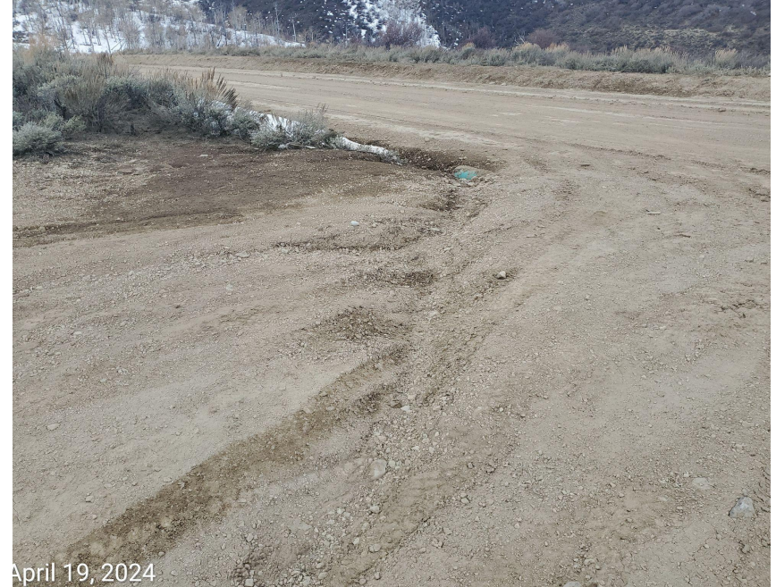
Photo 6: Photos taken from the Location entrance. Runoff from the pad is resulting in erosion, degradation and sediment transport. Stormwater and erosion control BMPs missing or insufficient.